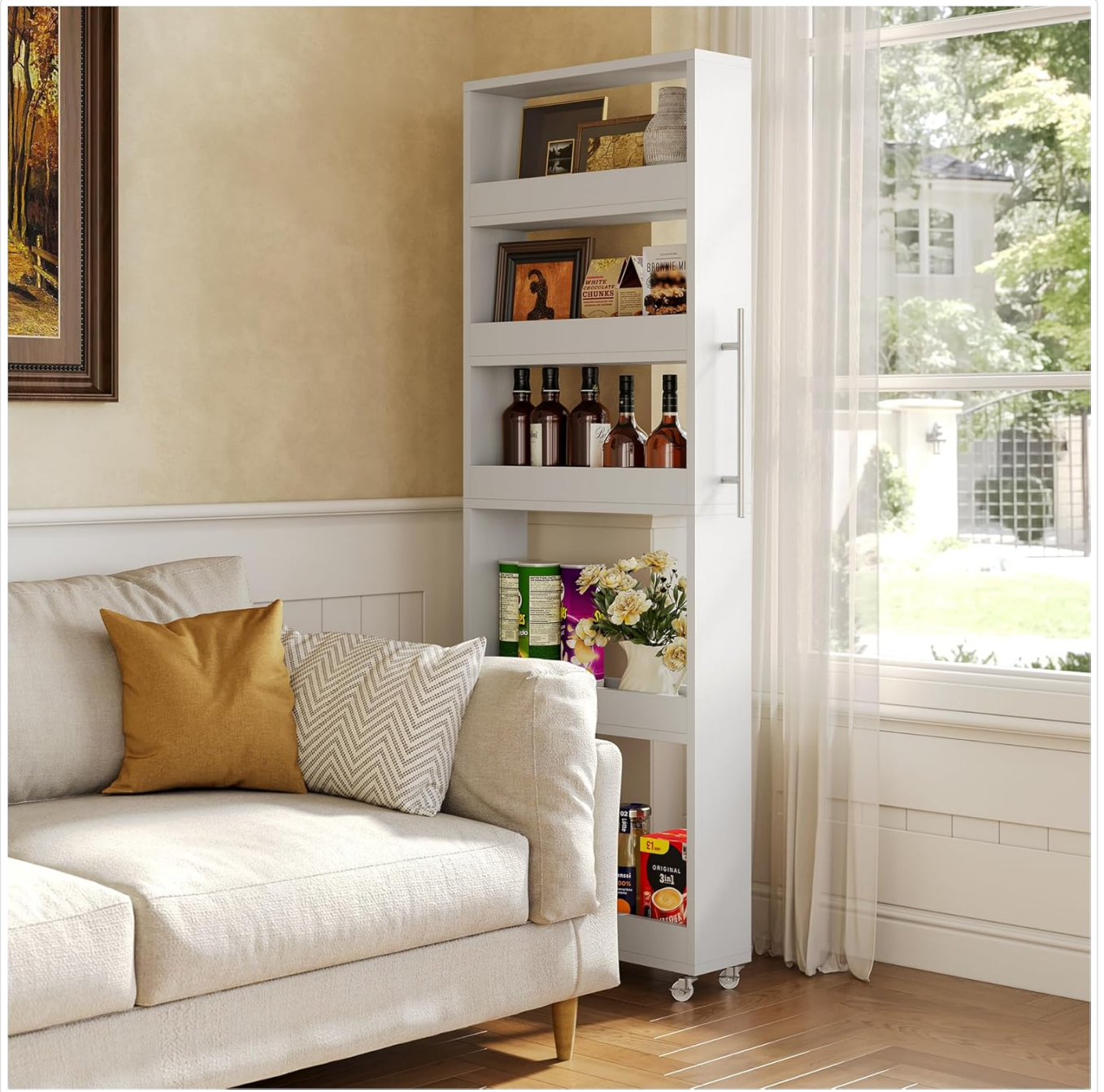
Side profile of the storage cart, highlighting its narrow depth.