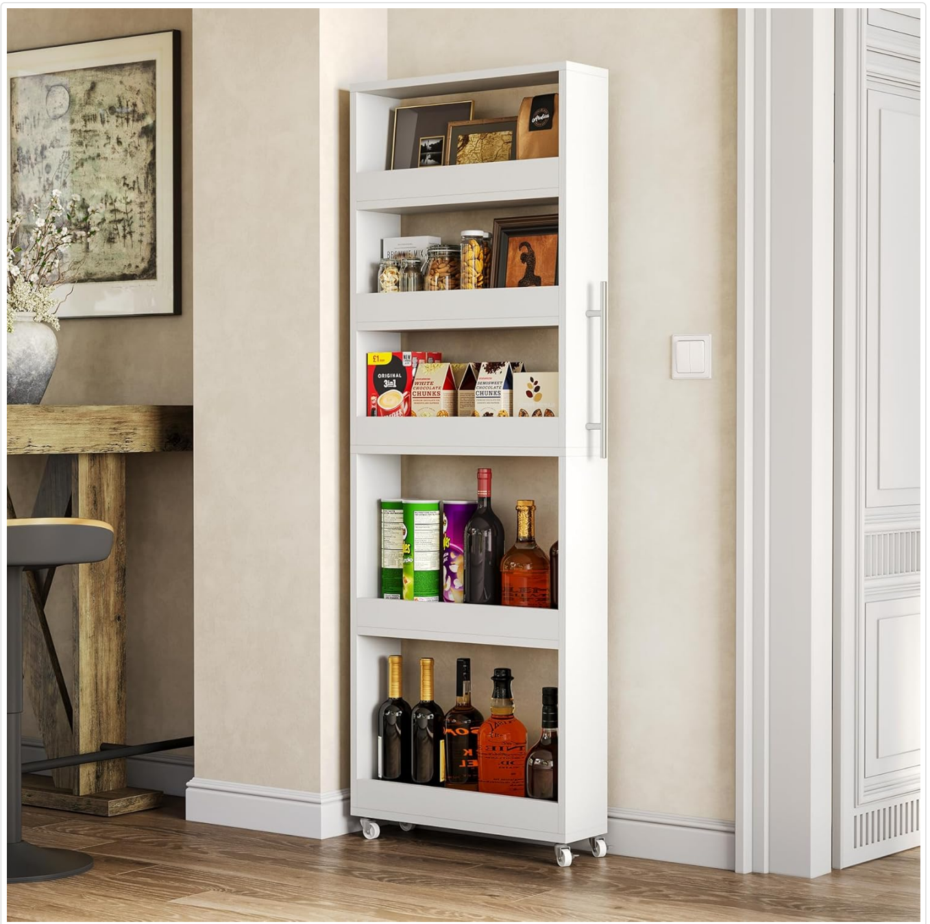
Internal view of the shelves, featuring raised guardrails to prevent items from falling.