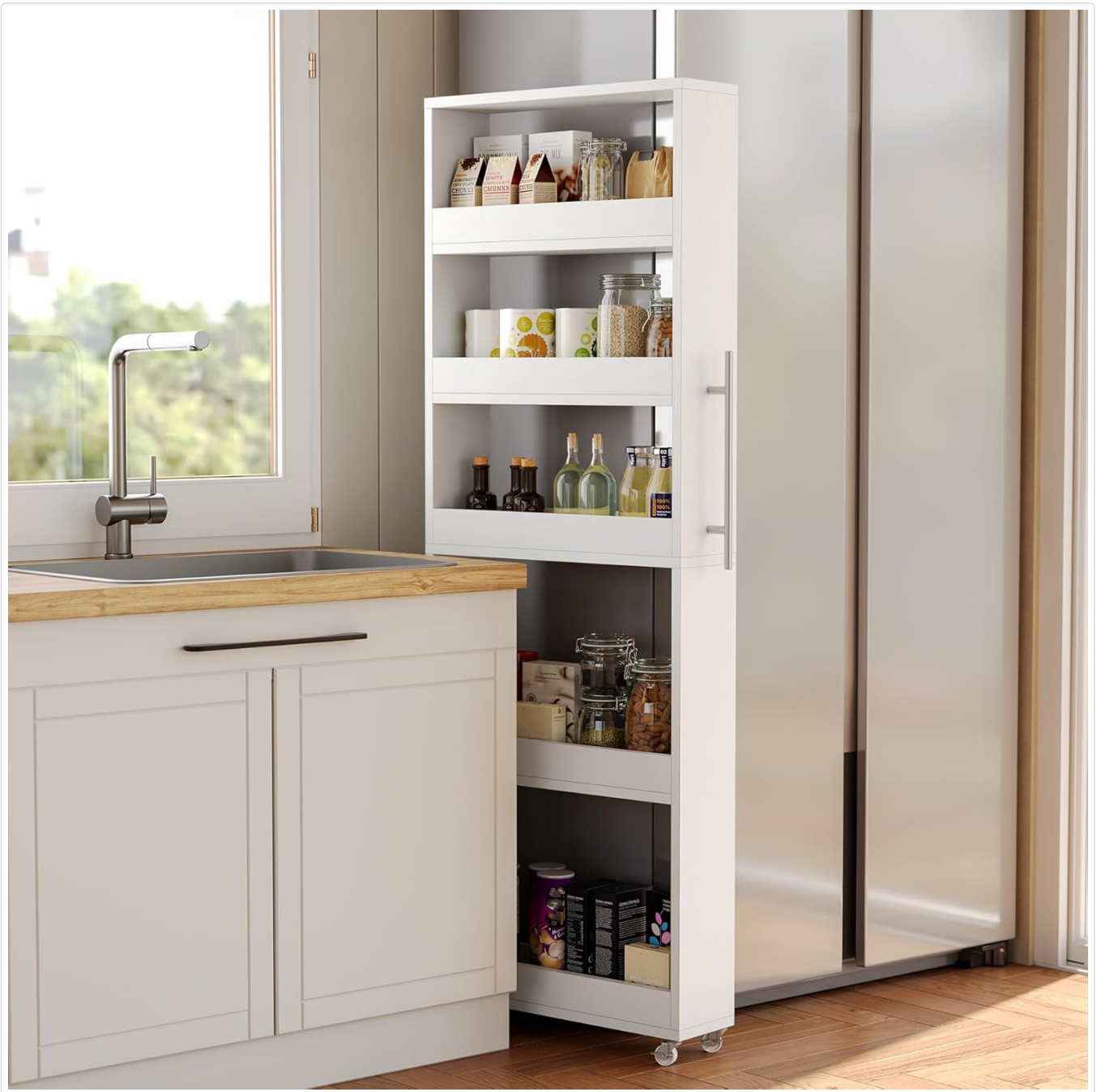
Detail of the sturdy metal handle for easy pulling and the smooth-gliding swivel wheels.