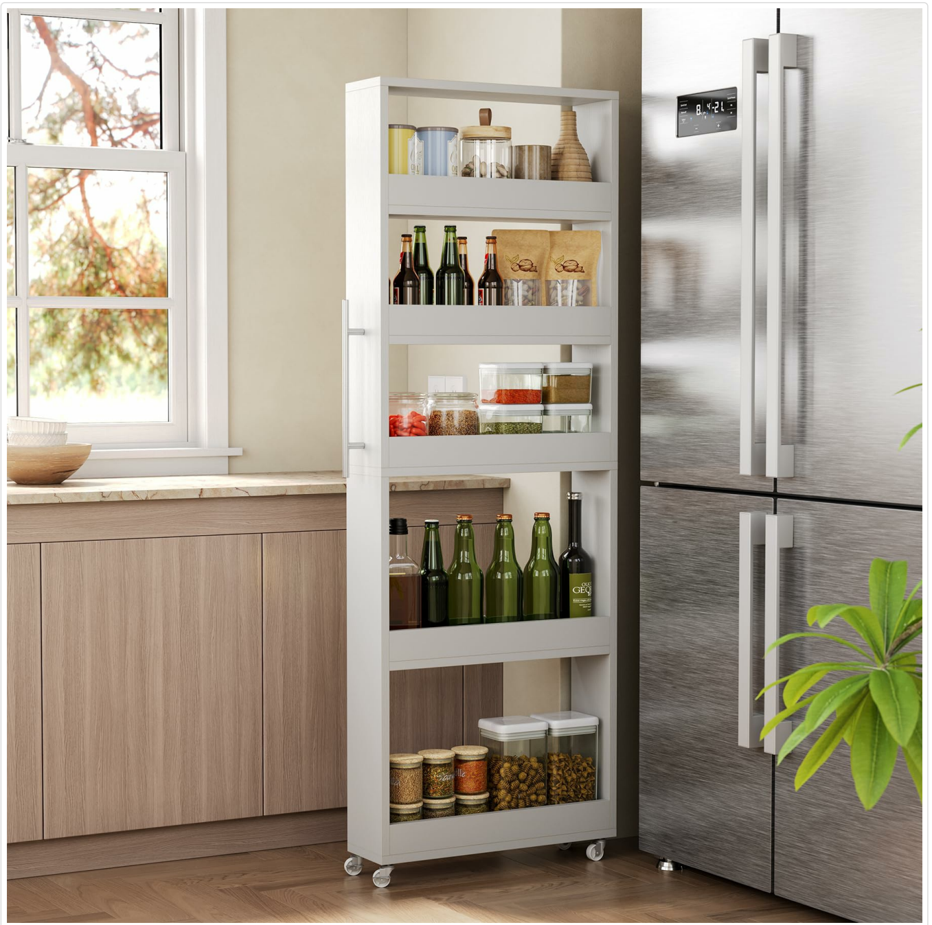
Front view of the assembled storage cart, showcasing its five tiers and slim design.

Detailed dimensions of the storage cart, including overall height, width, depth, and individual shelf clearances.