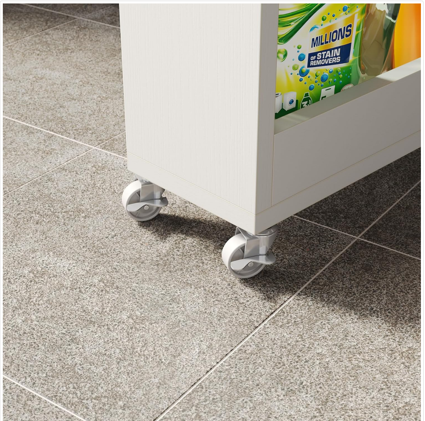
Demonstration of the cart's versatility in a living room setting, storing various household items.