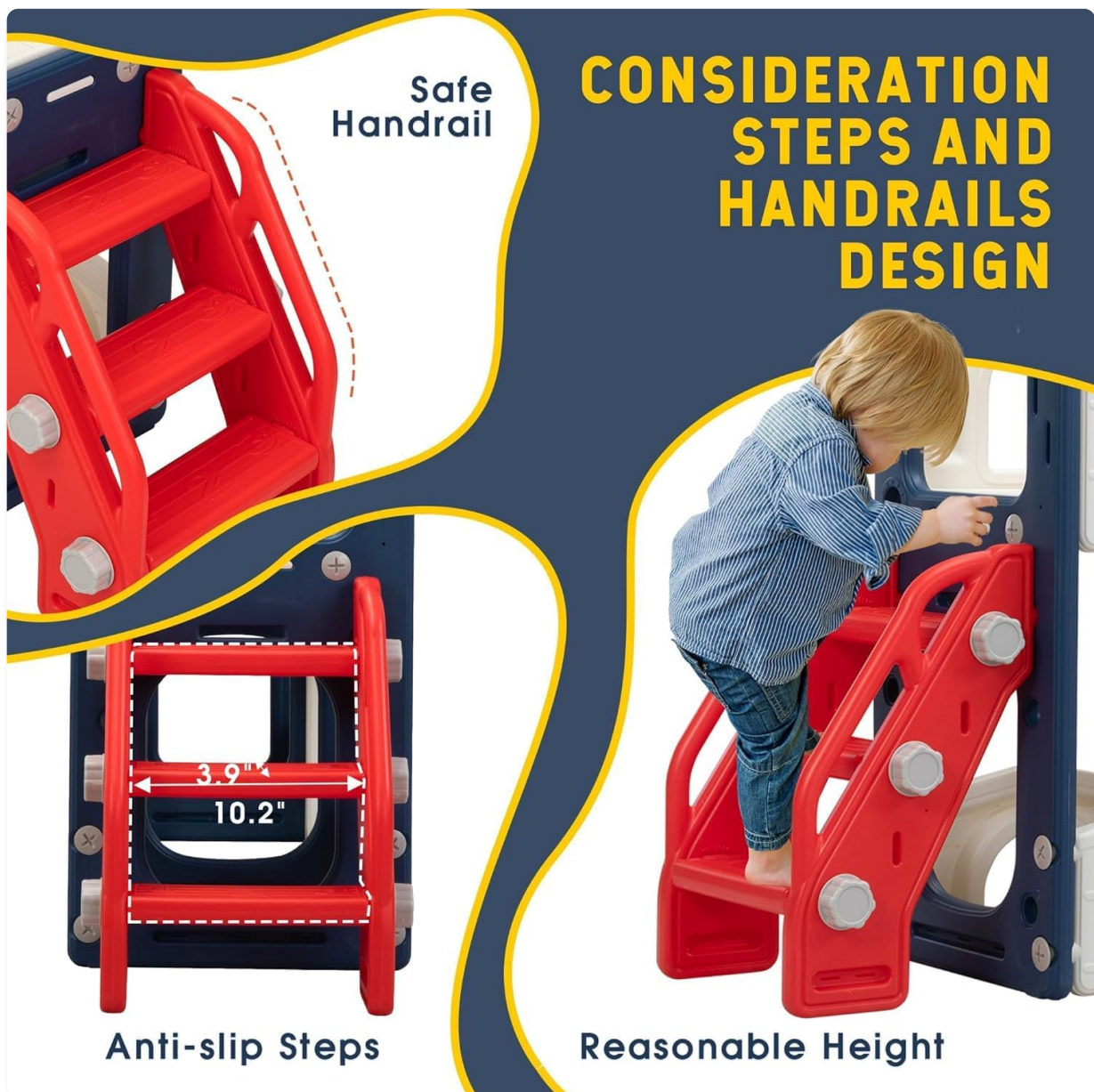
Figure 5.2: Safe handrail and anti-slip steps design.