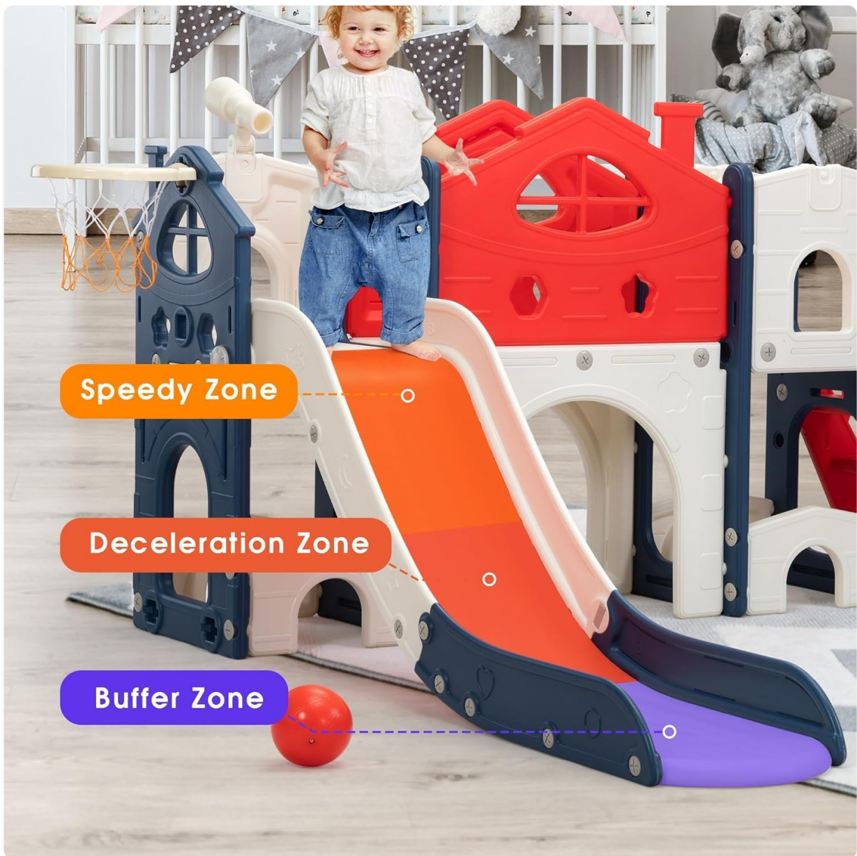
Figure 5.1: Slide zones for safe play.