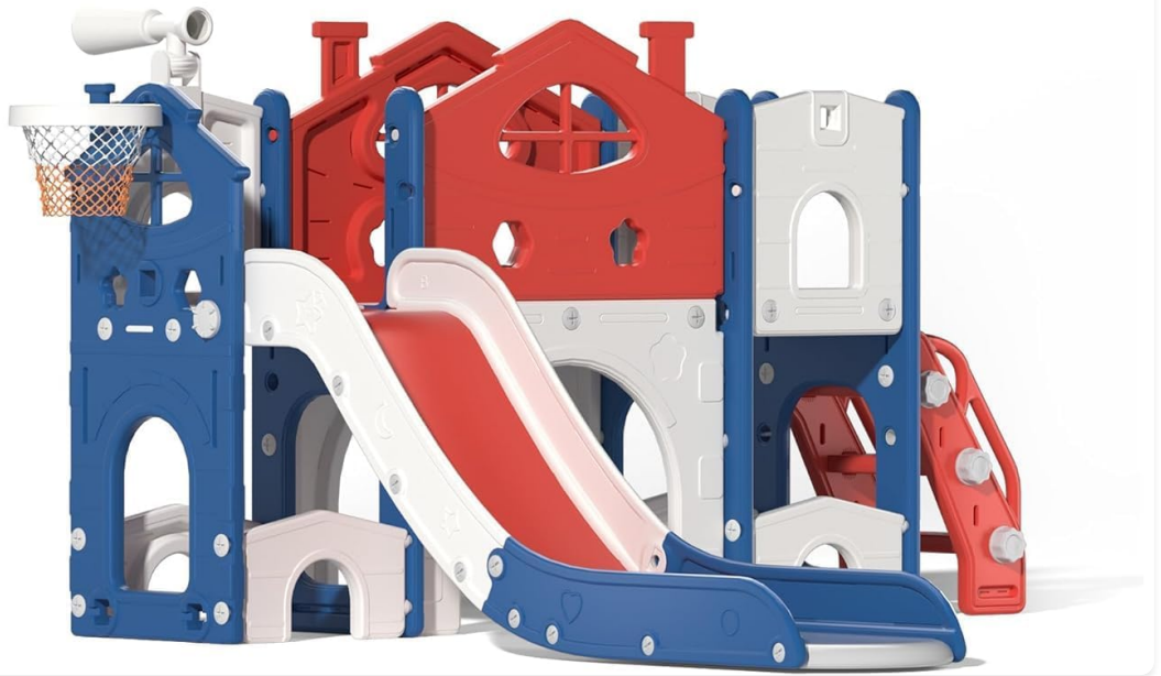
Figure 4.1: Fully assembled playset.