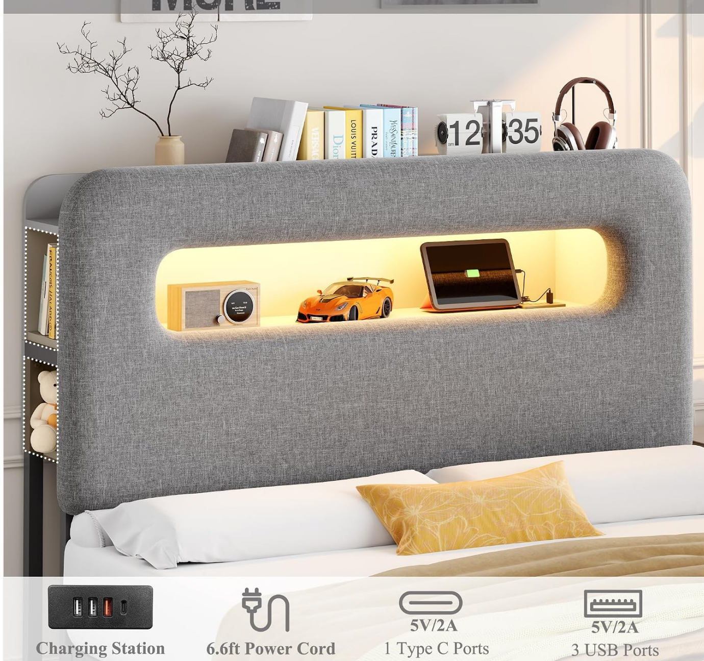
Figure 4.2: Detail of the headboard's charging station, featuring USB-A and USB-C ports, alongside the illuminated LED light strip.