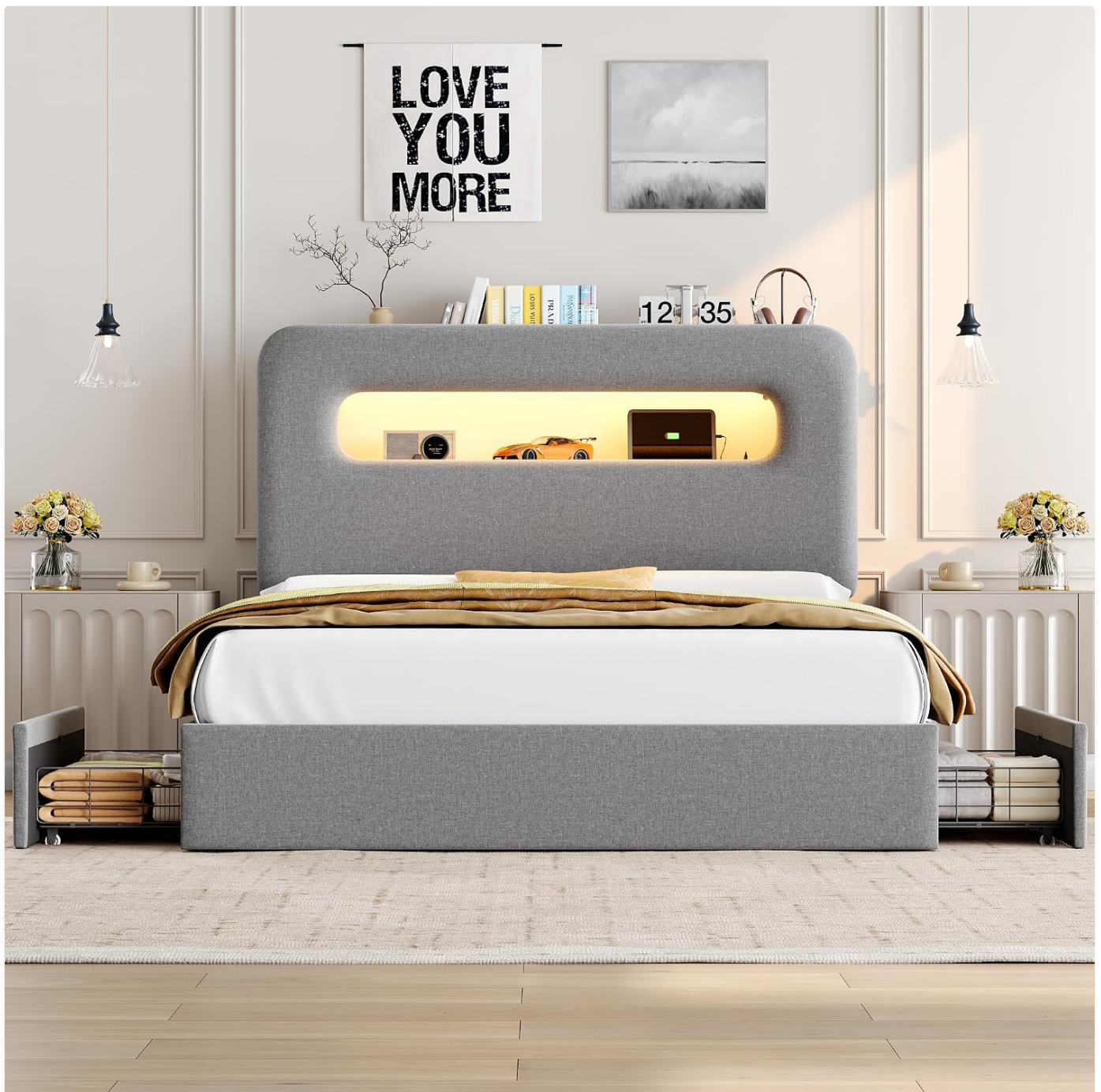
Figure 1.1: The HOSTACK Queen LED Bed Frame, showcasing its modern design, storage headboard, and under-bed drawers.