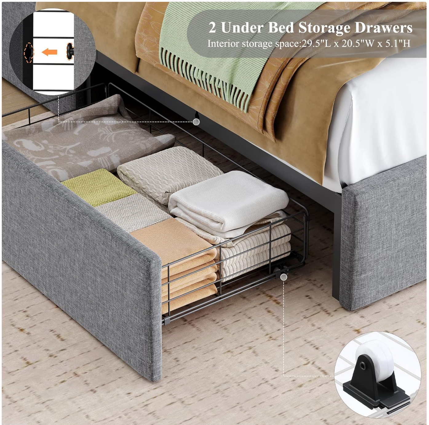
Figure 4.3: An open under-bed drawer filled with folded items, highlighting its storage capacity and the easy-gliding wheels for smooth operation.