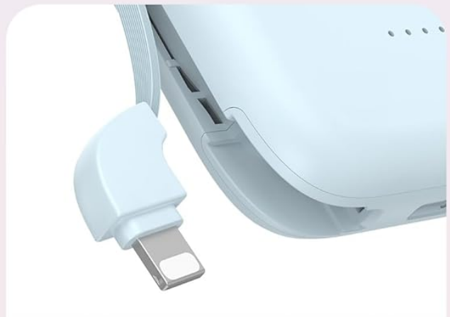
For iPhone Cable