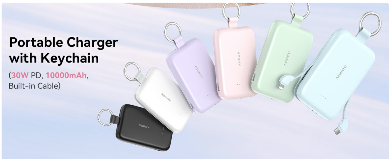
Figure 3: Illustrating PD 30W fast charging capability.