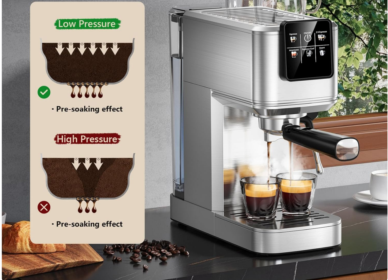
Image: Front view of the KEENSTAR 20Bar Espresso Machine, showcasing its sleek stainless steel design and key operational areas.