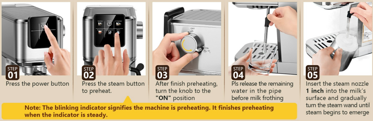
Image: Visual steps for priming the espresso machine before its first use or after a period of inactivity. This process drains air from the internal pipes.

Note: If you forget to press the steam button to preheat, it can not steam milk. Water will run out from the steam wand like a line.