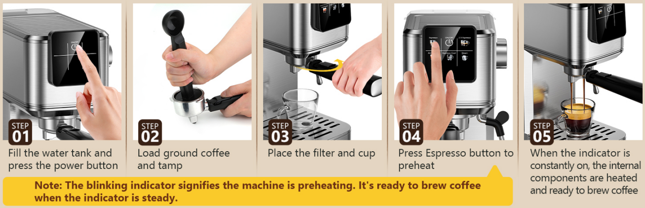
Image: Step-by-step visual instructions for brewing espresso, from preparing the machine to the final extraction.

Note: Ensure the steam knob is set to "OFF" position before brewing coffee, otherwise, the machine can't brew.