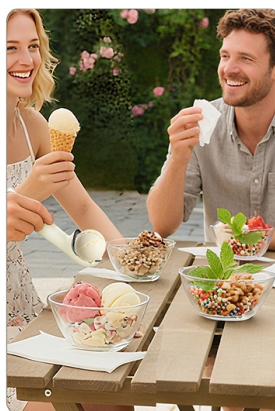
Ice Cream Party