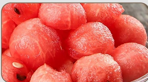
Sorbet melon ball