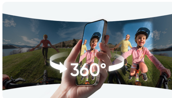
Image 4.2: Demonstrating the effectiveness of FlowState Stabilization for smooth video.

Never aim the camera, always get the shot. Just hit record, live in the moment, and pick the best angles later in the Insta360 app.