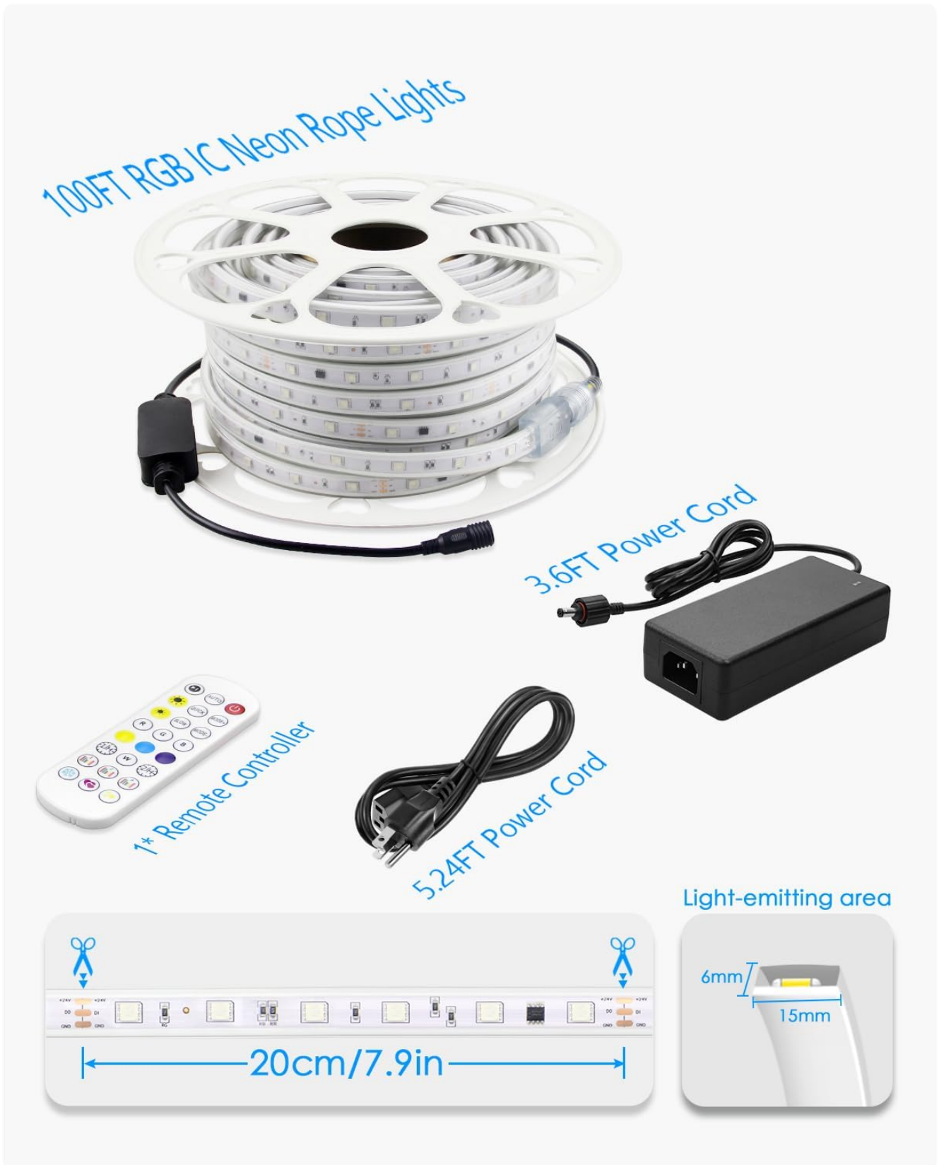
Image: Package contents and LED strip dimensions. The image displays the coiled 100ft LED strip, a remote controller, a 24V power adapter with its power cord, and a detailed view of the LED strip indicating a cutting interval of 20cm (7.9in) and its cross-sectional dimensions (6mm light-emitting area, 15mm width).

Note: This product does not include adhesive backing. Mounting clips and screws are provided for secure installation.