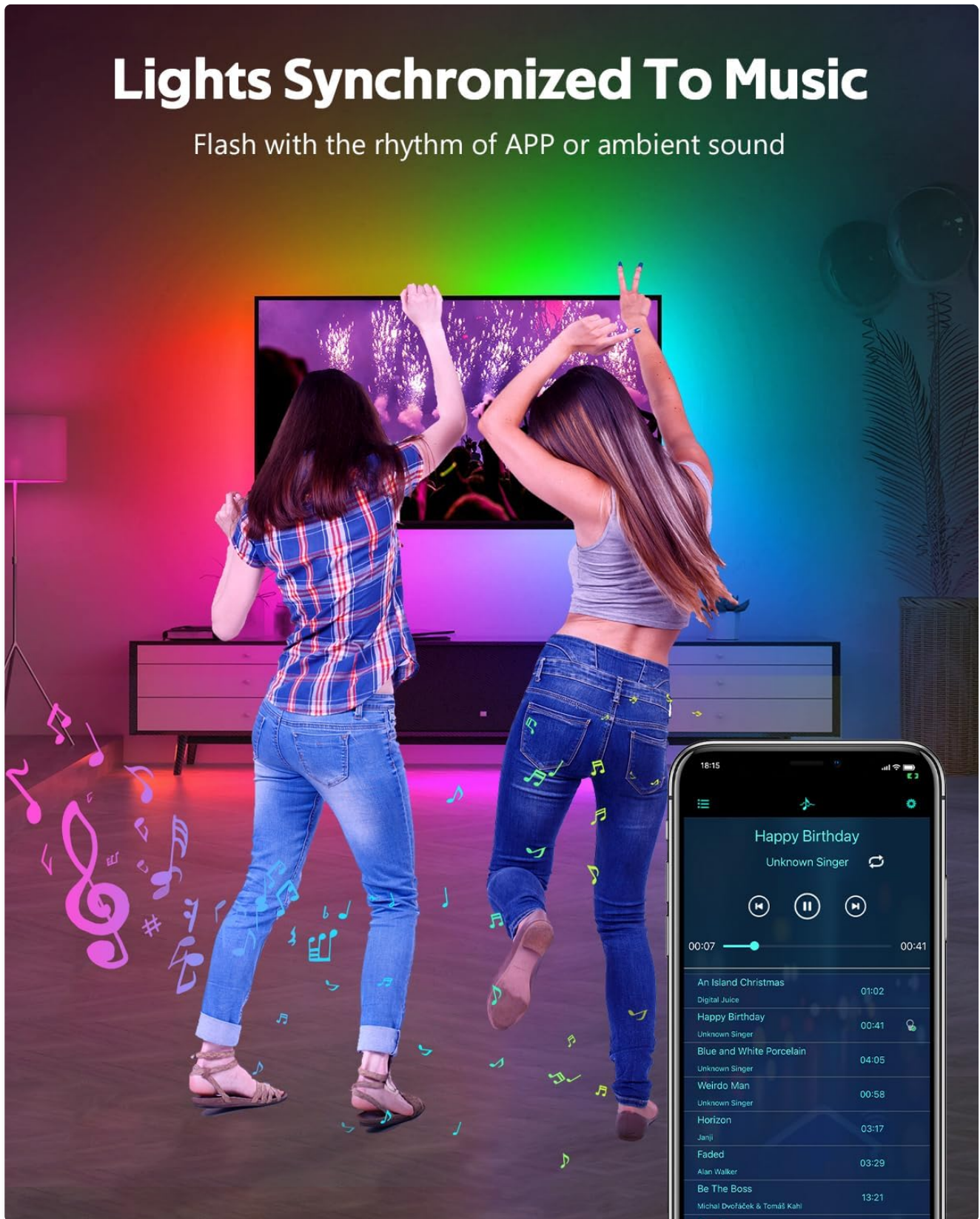
Image: Lights synchronized to music. The image shows LED strip lights changing colors in rhythm with music, controlled by a smartphone app.