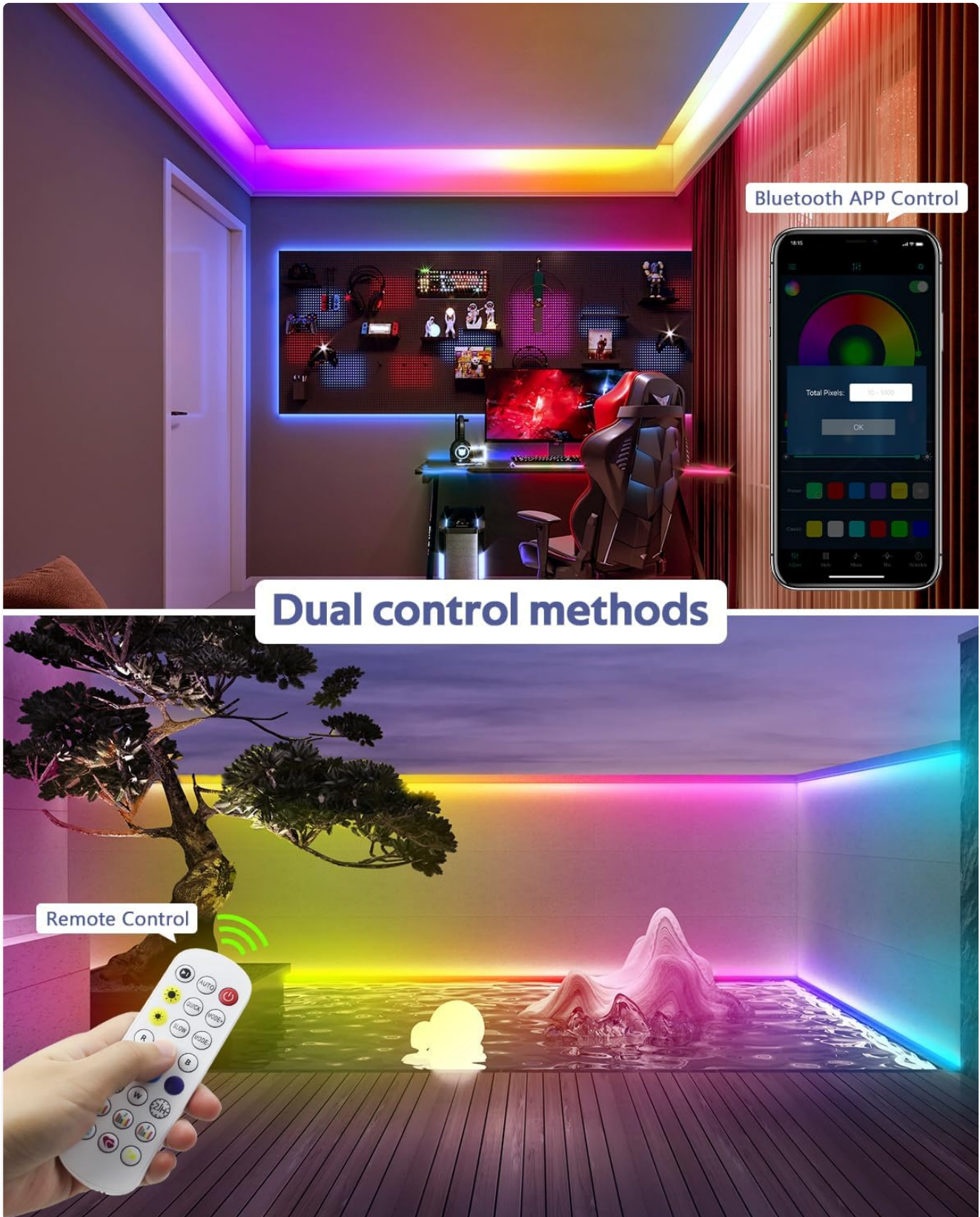
Image: Dual control methods. The image illustrates both the Bluetooth app control on a smartphone and the physical remote control being used to manage the LED strip lights installed in different settings.