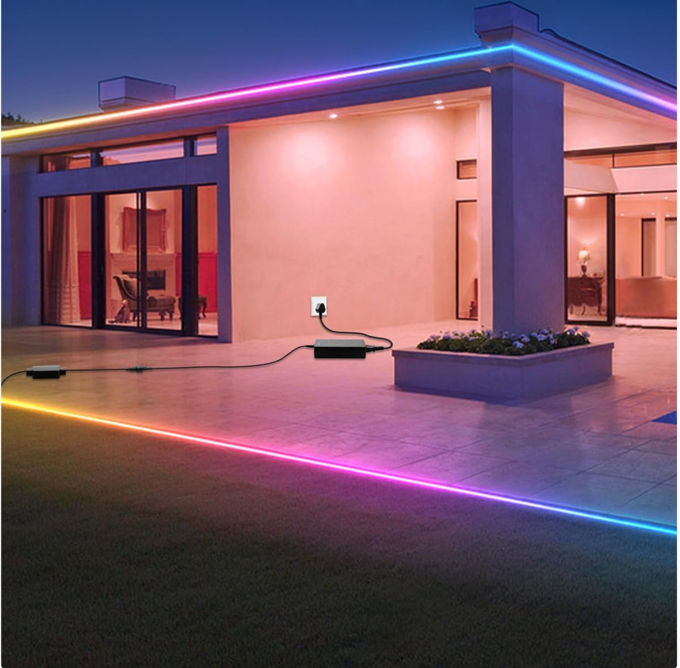
Image: Outdoor installation demonstrating the 11.5FT ultra-long charging cord. The LED strip lights are installed along the eaves and patio, with the power adapter connected to a distant outdoor outlet.

Super sealed design, fearless of rainwater for outdoor use