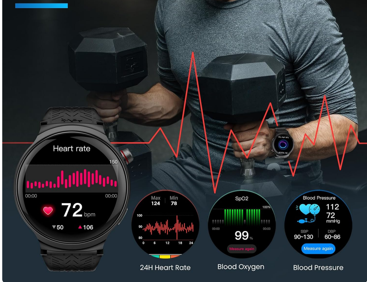
Image: A man lifting weights, with his smartwatch displaying real-time heart rate (72 bpm), blood oxygen (99%), and blood pressure readings. Note: This device is not intended for medical use.