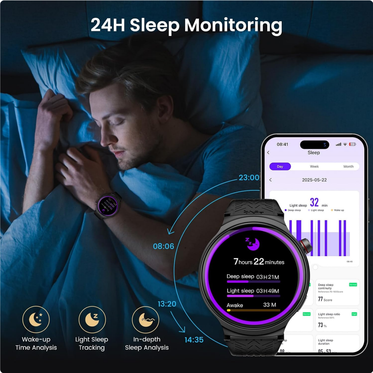
Image: A man sleeping, with his smartwatch showing detailed sleep monitoring data, including total sleep duration, deep sleep, light sleep, and awake times.