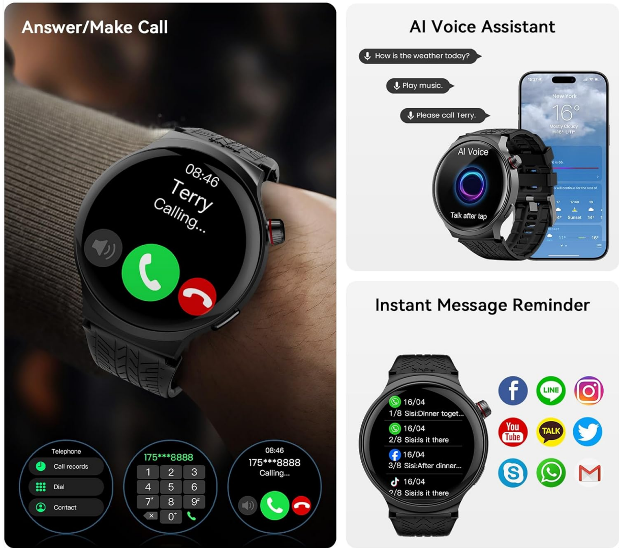
Image: The smartwatch displaying an incoming call, a screen for the AI voice assistant, and various app icons for instant message reminders.