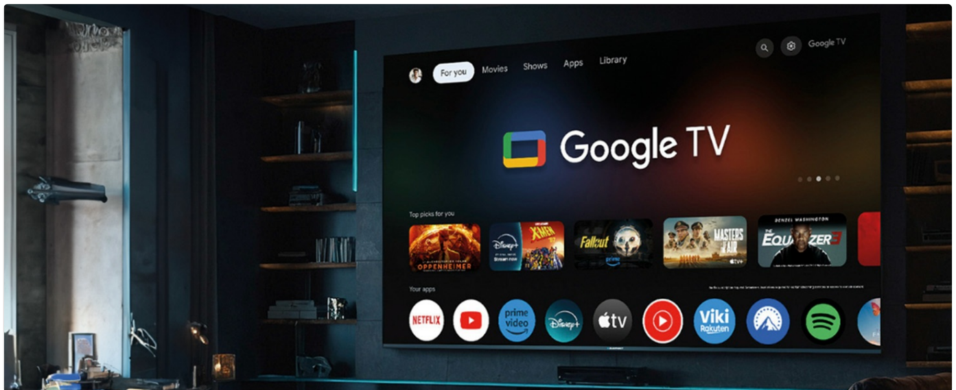
Figure 5: Example of the Google TV home screen interface.

Your Blaupunkt Smart TV runs on Google TV, providing a personalized experience with access to a wide range of streaming services and apps. The home screen displays recommended content, your installed apps, and various settings.