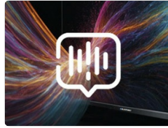
Figure 7: Icon indicating voice control functionality.

Your TV supports voice control via Google Assistant. Press the Google Assistant button on your remote and speak into the microphone to search for content, control playback, get information, and manage smart home devices.