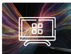
Figure 6: Icon symbolizing access to various applications.