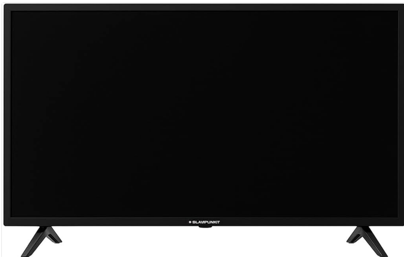
Figure 1: Front view of the Blaupunkt 32WGC5500S Smart TV with its stand.

Thank you for purchasing the Blaupunkt 32WGC5500S 32-inch HD Ready LED Smart TV. This manual provides essential information for setting up, operating, and maintaining your new television. Please read these instructions carefully before using the product and retain them for future reference.