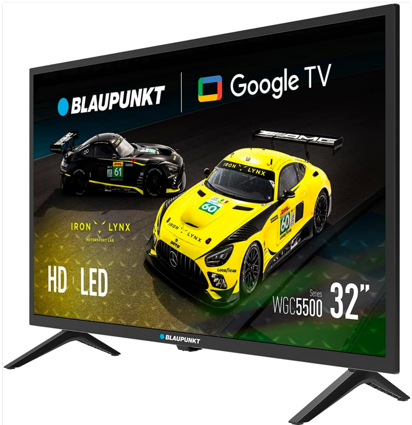
Figure 2: Blaupunkt 32WGC5500S Smart TV with stand attached, ready for use.