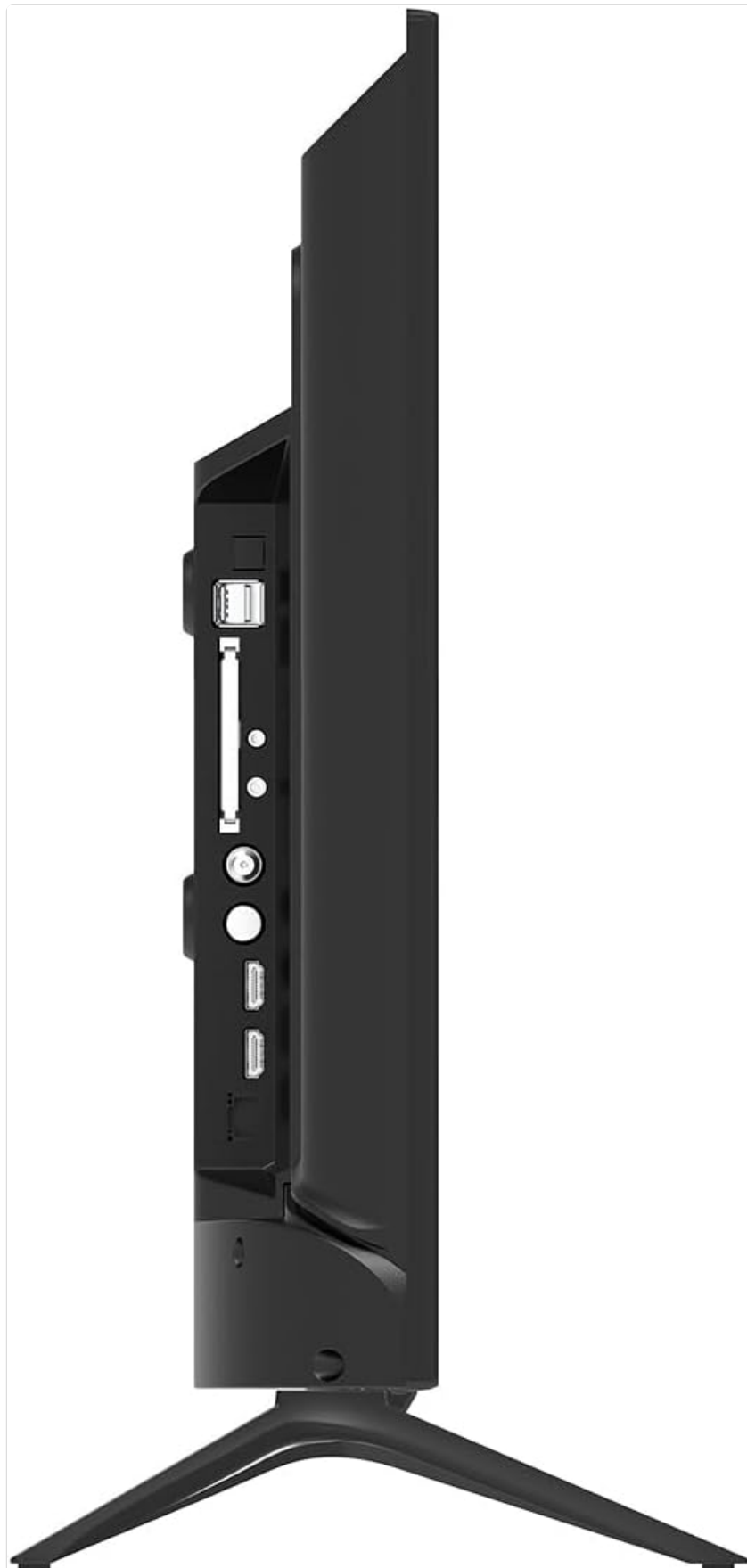
Figure 3: Side view displaying available connectivity ports including HDMI, USB, and audio outputs.