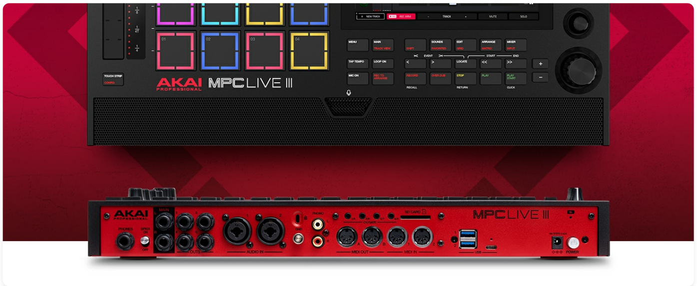
Figure 3: MPCe pads offering advanced expressive control.