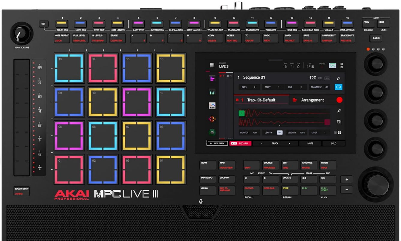
Figure 1: Akai Professional MPC Live III Standalone Music Production Center.

The Akai Professional MPC Live III is a powerful, standalone music production center designed for beatmakers, producers, and live performers. It offers a comprehensive suite of tools for creating, recording, mixing, and performing music without the need for a computer. This manual provides essential information to help you get started and maximize your experience with the MPC Live III.