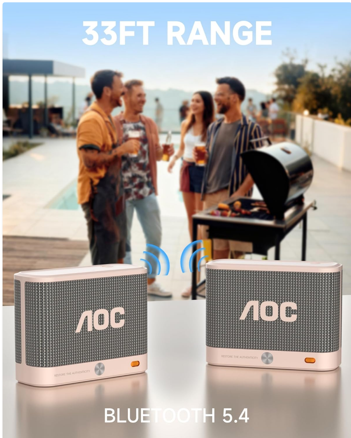
Image: Two AOC Portable Bluetooth Speakers ACS4311 are shown outdoors, connected wirelessly, demonstrating the Bluetooth 5.4 connectivity and a 33ft range. This highlights the speaker's ability to maintain a stable connection over a reasonable distance.