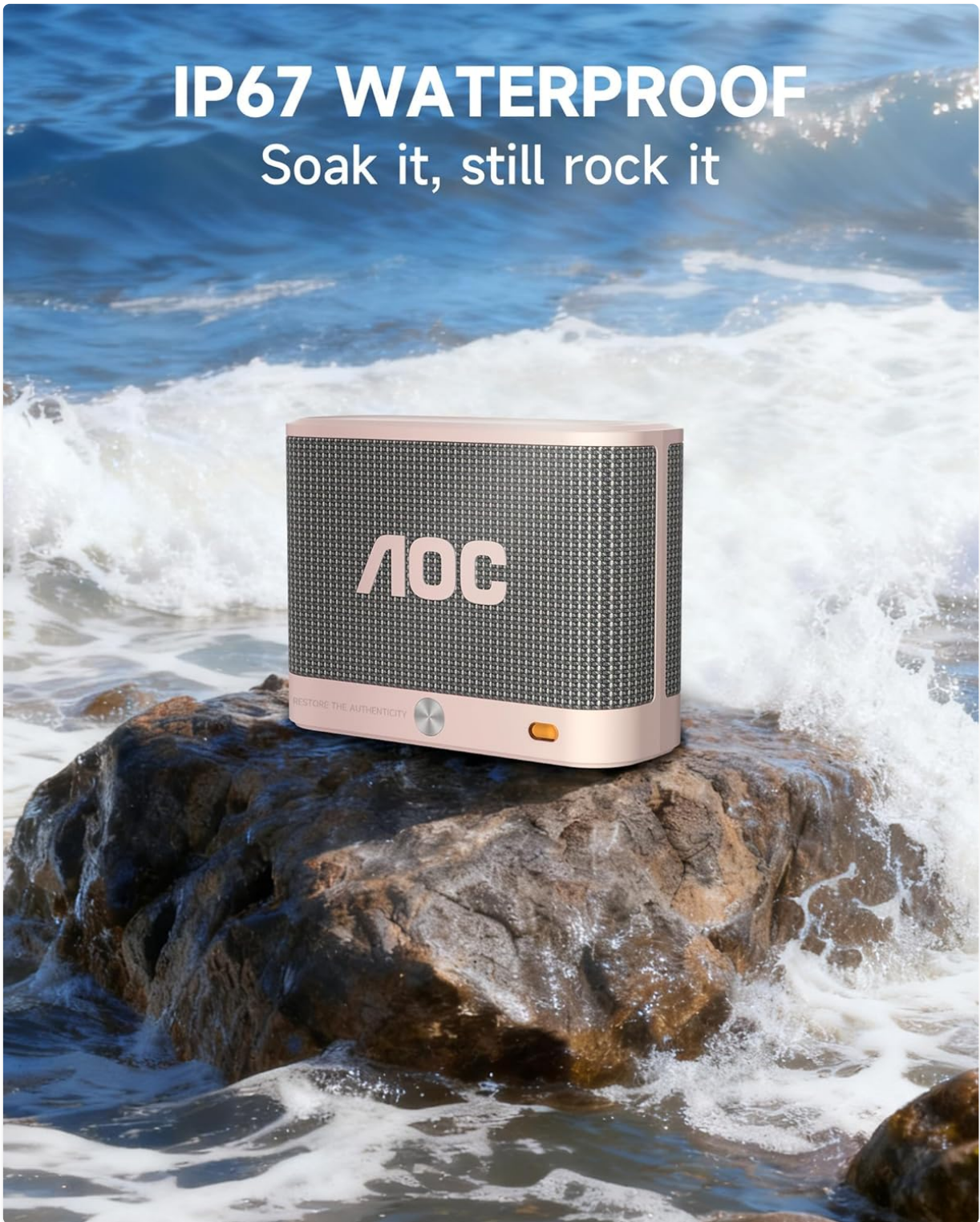
Image: The AOC Portable Bluetooth Speaker ACS4311 is placed on a rock near the ocean, with waves splashing around it, visually confirming its IP67 waterproof rating. This demonstrates its suitability for use in wet environments.