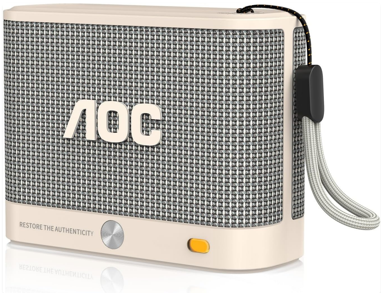
Image: A front-facing view of the AOC Portable Bluetooth Speaker ACS4311, highlighting its compact design and the AOC logo on the speaker grille. The speaker is white with a textured grille and a small control button at the bottom.