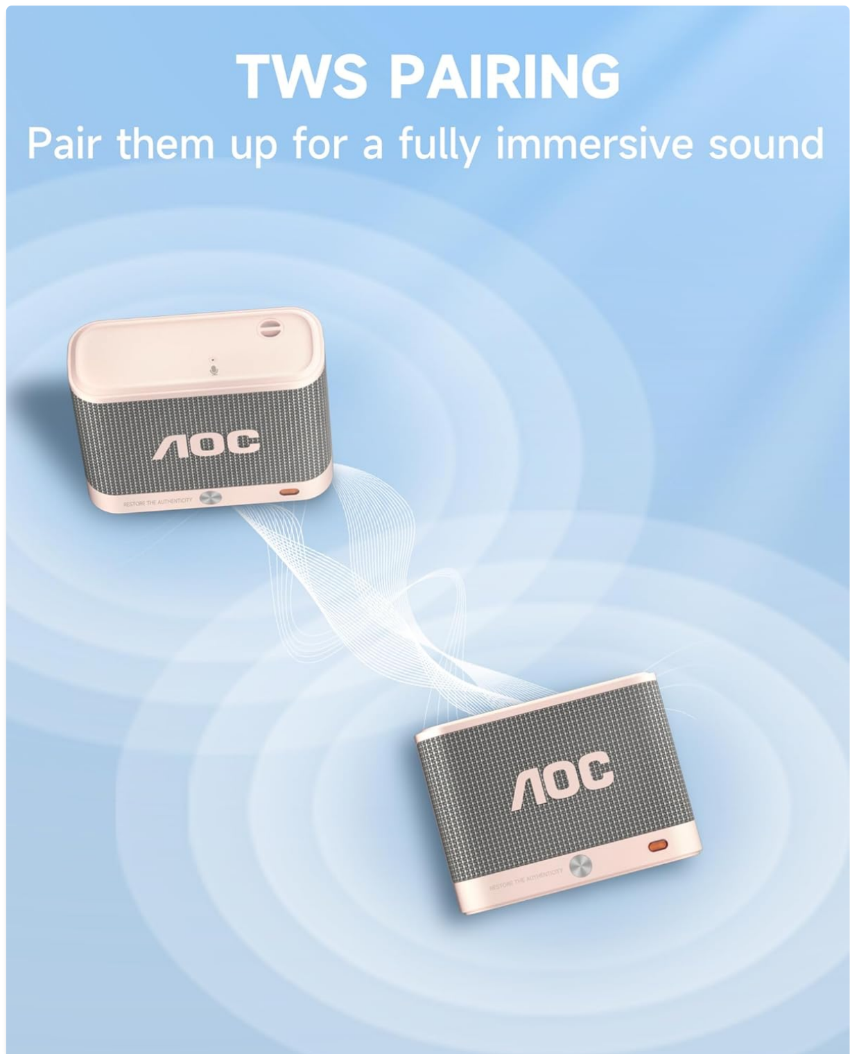
Image: Two AOC Portable Bluetooth Speakers ACS4311 are shown wirelessly connected, illustrating the True Wireless Stereo (TWS) pairing feature. This setup allows for synchronized audio playback from both speakers for a stereo effect.