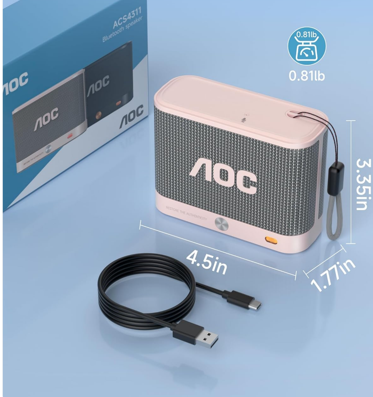
Image: The AOC Portable Bluetooth Speaker ACS4311 shown with its retail packaging, a USB Type-C charging cable, and a handle strap. This image illustrates the complete contents of the product package.