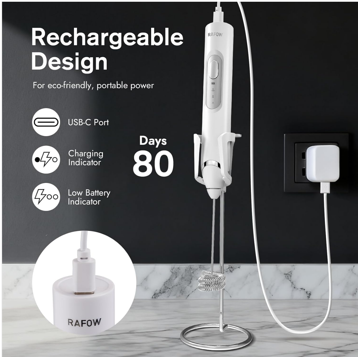
Image: The RAFOW frother unit connected to a USB-C charging cable, illustrating its rechargeable design.