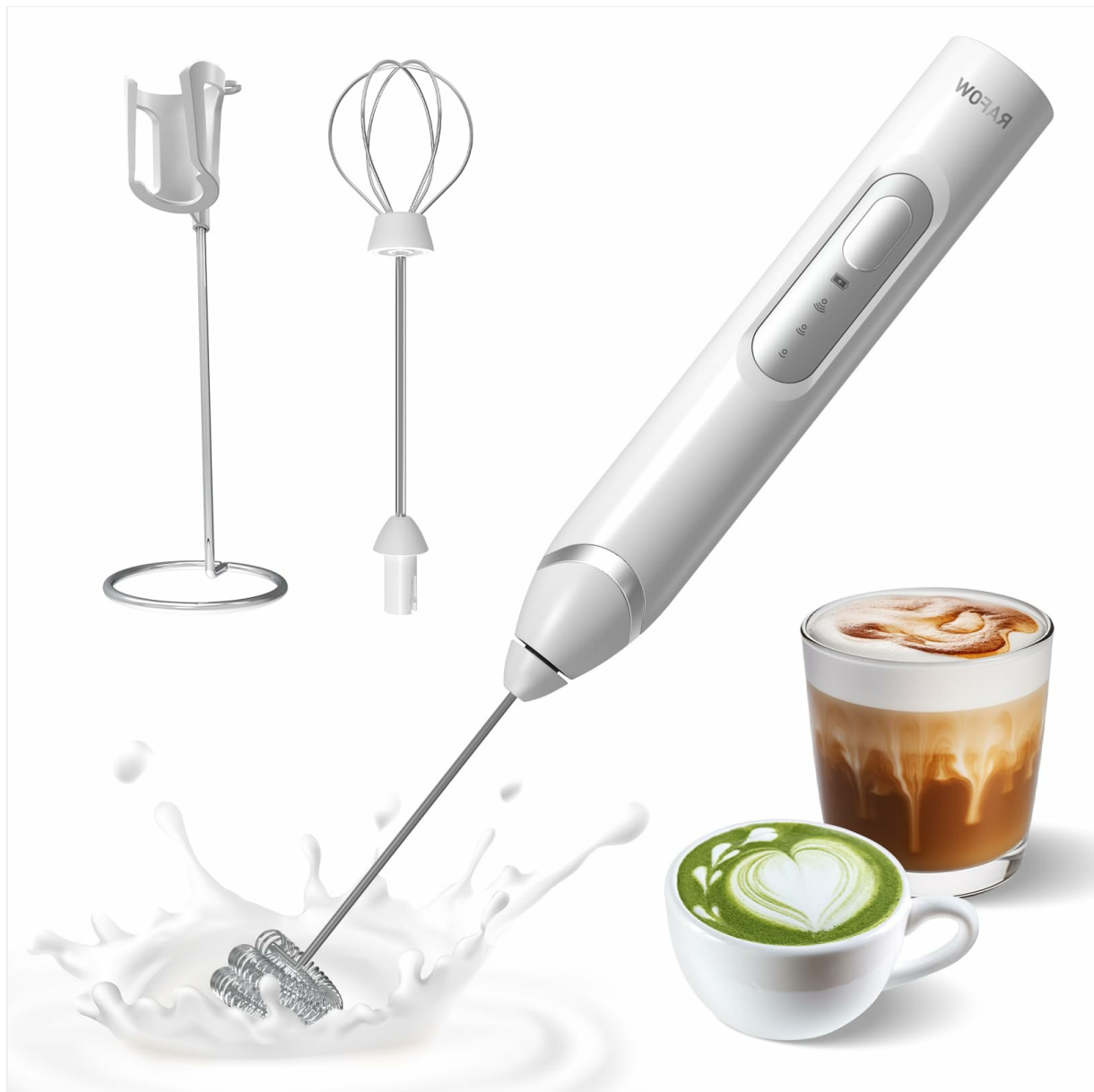
Image: The RAHOW Handheld Electric Milk Frother in white, demonstrating its ability to create fine milk foam for coffee.