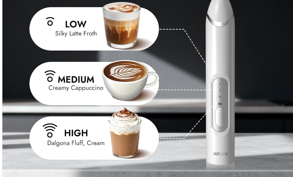
Image: The RAFOW frother highlighting its three-speed precision control for different frothing needs.