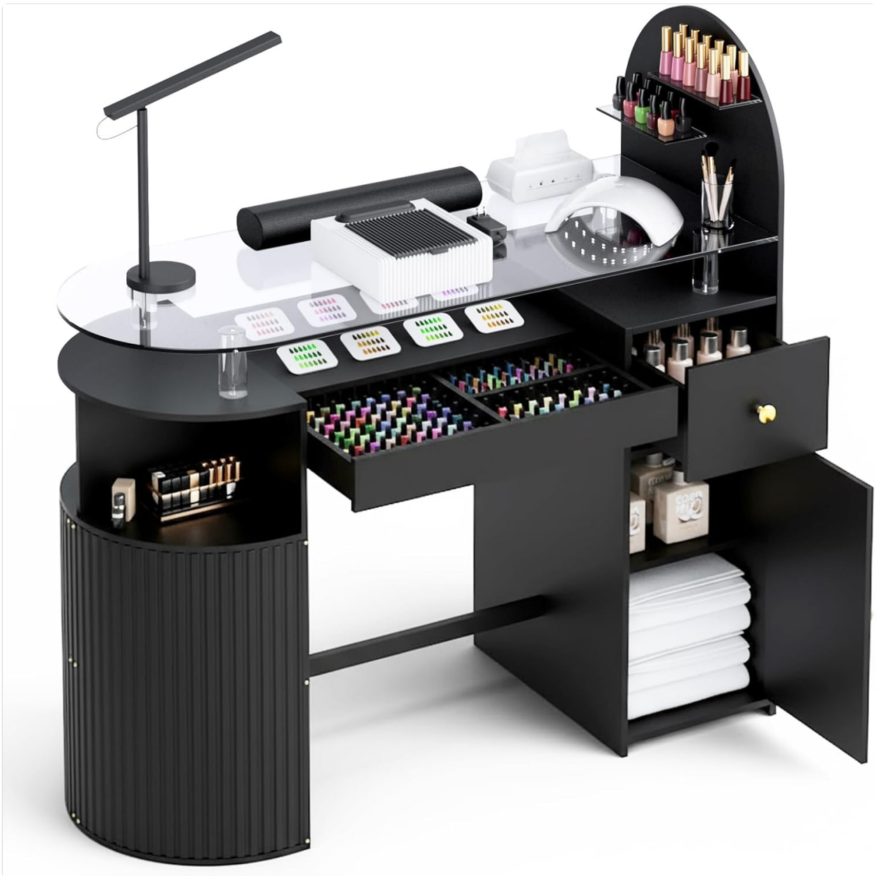
Image 3.3: Detail showing the customizable drawer dividers and adjustable shelving within the cabinets.