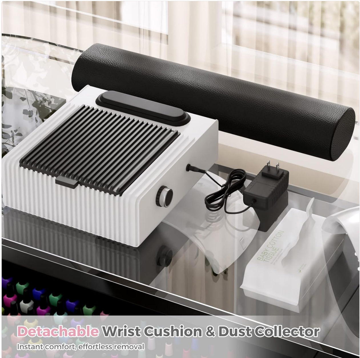
Detachable Wrist Cushion & Dust Collector Instant comfort, effortless removal

Image 3.1: The detachable wrist cushion and dust collector, designed for comfort and cleanliness.