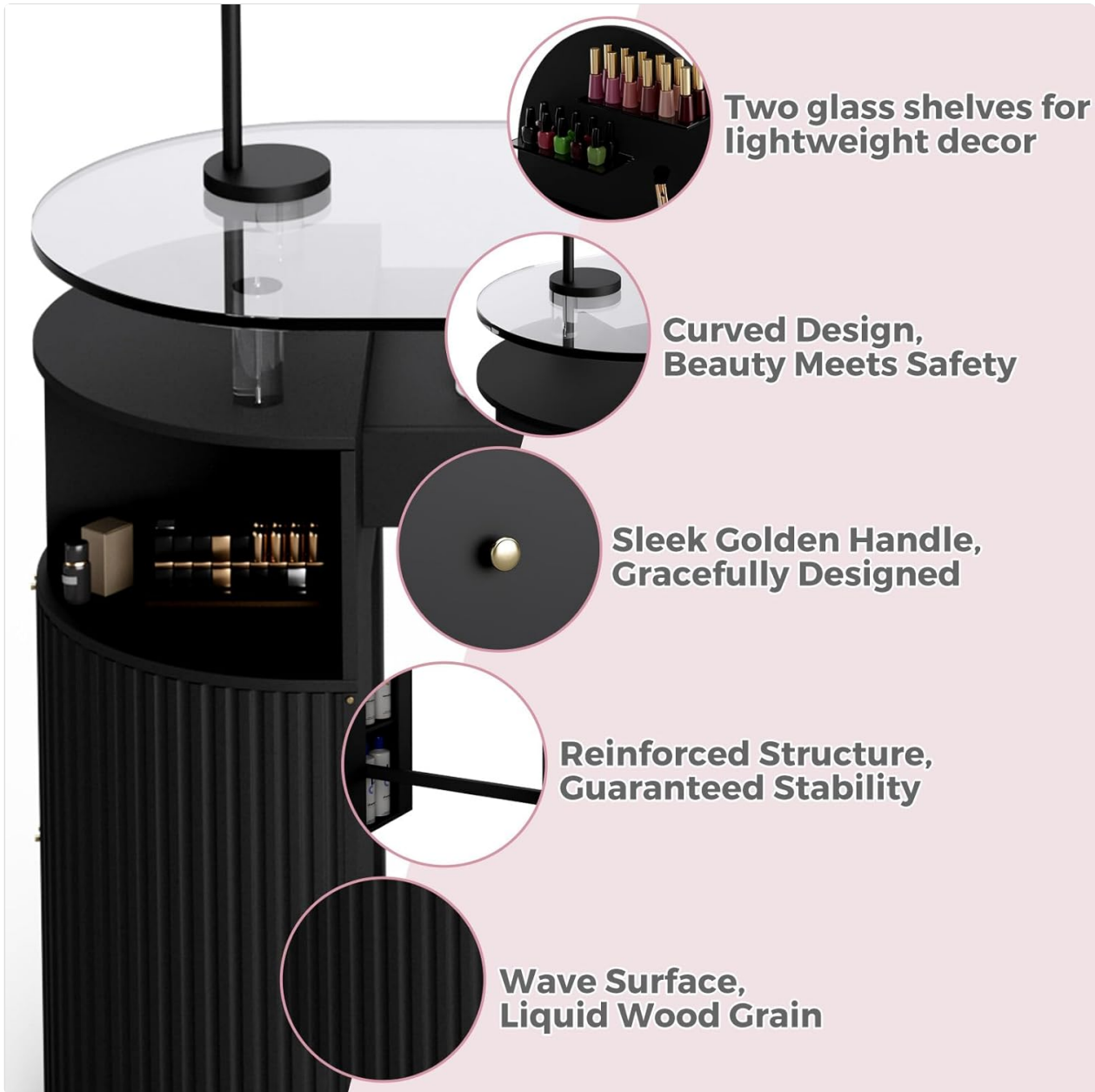
Image 3.2: An overview of the table's spacious storage capacity, including drawers, cabinets, and open shelves.