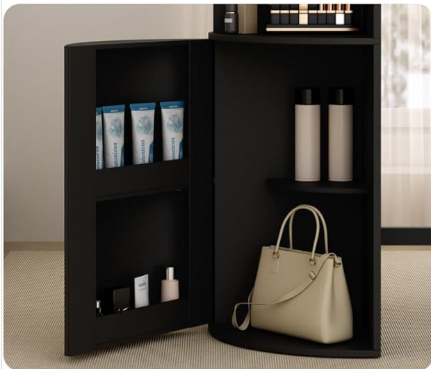
Hidden Behind-Cabinet Storage