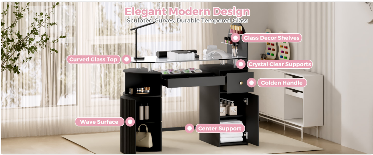
Image 1.1: The HolaiNail Manicure Table showcasing its elegant design with a tempered glass top and crystal clear shelves.