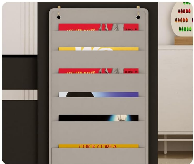
Storage Bag for Magazines & More