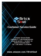
Instructions for Use