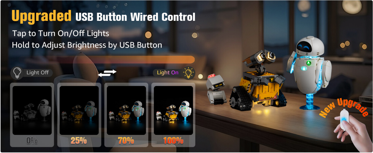
Image 5.2: Brightness adjustment levels from 0% to 100% using the USB button wired control.