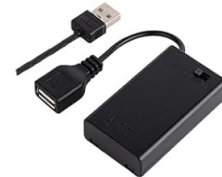
Battery Box AAA not included