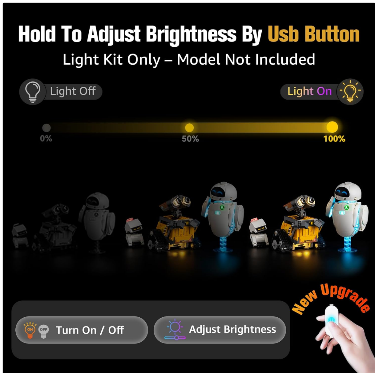
Image 5.1: Operating the wired dimmer switch. Press to turn ON/OFF, hold to adjust brightness.