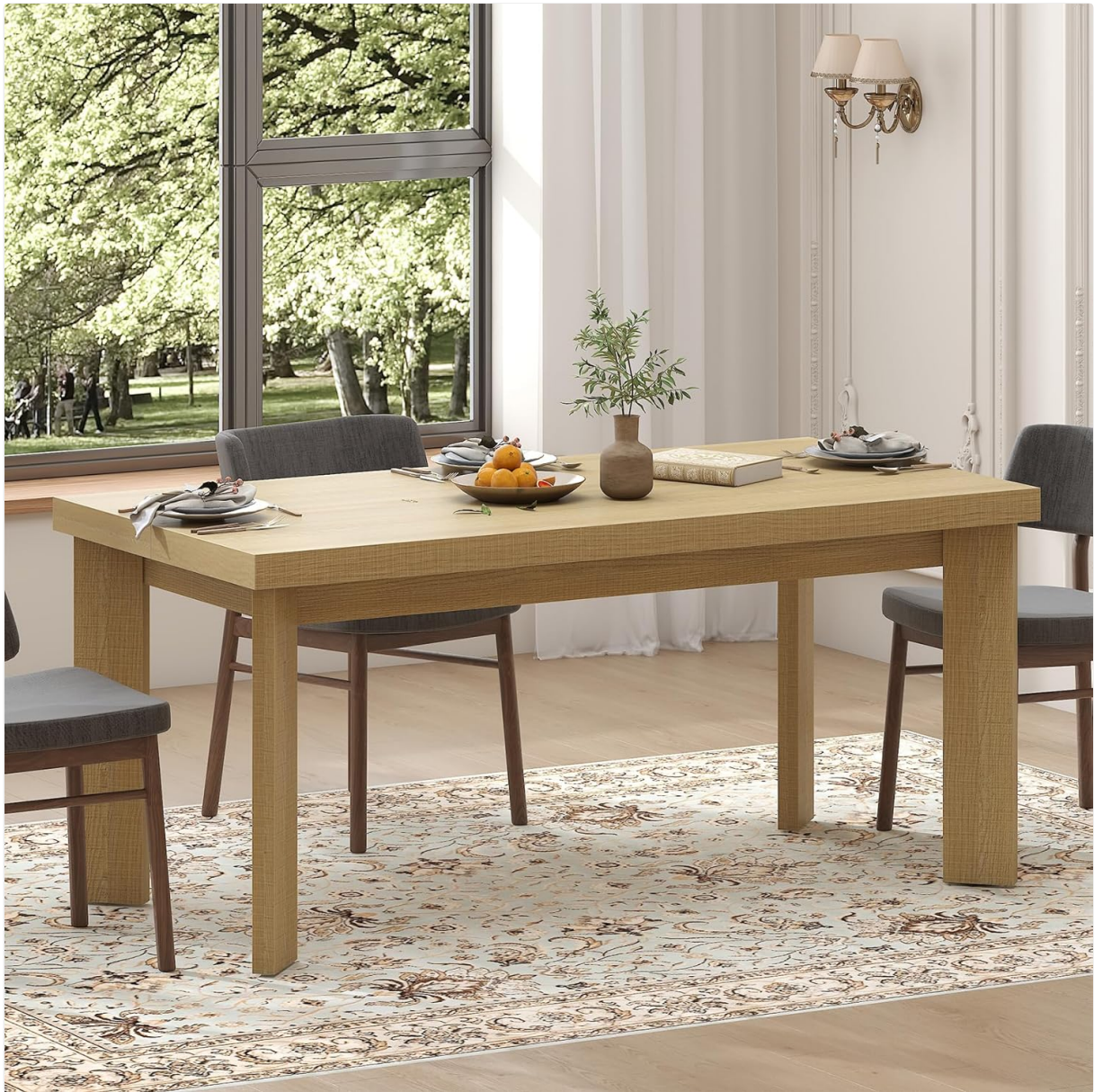
Figure 2: The dining table in a typical indoor setting, demonstrating its capacity for multiple users.