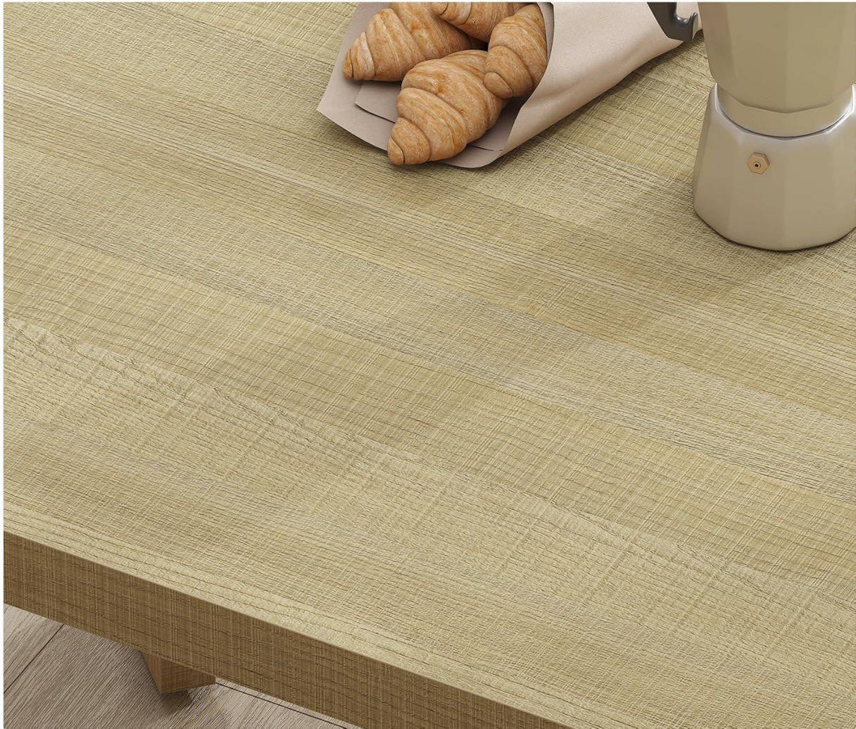
Figure 3: Visual representation of the tabletop's durable properties, highlighting its resistance to water and scratches.