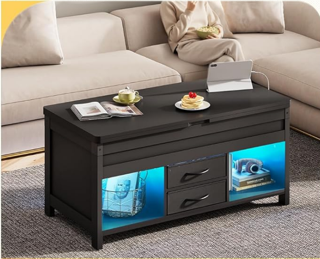
Regular Coffee Table