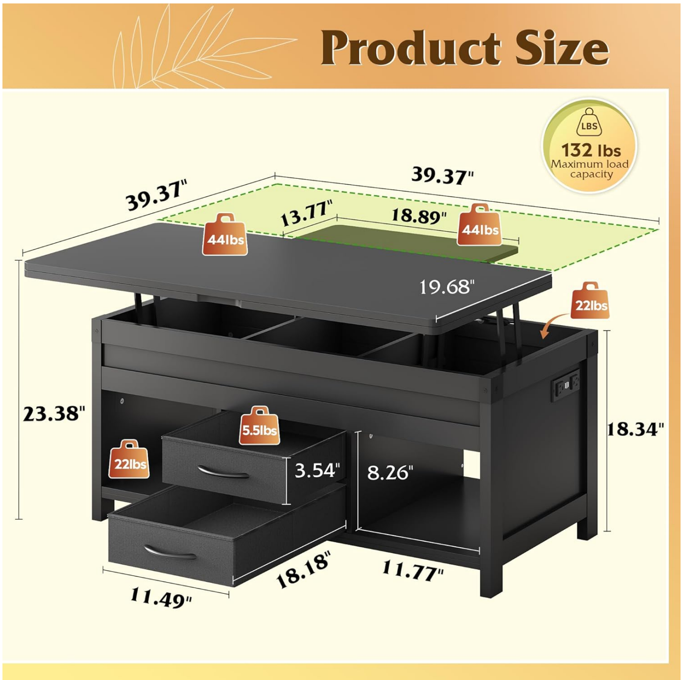
Image: Product dimensions and weight capacities diagram.