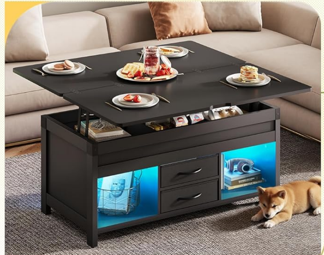
Dining Table For 4-8 People

Image: Visual representation of the 4-in-1 functionality, showing the table as a regular coffee table, a one-side lift-top, a two-way lift-top, and a dining table.