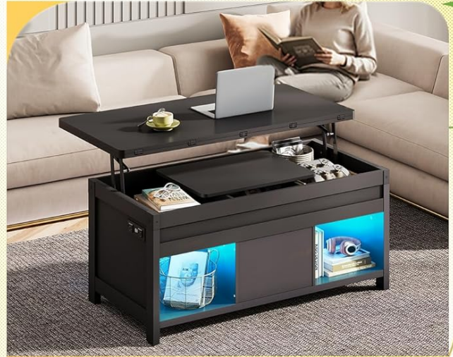
One Side Lift Top Coffee Table