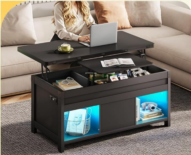
Two Way Lift Top Coffee Table