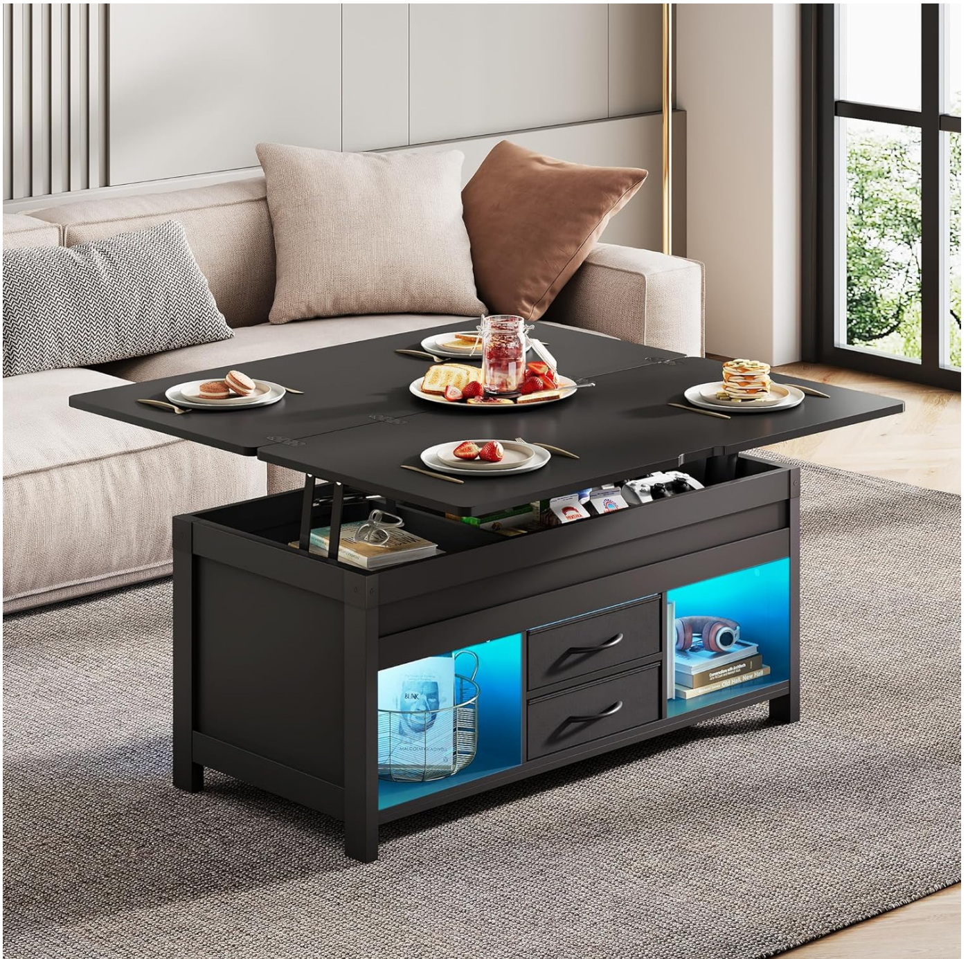
Image: The WLIVE 40-inch Lift Top Coffee Table in a living room, demonstrating its lift-top functionality and integrated storage with LED lighting.