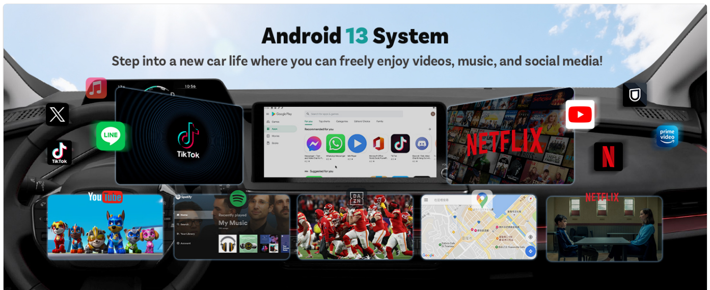
Image: The car's infotainment screen displaying the Android 13 system interface of the Ottocast E2 OttoAibox, featuring icons for Netflix, YouTube, TikTok, Google Play, and other applications, indicating a full smart TV experience.