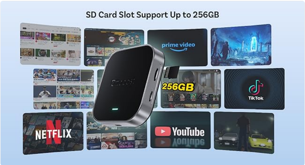
Image: The Ottocast E2 OttoAibox featuring an SD card slot that supports up to 256GB of storage, allowing users to expand memory for apps and media.