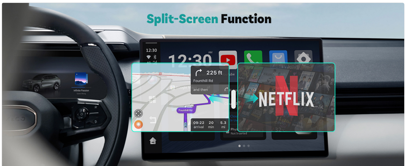
Image: A car's display demonstrating the split-screen function of the Ottocast E2 OttoAibox, with a navigation map on one side and Netflix playing on the other, illustrating simultaneous use for driver and passenger.