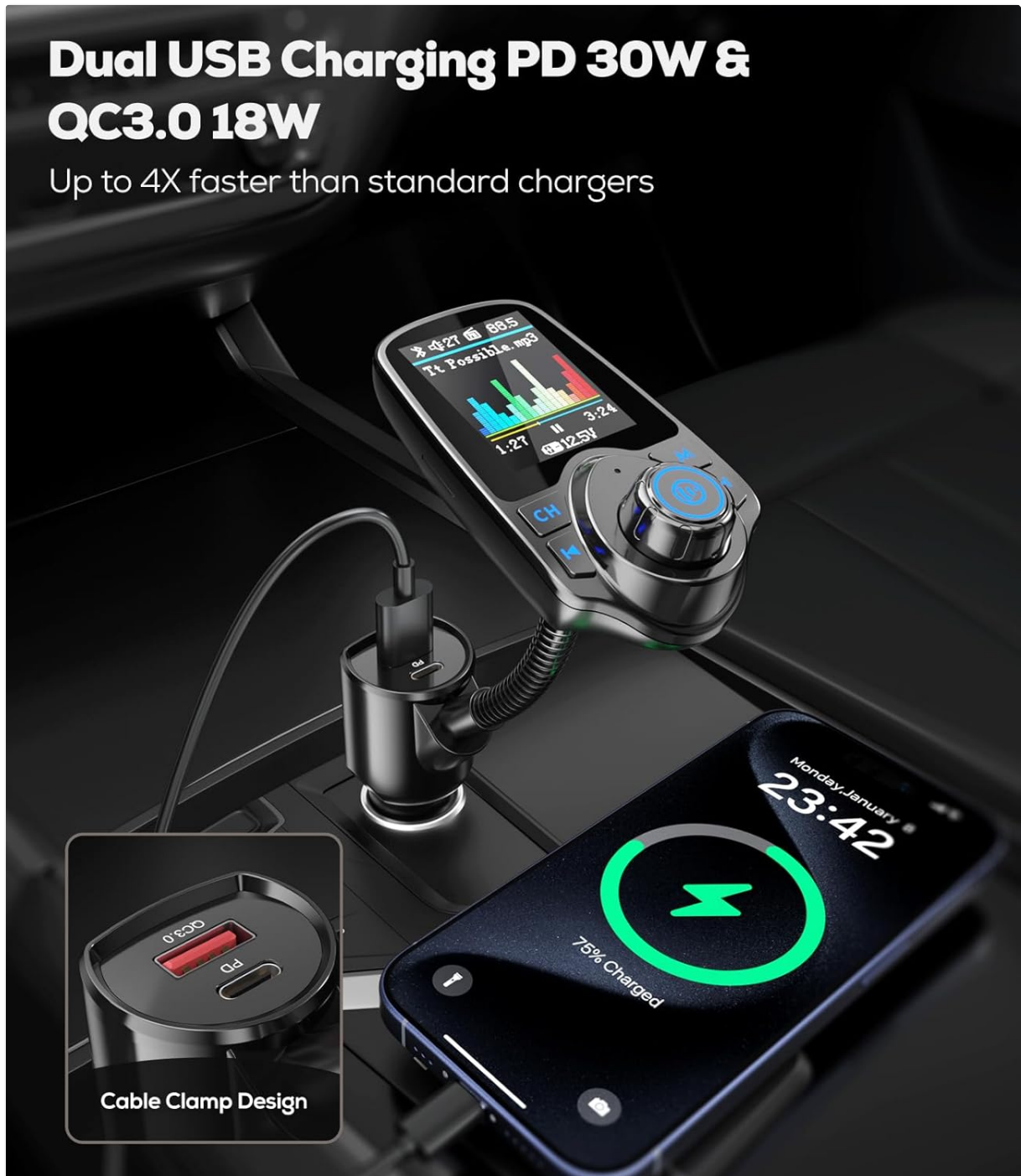
Image: The Nulaxy KM18 Color Car Adapter plugged into a car's power outlet, actively charging two smartphones via its dual USB ports: one PD 30W and one QC3.0 18W, demonstrating its fast-charging capability.