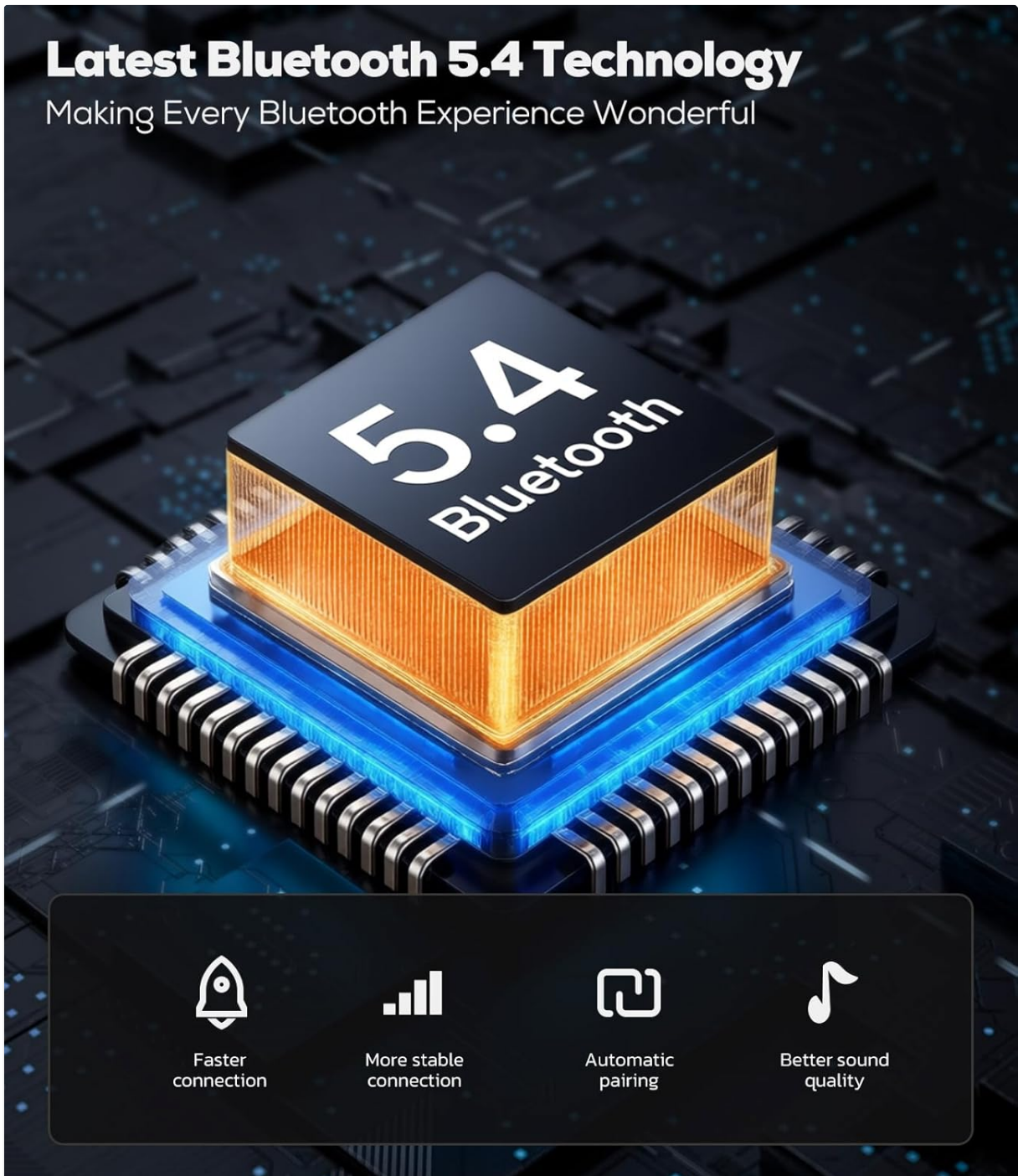
Image: The Nulaxy KM18 Color Car Adapter's 1.8-inch TFT color screen displaying information, alongside an illustration of Bluetooth 5.4 technology, emphasizing faster and more stable connections, automatic pairing, and improved sound quality.

Making Every Bluetooth Experience Wonderful