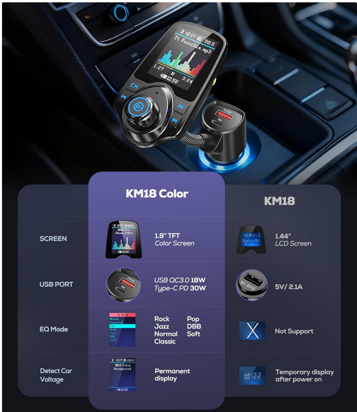
Image: A comparison chart illustrating the enhancements of the KM18 Color model over the classic KM18. Key upgrades include a larger 1.8-inch TFT color screen, USB QC3.0 18W and Type-C PD 30W charging ports, support for 7 EQ modes, and permanent battery voltage display.