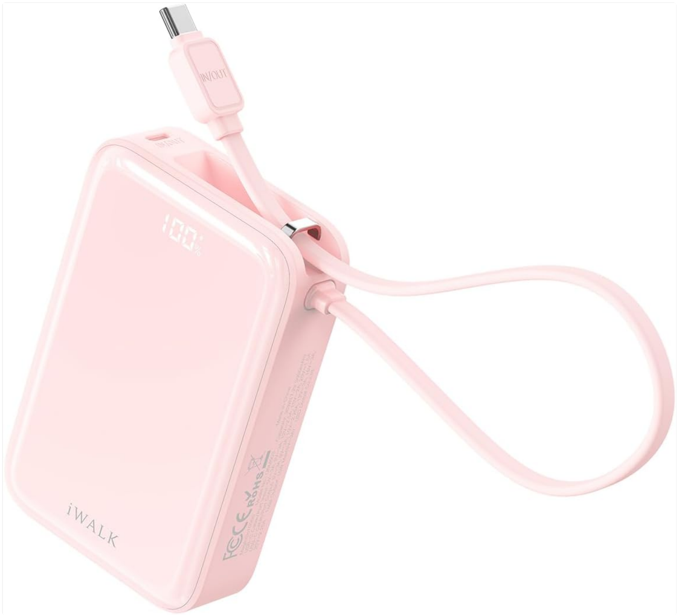
Image: The iWALK 10000mAh 45W PD Portable Charger in pink, showing the integrated USB-C cable and digital display.