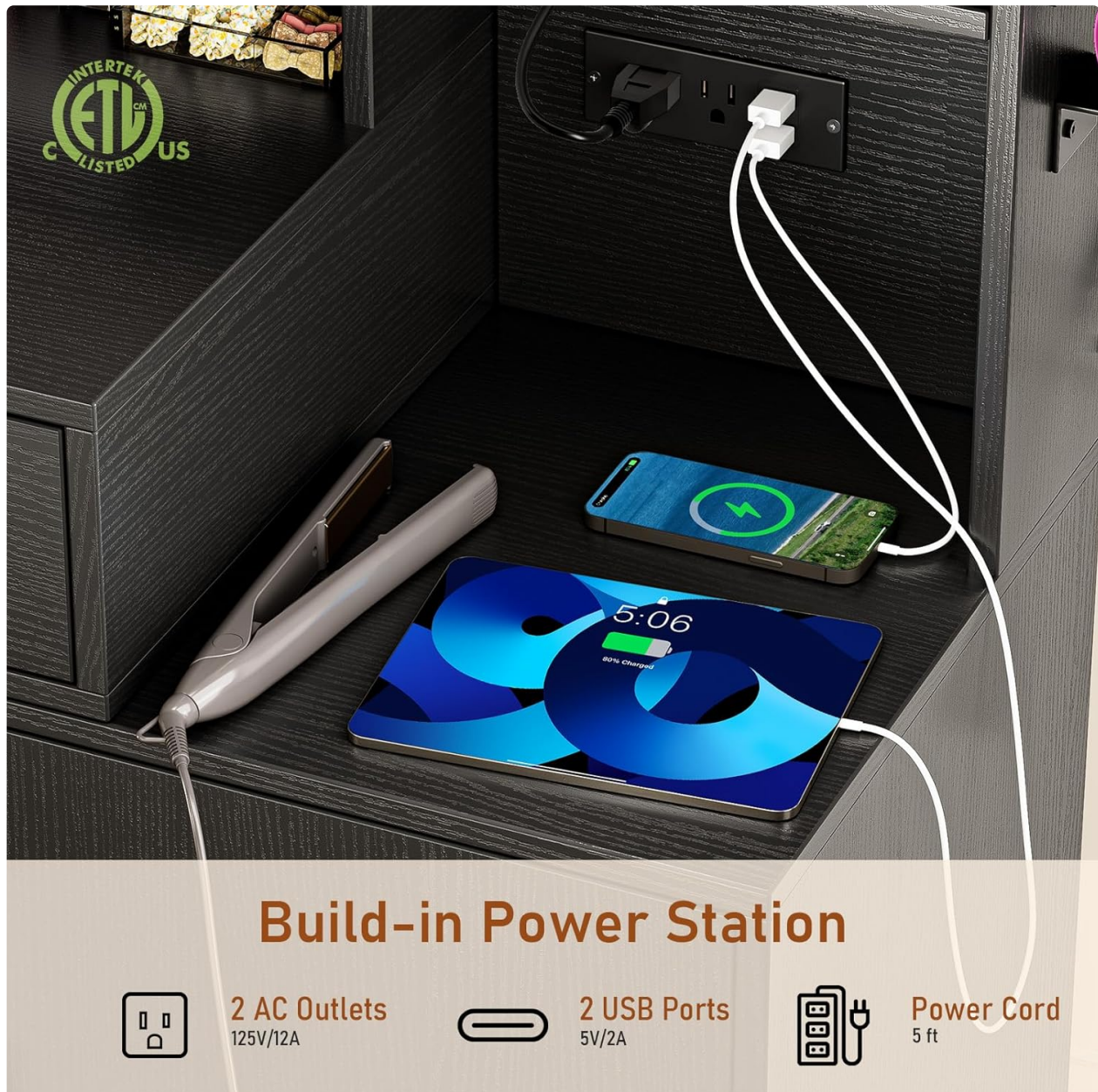
Image 5.2: Close-up view of the built-in power station with 2 AC outlets and 2 USB ports.

The integrated power hub provides convenient access to electrical outlets and USB charging ports.