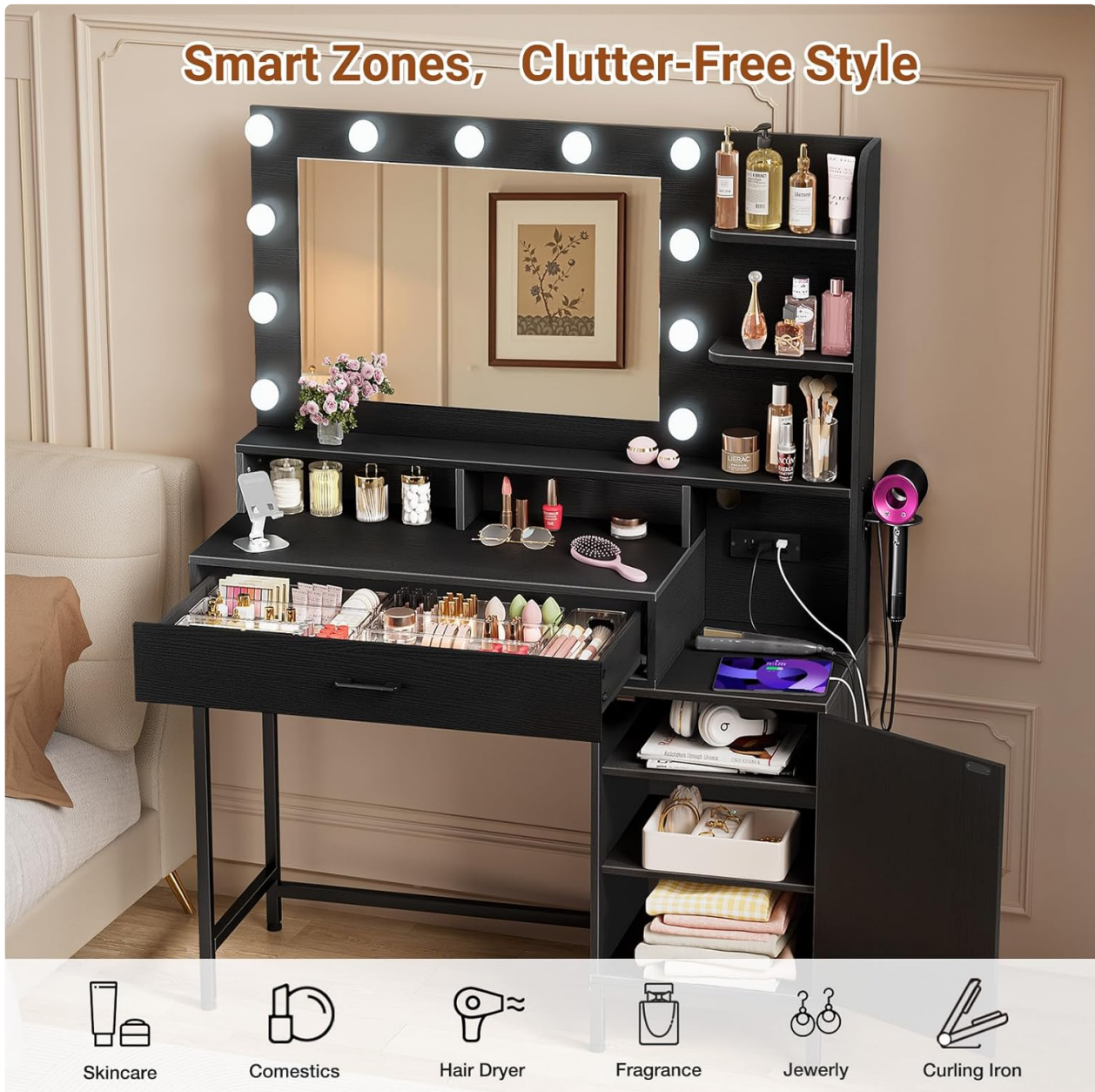
Image 5.3: Overview of the vanity's storage capabilities, including the large drawer, open shelves, and cabinet.