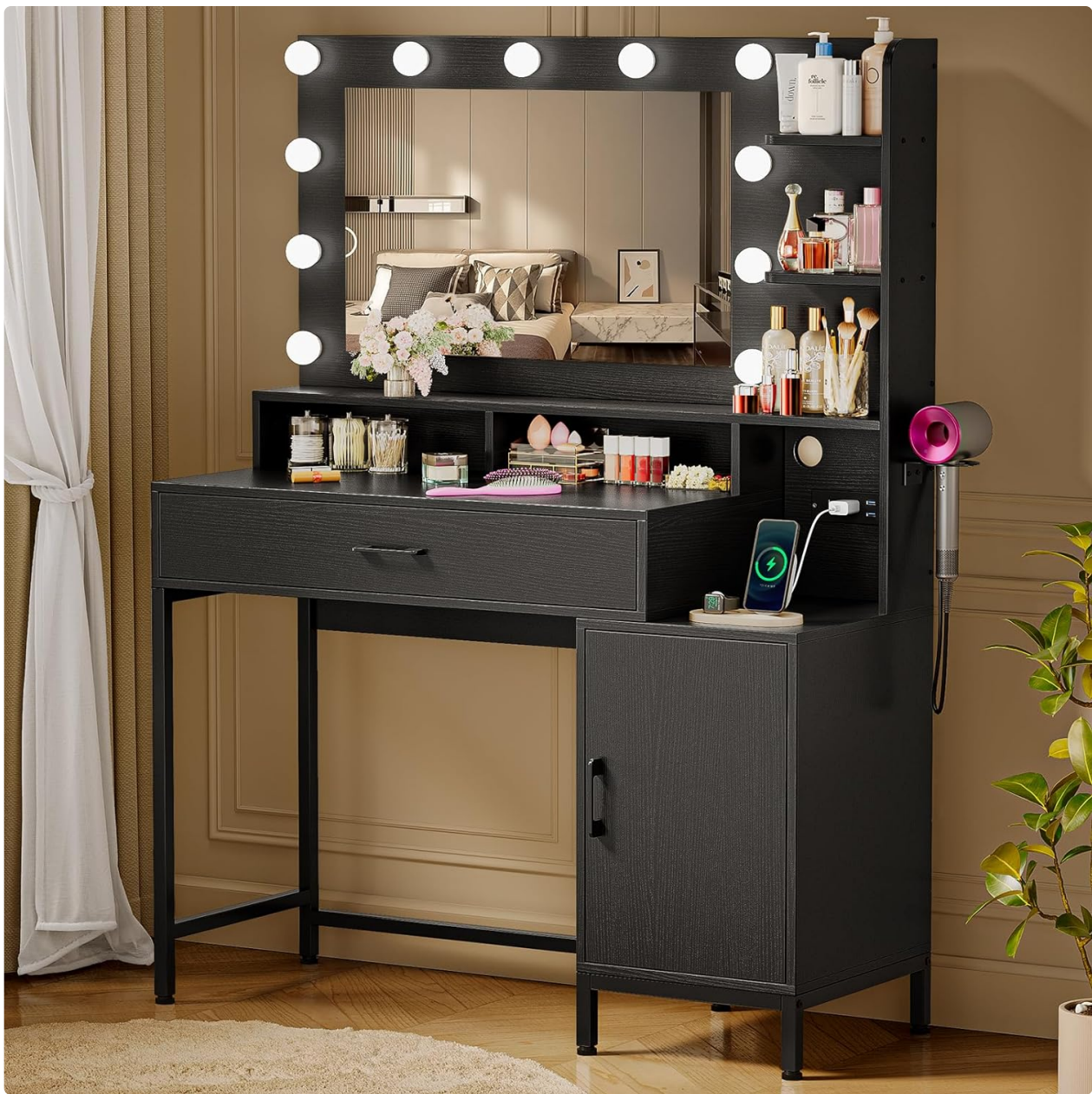
Image 2.1: Front view of the Driftalia Vanity Desk, showcasing the mirror with lights, central drawer, and side cabinet.