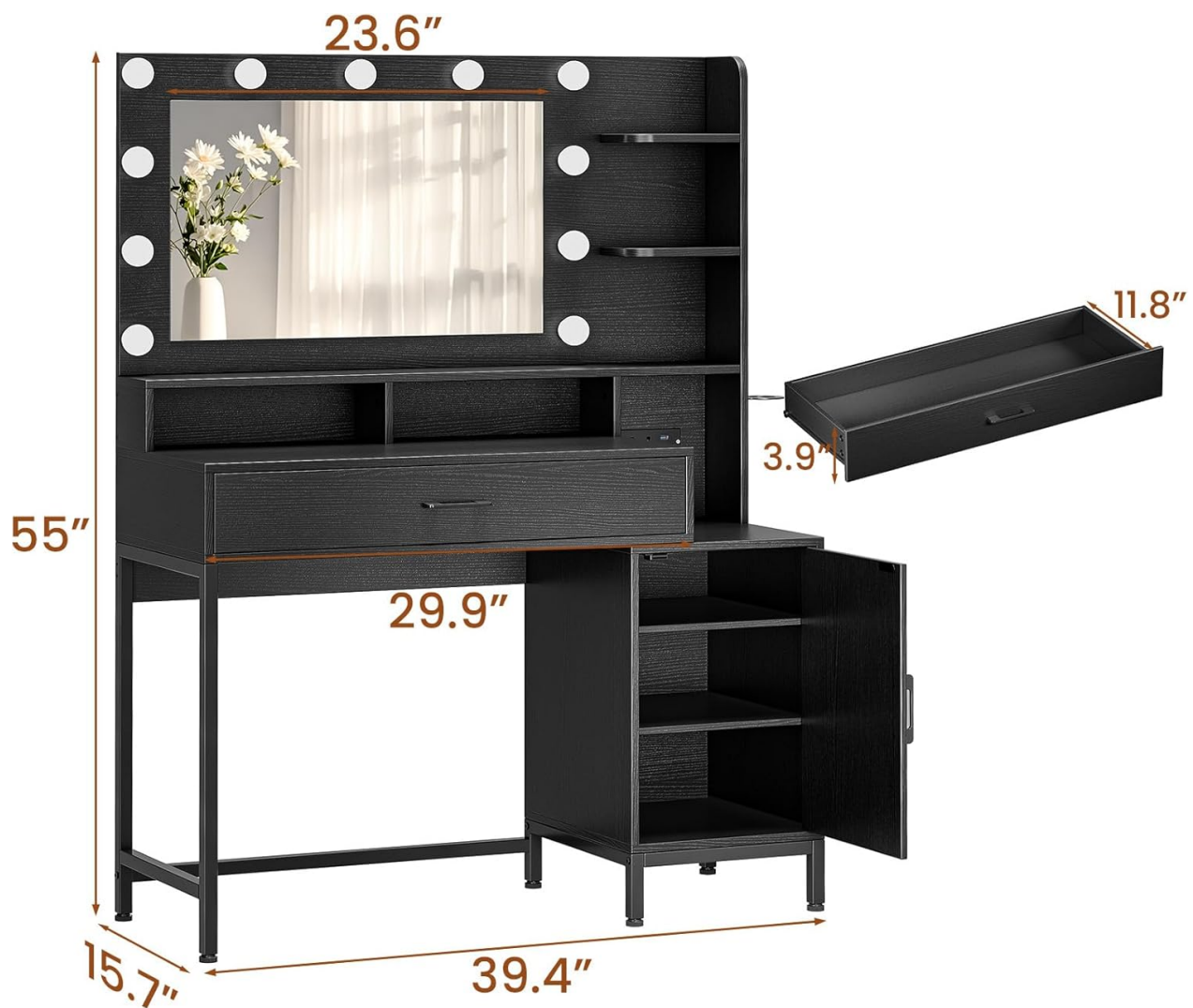
Image 2.2: Dimensional view of the vanity desk, showing overall measurements of 39.4"W x 15.7"D x 55"H.