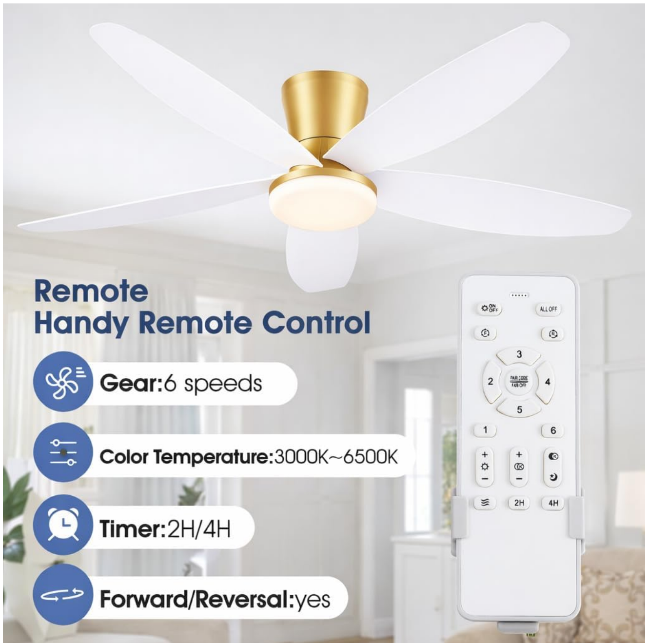
Figure 2: Remote Control Features