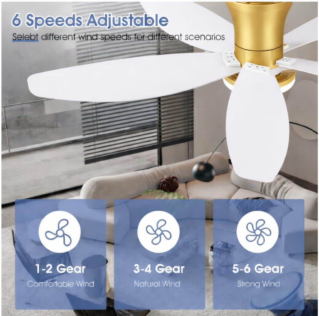
Figure 5: 6 Speeds Adjustable

Select different wind speeds for different scenarios