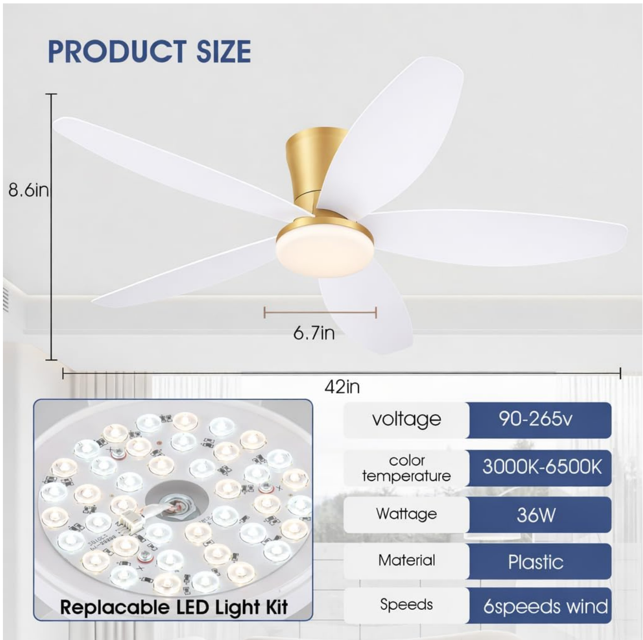
Figure 6: Product Dimensions and Specifications