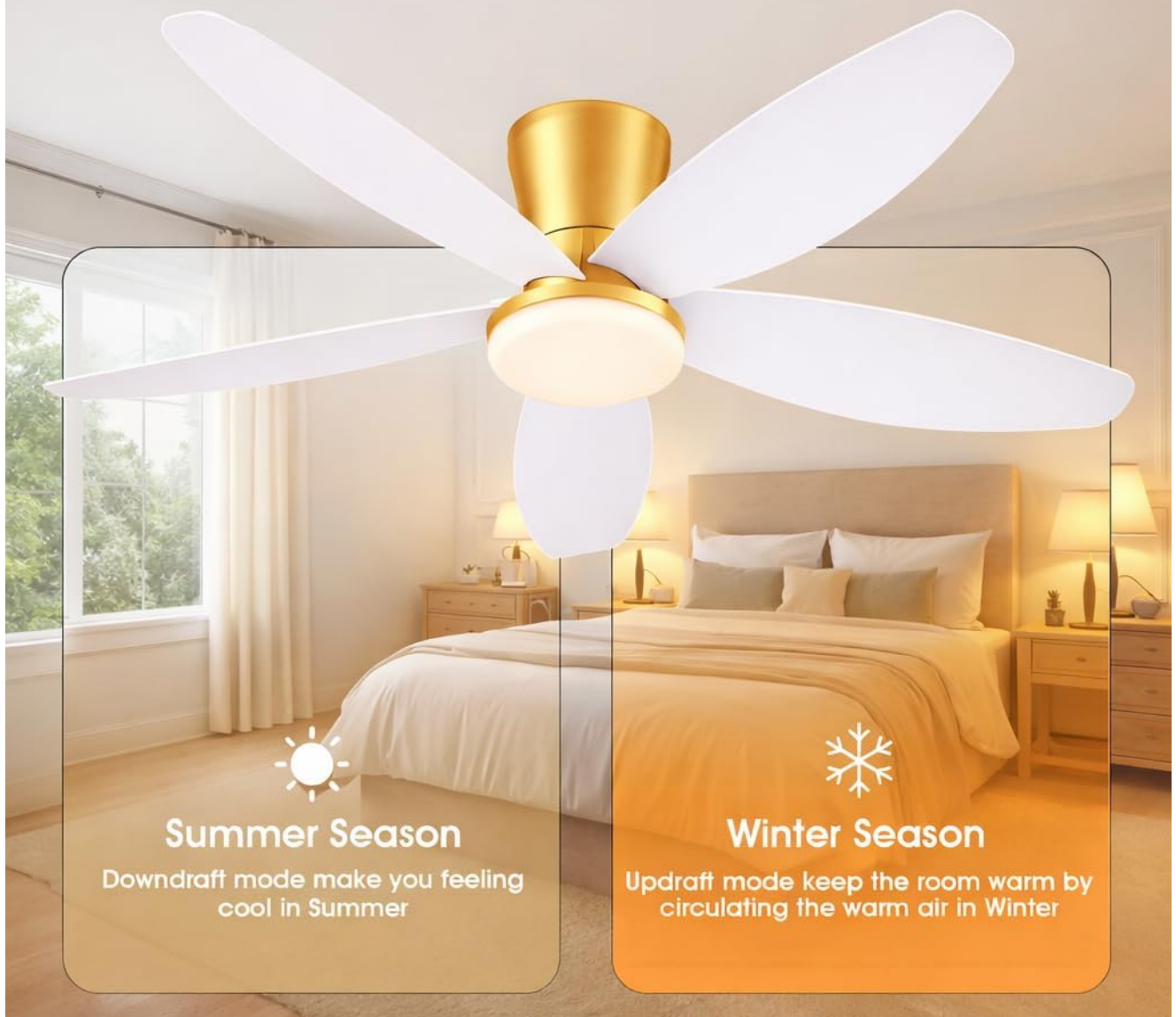
Figure 3: Reversible Motor for Summer and Winter