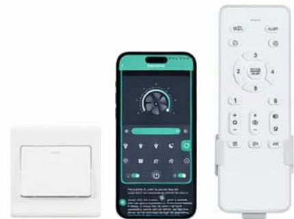
Figure 1: Surtime 42-inch Low Profile Ceiling Fan with Light (White+Gold)