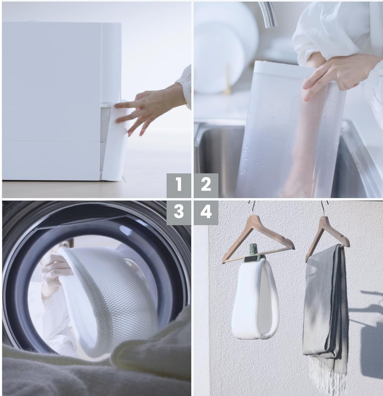
Image: Washable Filter Maintenance. This image sequence demonstrates the simple steps to maintain the humidifier's washable filter: 1. Remove the filter from the unit. 2. Rinse the filter under running water. 3. Place the filter in a washing machine for a quick wash cycle. 4. Hang the filter to air dry completely before reinserting.