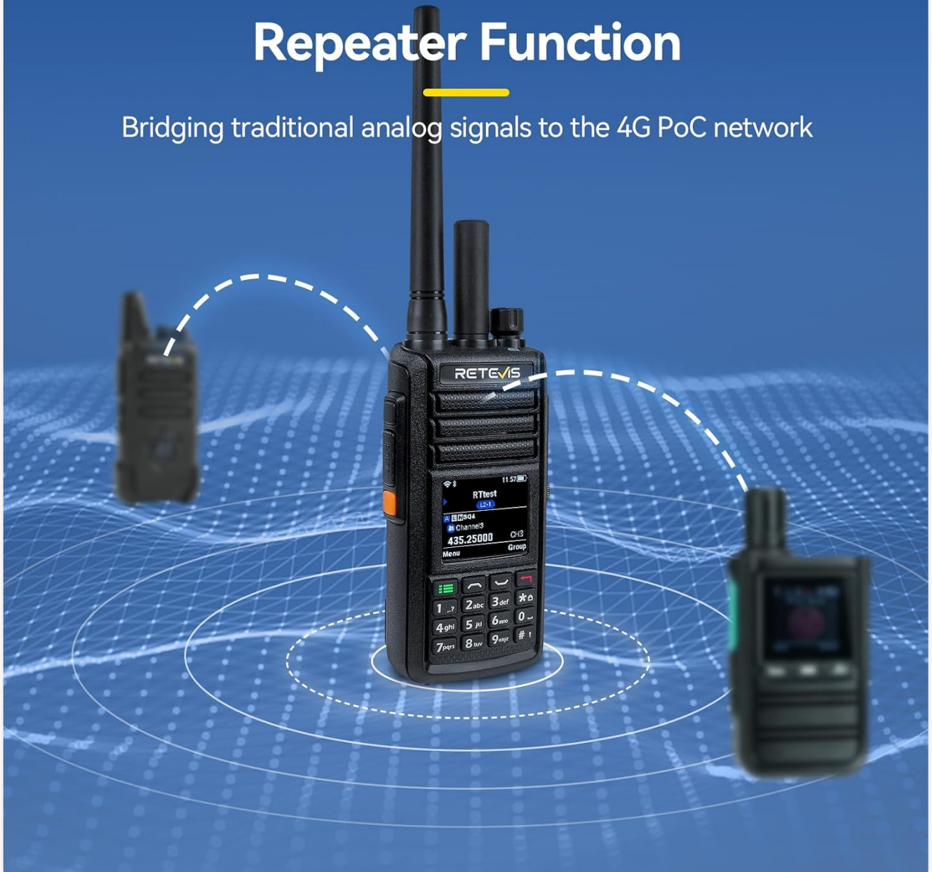
Image: The MateTalk L2 utilizing its Repeater Function to bridge analog signals to the 4G PoC network.

Bridging traditional analog signals to the 4G PoC network