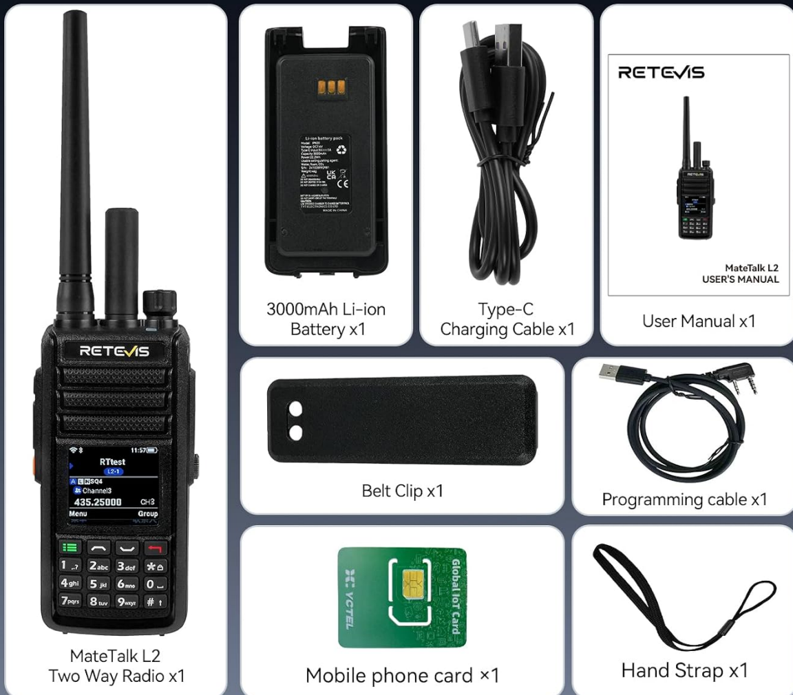
Image: All components included in the Retevis MateTalk L2 product package.