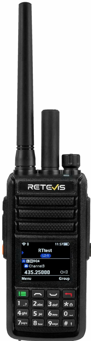
Image: Retevis MateTalk L2 Global Walkie Talkie displaying its hybrid connection capabilities.

Video: An introduction to the functions of the Retevis MateTalk L2 Walkie-Talkie.