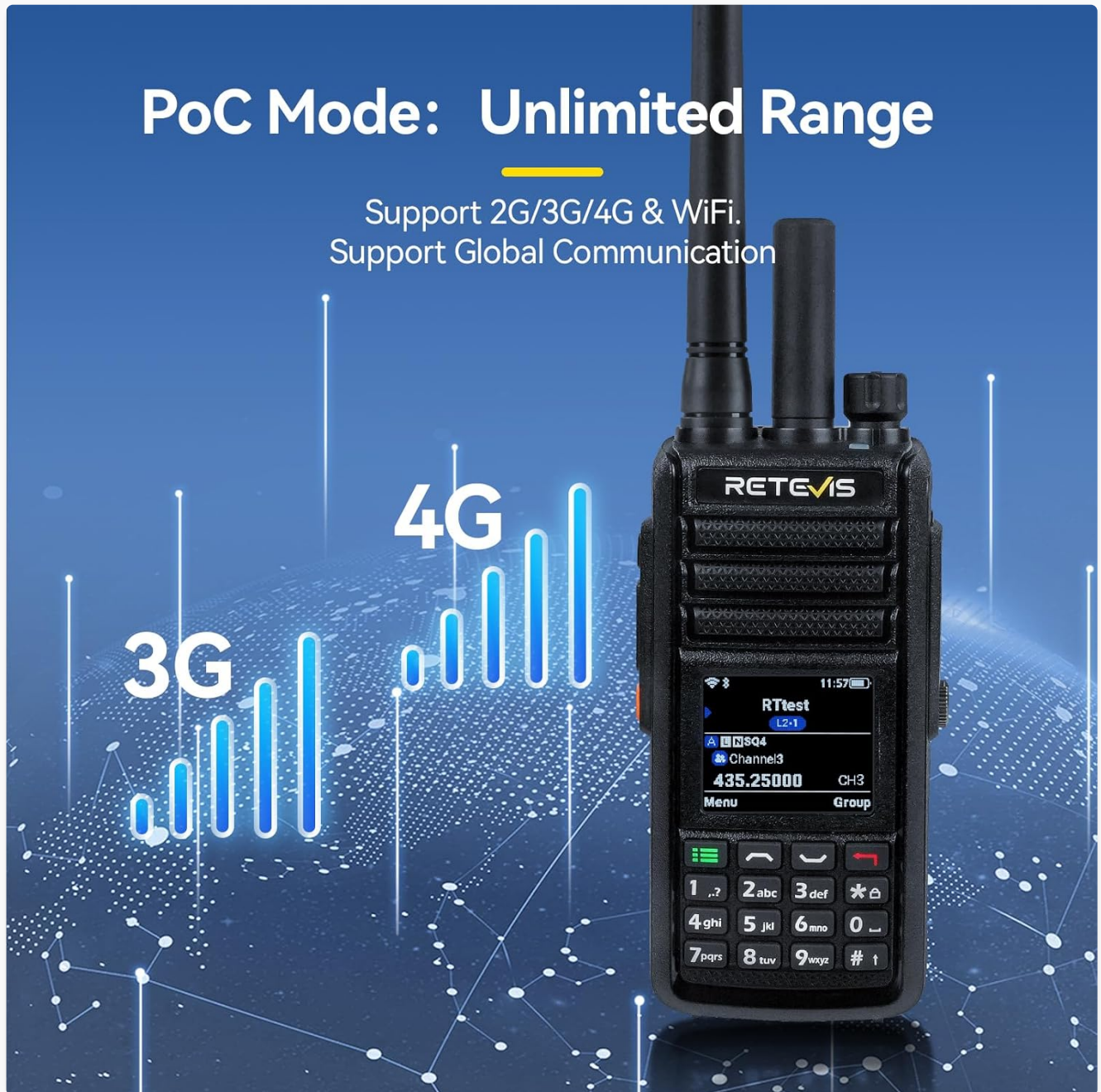
Image: The MateTalk L2 operating in PoC Mode, demonstrating unlimited range via 4G/Wi-Fi.