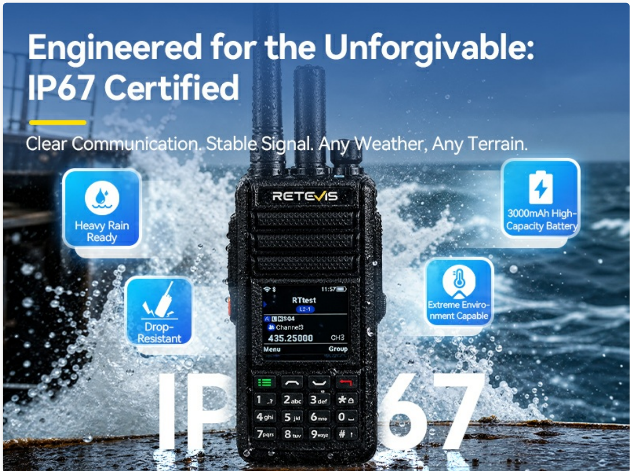
Image: The MateTalk L2 demonstrating its IP67 waterproof capabilities.

The MateTalk L2 is IP67 rated, meaning it is protected from dust and can withstand immersion in water up to 1 meter for 30 minutes. While robust, avoid unnecessary exposure to water and ensure all port covers are securely closed to maintain its waterproof integrity.