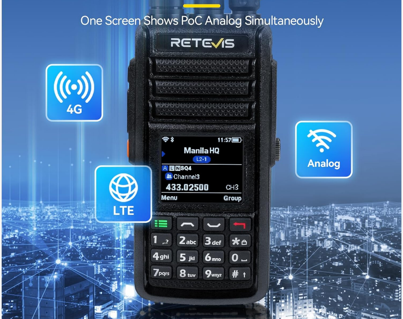
Image: The MateTalk L2 in Mixed Mode, displaying simultaneous 4G Nationwide and Analog Dual Band operation.

One Screen Shows PoC Analog Simultaneously