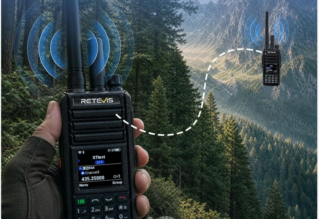
Image: The MateTalk L2 in Analog Mode, supporting dual-band communication without cellular signal.

No cell service required—perfect for emergencies. Your ultimate backup solution for off-grid environments.