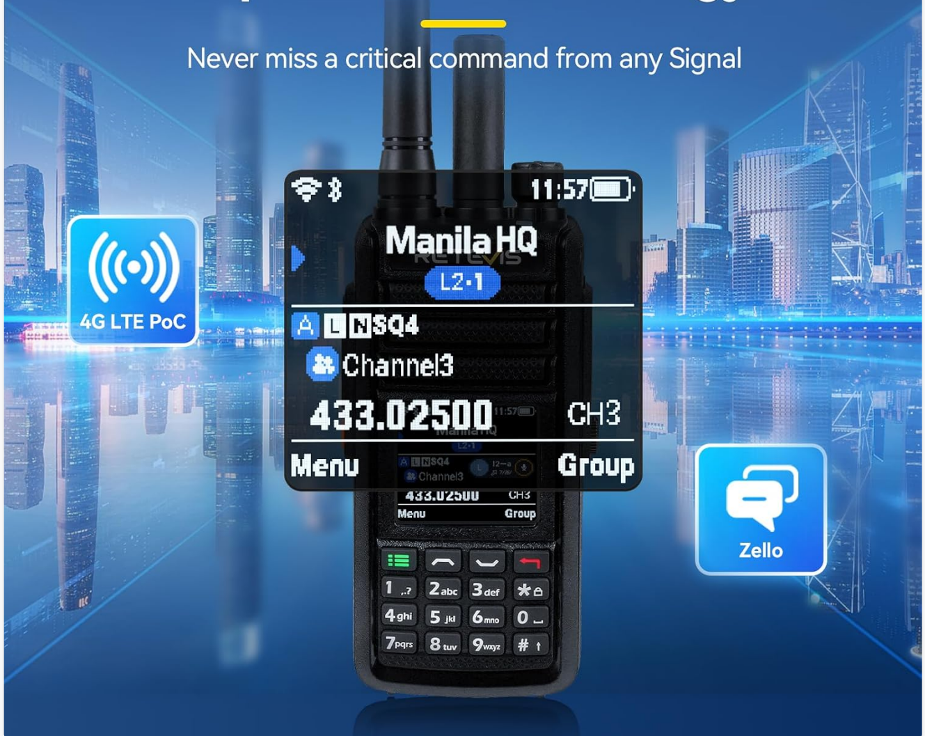
Image: The MateTalk L2 screen demonstrating Triple Watch Technology, monitoring multiple communication channels.

Never miss a critical command from any Signal