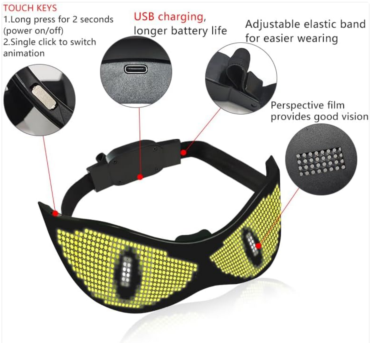
Image: Rear view of the ILEDCOLOR LED Glasses, showing the touch keys for power and animation switching, the USB charging port, and the adjustable elastic band for fit.