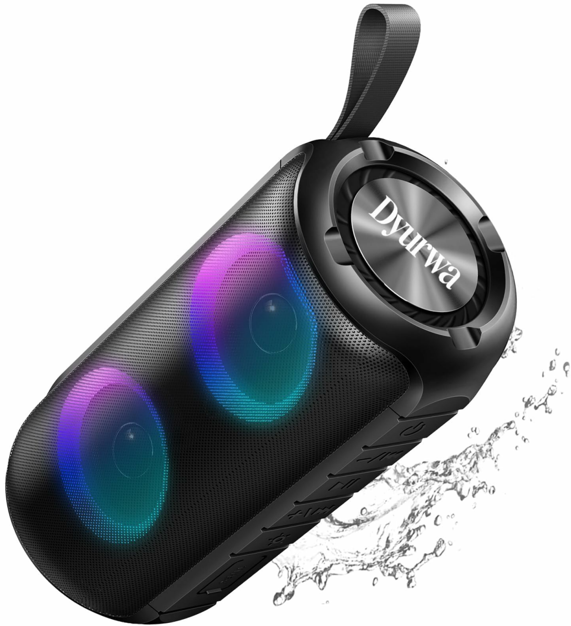
The Dyurwa ZY02 Portable Bluetooth Speaker, showcasing its sleek design.