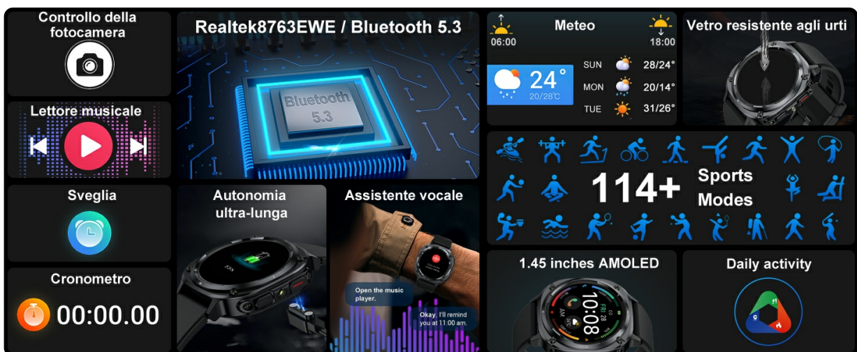
Image: The smartwatch showcasing its practical functions, including music control, weather display, and a flashlight, with additional icons for exercise, health monitoring, and daily reminders.