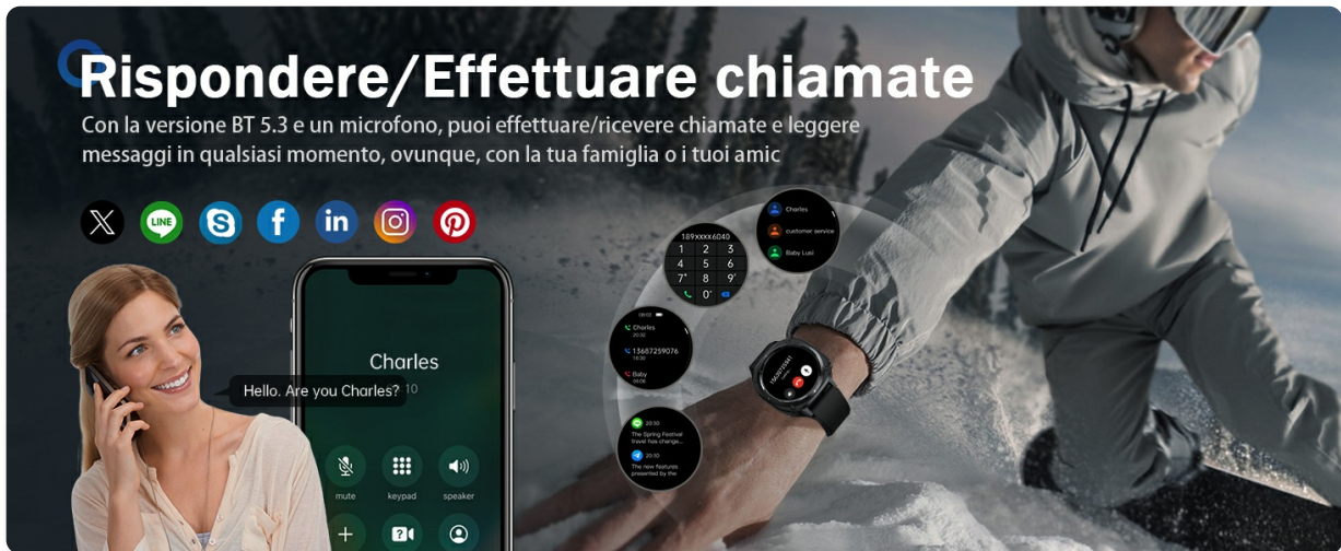
Image: The smartwatch screen showing an incoming call, alongside a smartphone displaying a call interface, illustrating the Bluetooth calling feature.