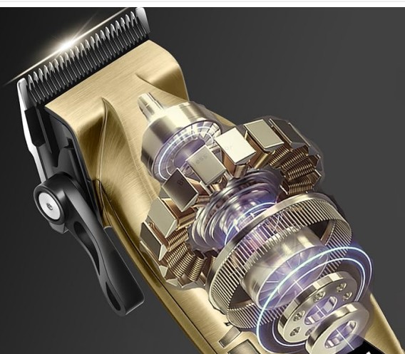
Image: Diagram illustrating the internal 7500 RPM high-speed motor and 2500mAh battery of the KEMEI KM-2230 Hair Clipper.