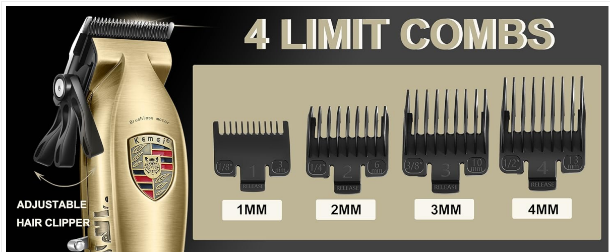
Image: The KEMEI KM-2230 Hair Clipper displayed alongside its four limit combs (1mm, 2mm, 3mm, 4mm).