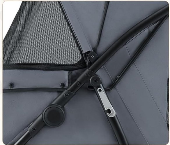
Robust Metal Frame

Image: Visual representation of the adjustable canopy, showing how it can be positioned for optimal pet comfort.