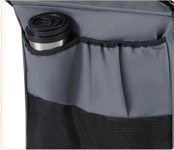
Back Storage Pockets