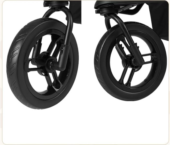
Quick-release Wheels for Easy Setup