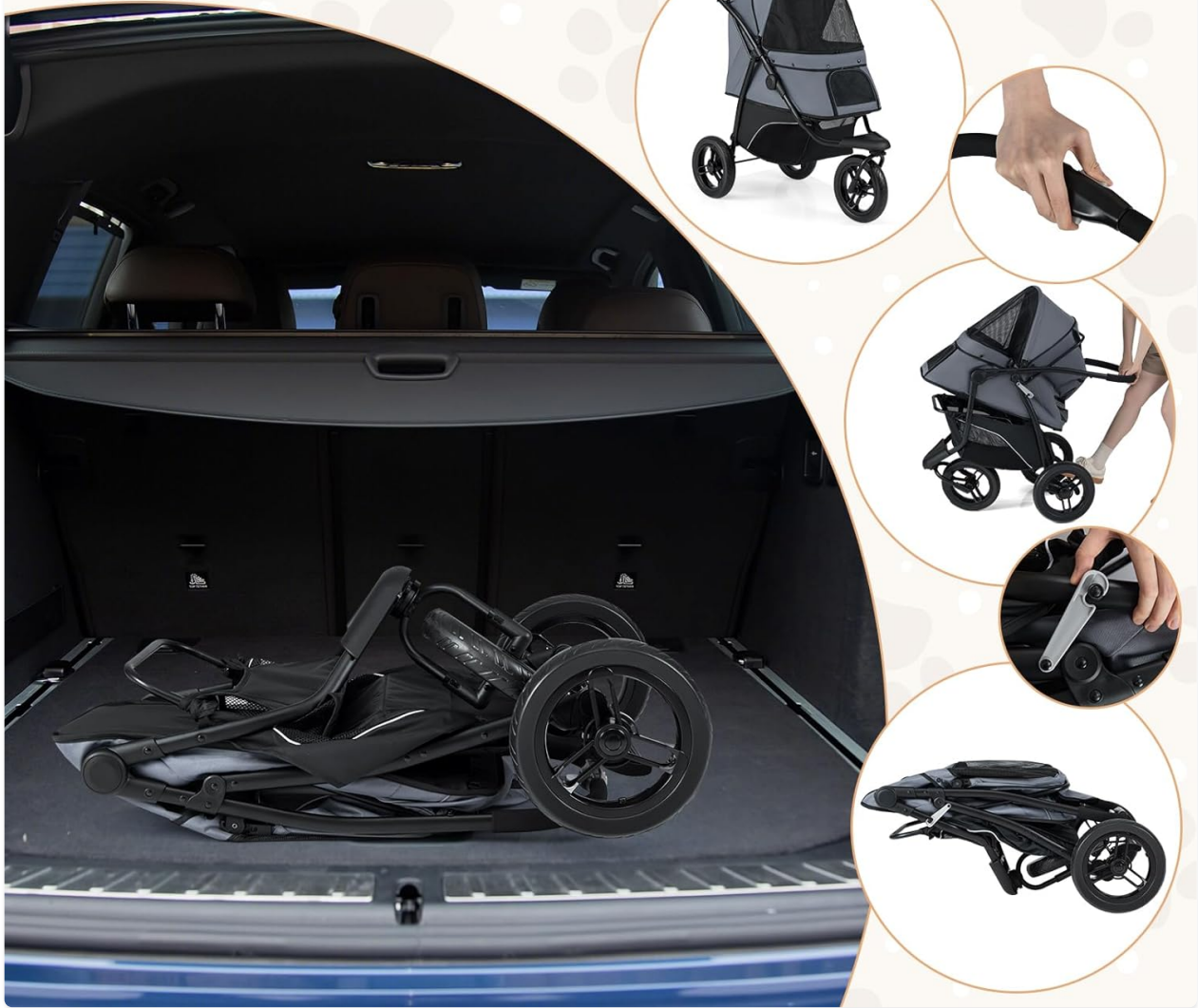
Image: Visual guide demonstrating the one-click quick folding mechanism for easy storage and transport.