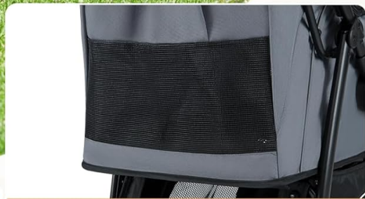
Back Mesh Window

Image: Details of the mesh panels and openings designed to provide ventilation and visibility for pets.