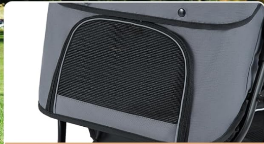
Front Zippered Door