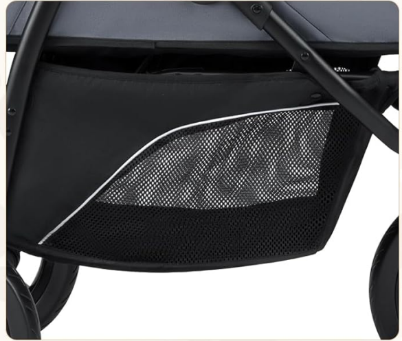
Bottom Storage Basket