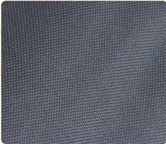
Thick 600D Oxford Cloth