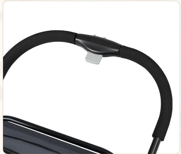
Comfy Foam-padded Handle

Image: Close-up details of the quick-release wheels, safety leash, and fabric material, illustrating ease of setup.