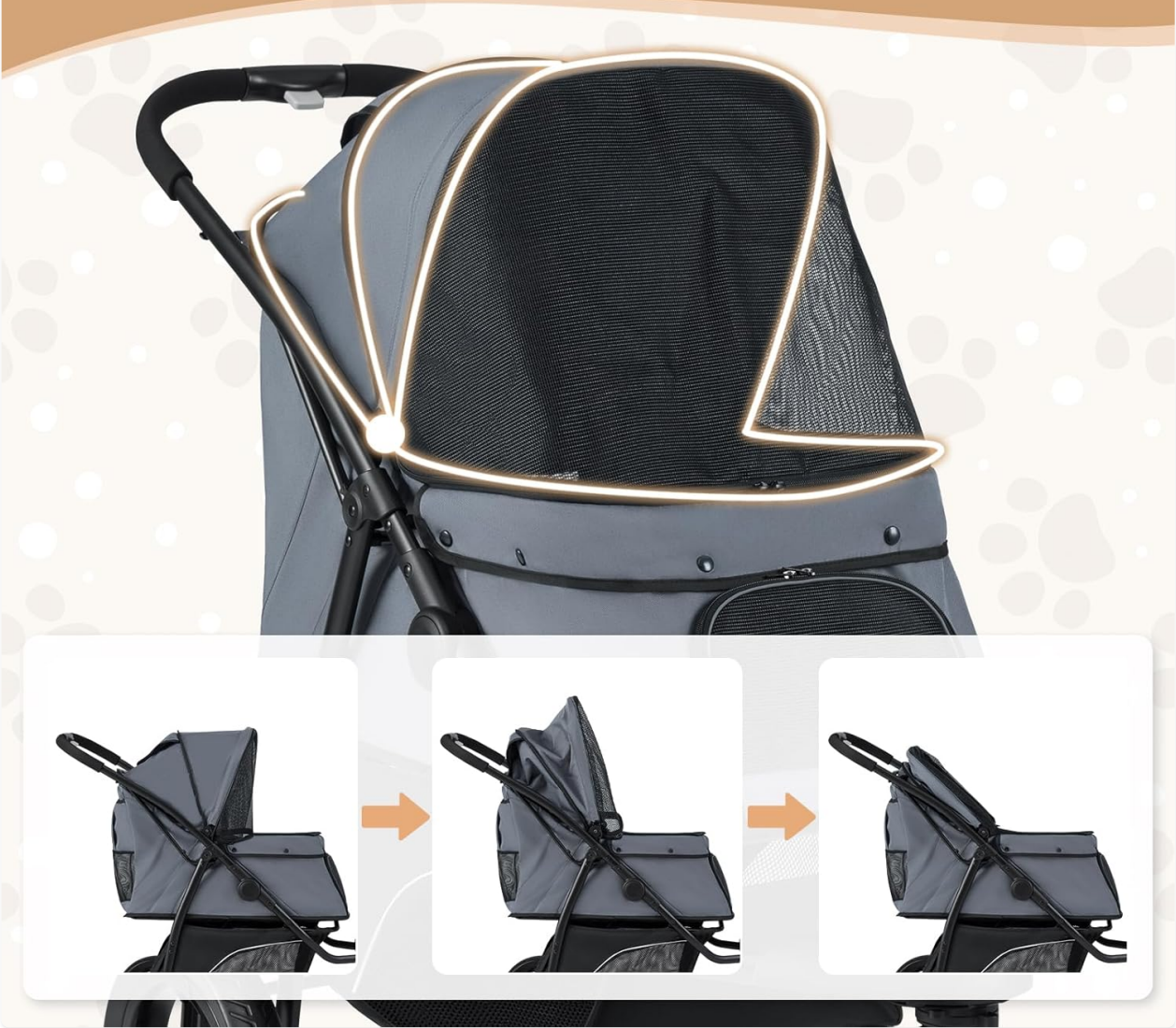
Image: The COSTWAY 3-Wheel Foldable Pet Stroller, showcasing its overall design and functionality.

Offer sun protection and customizable shade for your furry friend