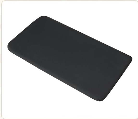
Removable Padded Cushion