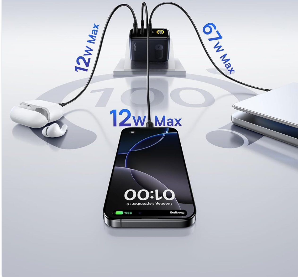
Figure 3: The charger supports simultaneous charging of multiple devices.

BPS 2.0 Technology Dynamically Allocates Power for Optimal Charging Speed and Efficiency