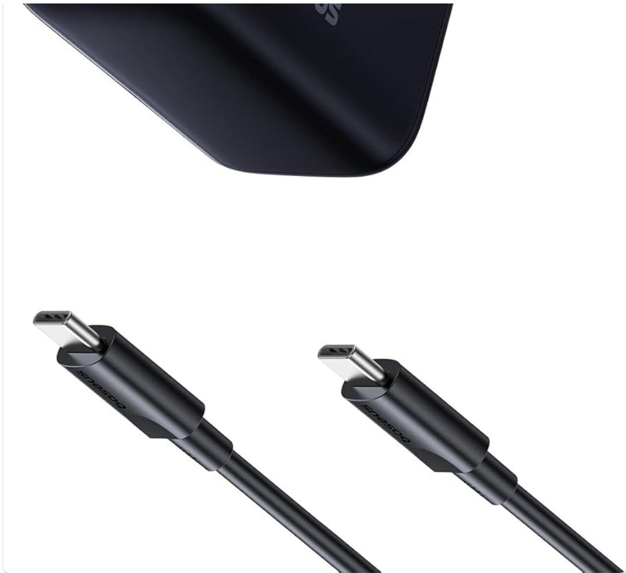
Figure 1: Baseus Picogo 100W USB C Charger and included cables.

The Baseus Picogo 100W USB C Charger is a multi-port power adapter designed for fast charging a variety of devices, including laptops, tablets, and smartphones. It features a smart digital display for real-time monitoring and incorporates advanced GaN technology for efficient and safe operation.