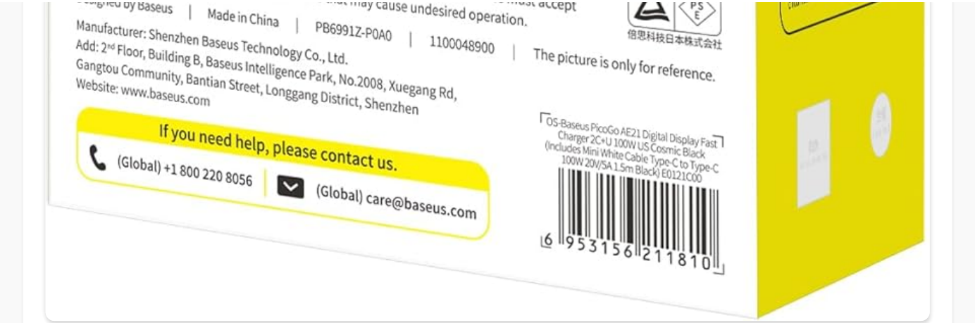
Figure 4: Back of product packaging with support details and certifications.