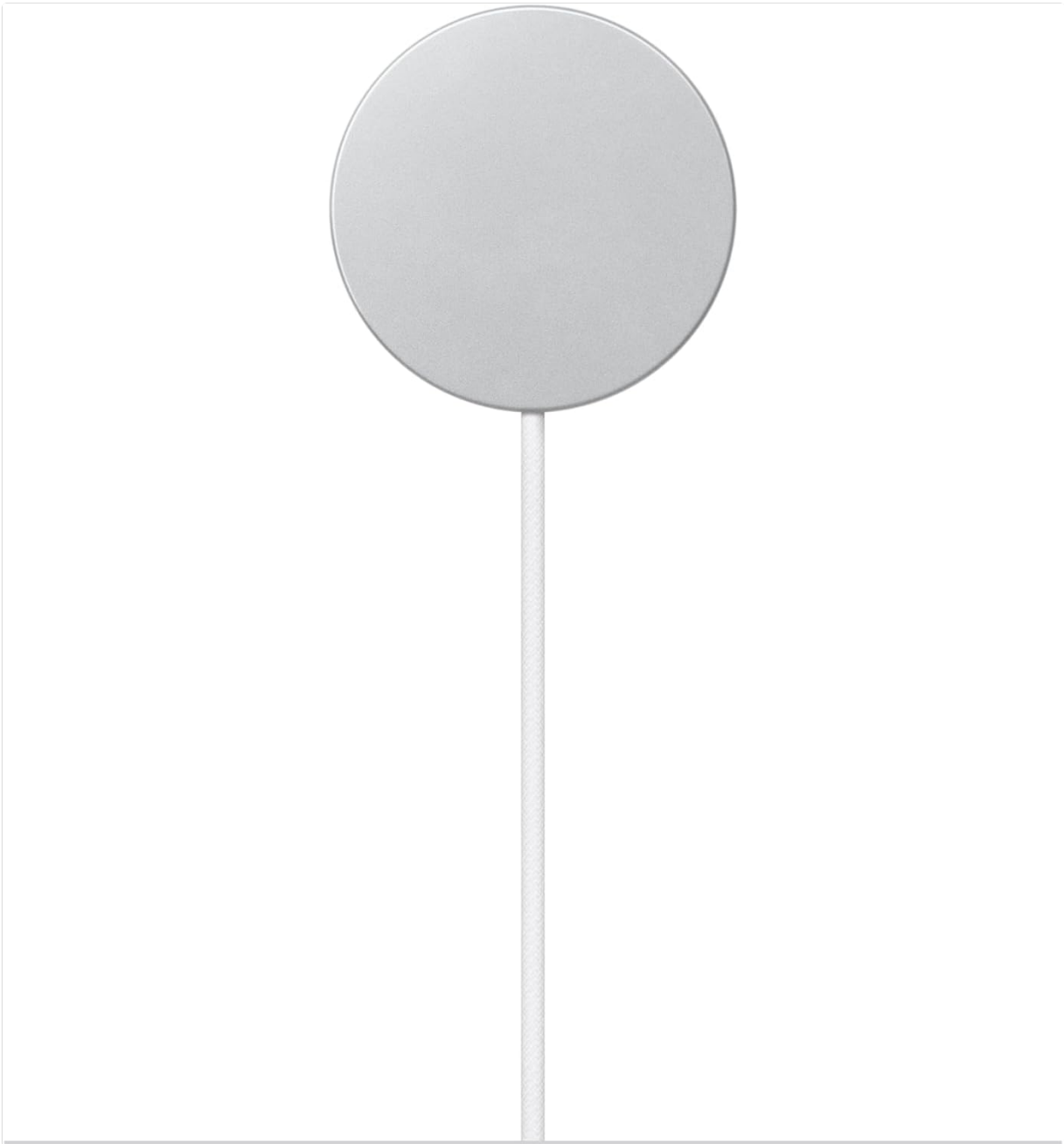
Image: Back view of the Apple MagSafe Charger, showing its sleek, unadorned surface.