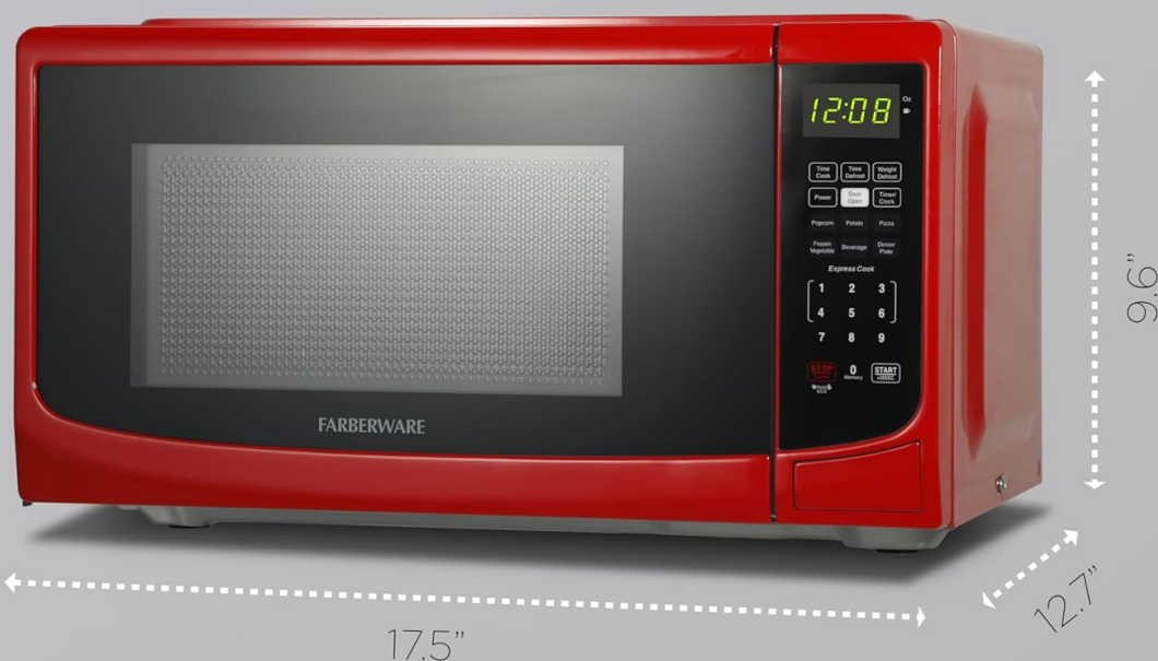
Image: The Farberware 0.7 Cu. Ft. Countertop Microwave Oven with its dimensions (17.5"W x 12.7"D x 9.6"H) indicated, illustrating its compact size.

compact size to make the most of your space