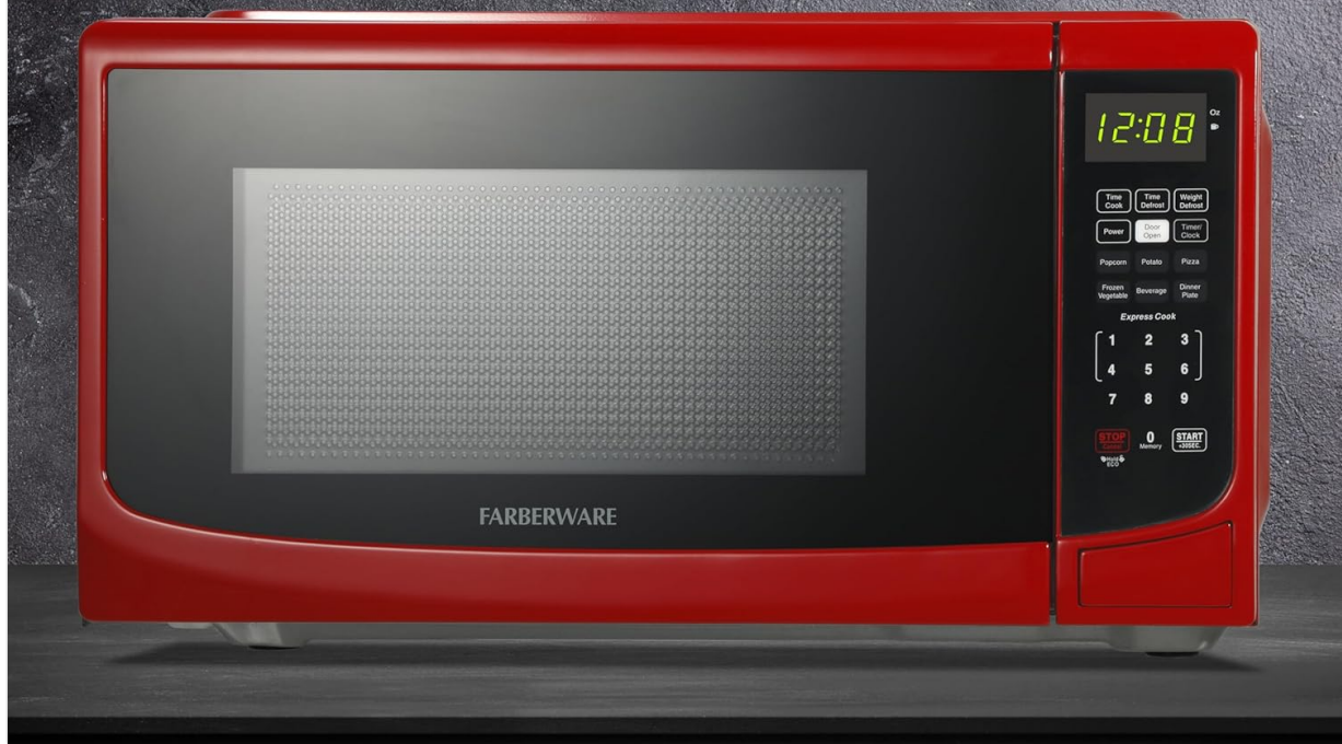
Image: Front view of the Farberware 0.7 Cu. Ft. Countertop Microwave Oven in red, highlighting its compact design and control panel.