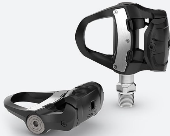
RALLY™ RK 110 | 210

Image: The Garmin Connect™ app logo and its interface displayed on a smartphone, showing activity tracking and training status.