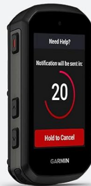
INCIDENT DETECTION FOR PEACE OF MIND 1

1 When paired with your smartphone. Neither your device nor the Garmin Connect app contacts emergency services on your behalf. Do not rely on as a primary method to obtain emergency assistance.