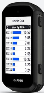
ELECTRONIC SHIFTING CONNECTIVITY