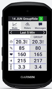
STAY CONNECTED WITH GROUPRIDE