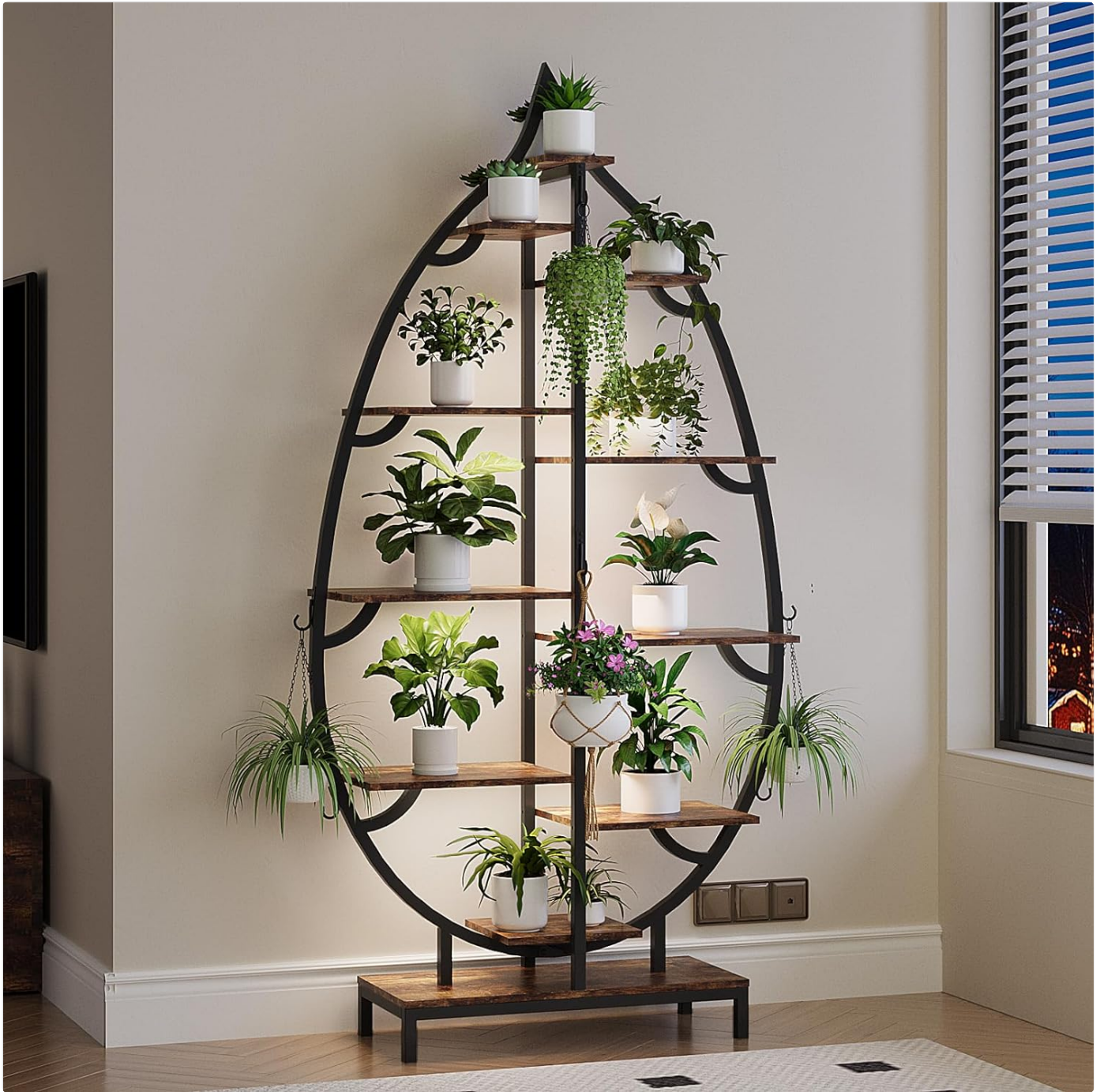
Image: The fully assembled plant stand, showcasing its leaf-shaped design and multiple tiers for plants.

Attach the vertical support bars to the main frame. Then, place the wooden shelf boards onto their designated positions on the frame. The shelves are staggered to create the leaf-shaped design. Secure each shelf with screws.