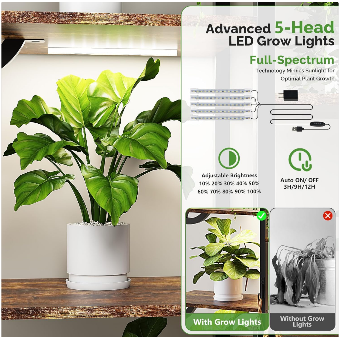
Image: Illustration of the LED grow light system, detailing its full-spectrum capability, brightness levels, and timer functions. A visual comparison highlights plant growth with and without the lights.