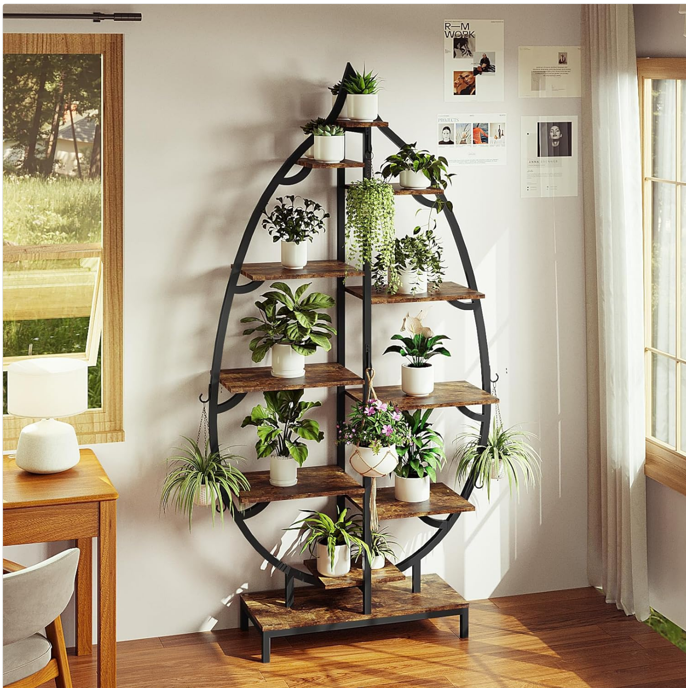
Image: The plant stand in a home environment, demonstrating its placement and capacity for various plants.