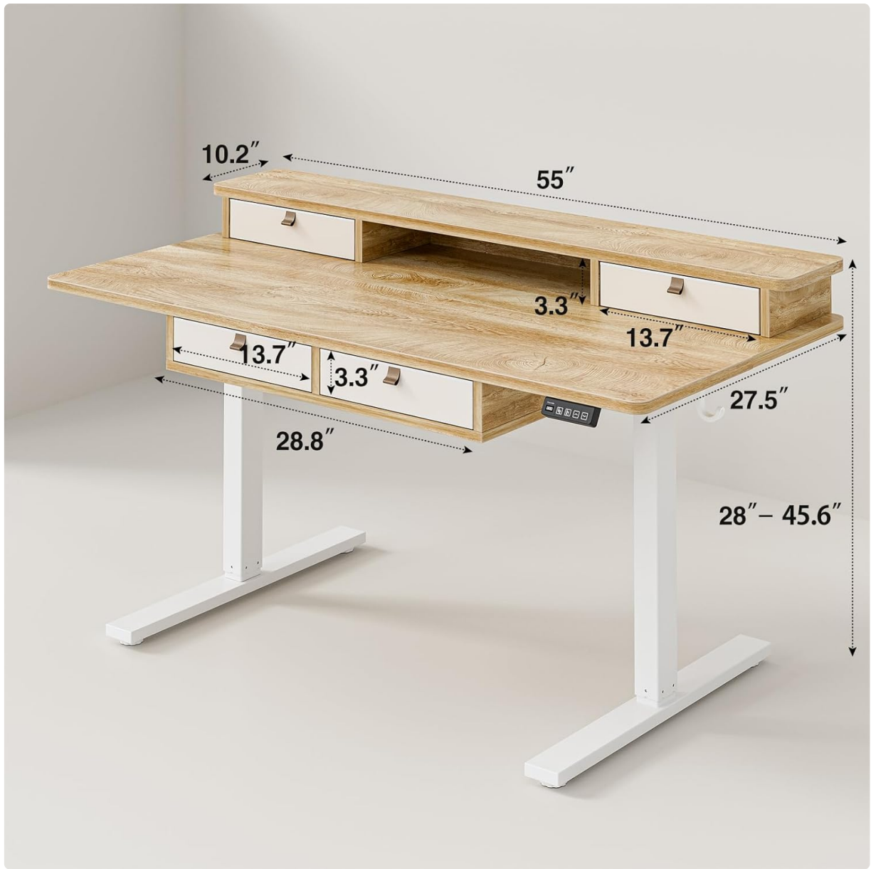
Image: Desk dimensions for reference during assembly and placement.