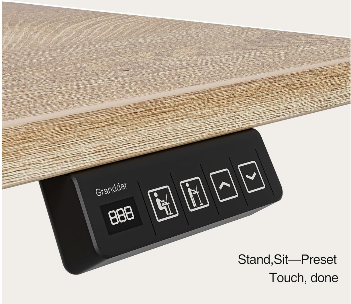
Image: The hand controller for the electric standing desk, showing the digital display and control buttons.