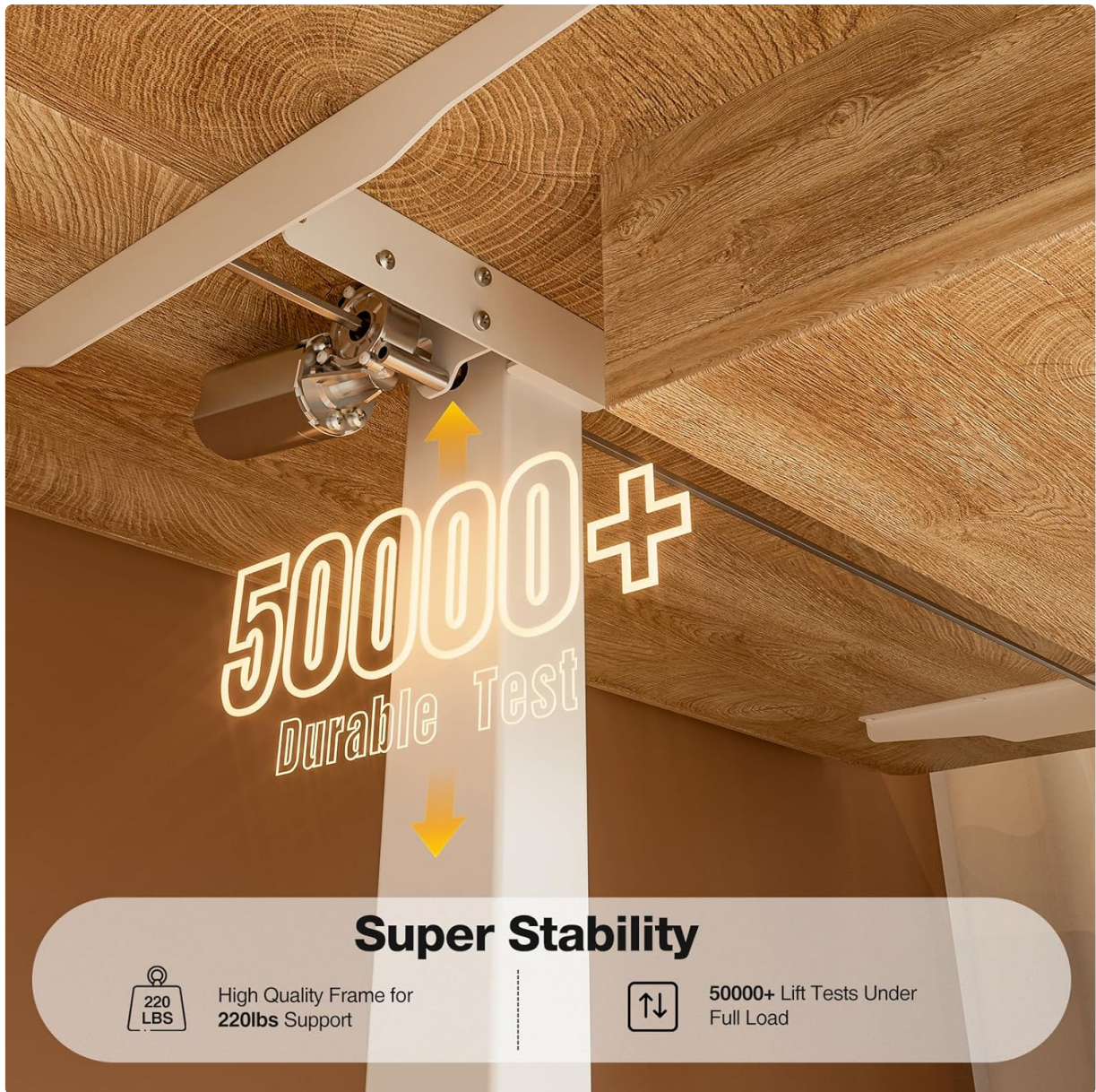
Image: The desk's robust construction, tested for over 50,000 lifts, ensuring stability and durability.