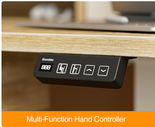
Multi-Function Hand Controller