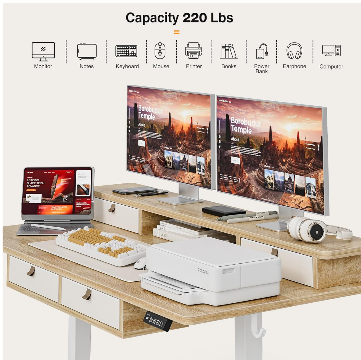
Image: The desk's capacity to hold various office items, up to 220 lbs.