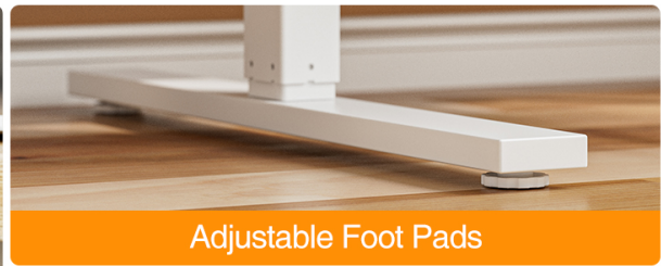
Adjustable Foot Pads