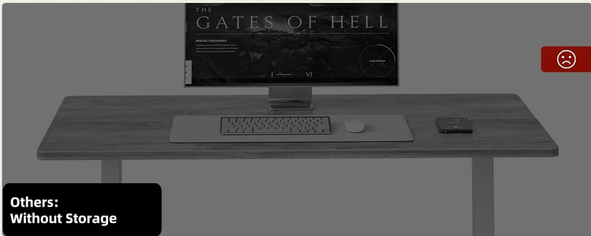
Image: Comparison illustrating the enhanced storage capabilities of the Grandder desk.