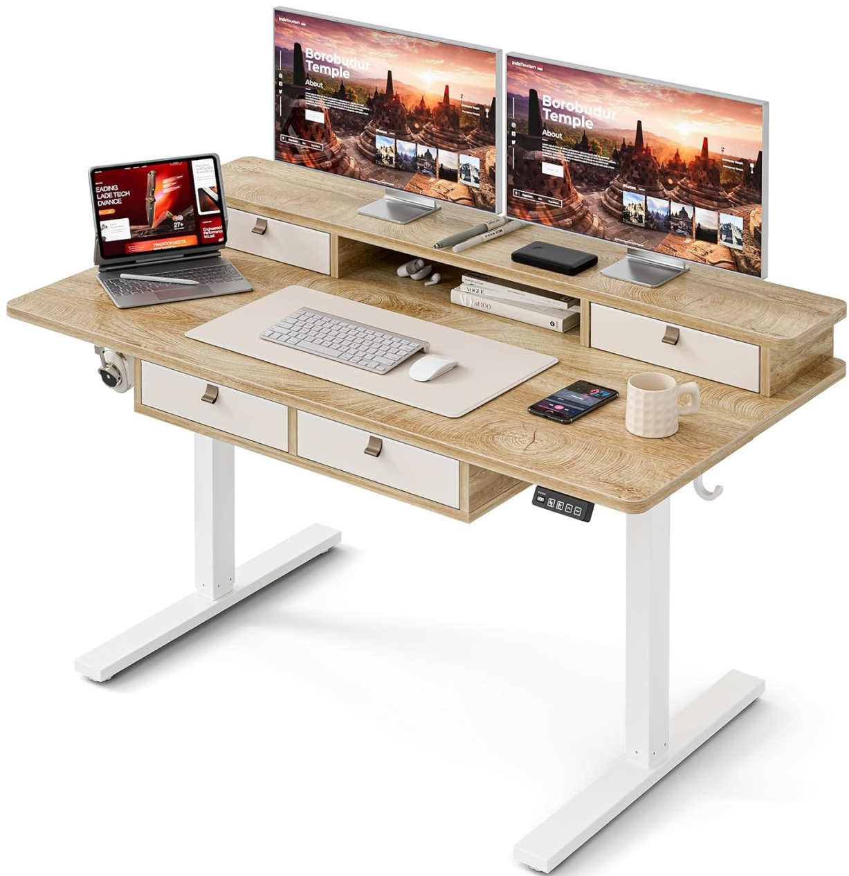
Image: The Grandder electric standing desk, showcasing its spacious desktop, integrated storage, and monitor stand.