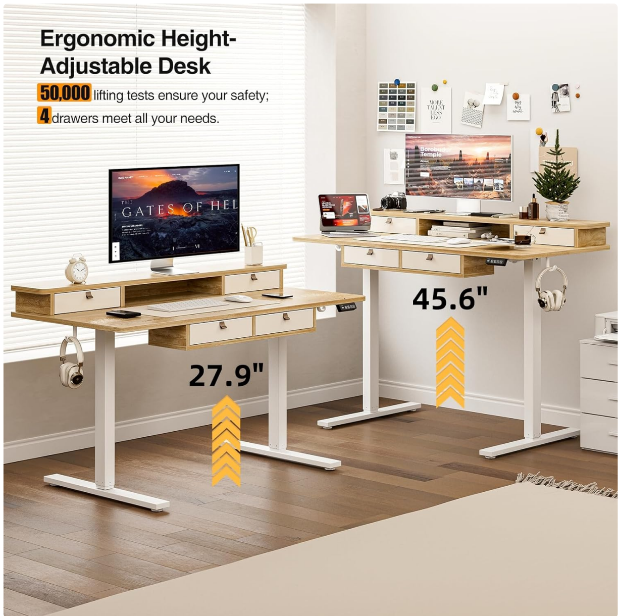
Image: Visual representation of the desk's adjustable height range, from sitting to standing positions.