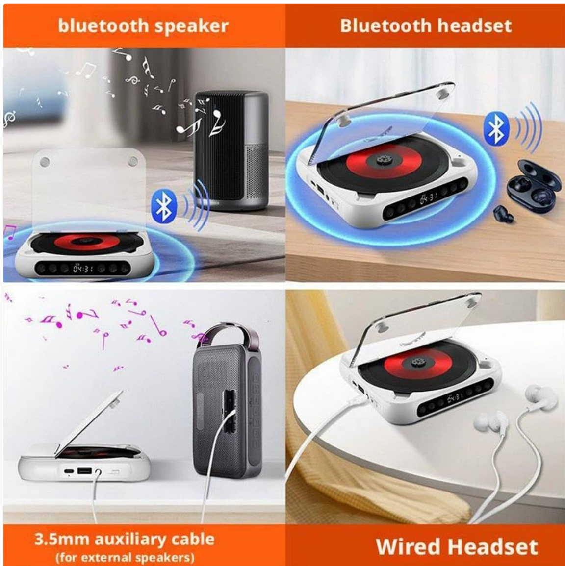
Image: Illustrations of the CD player connecting to a Bluetooth speaker, Bluetooth headset, external speakers via 3.5mm auxiliary cable, and wired headphones.