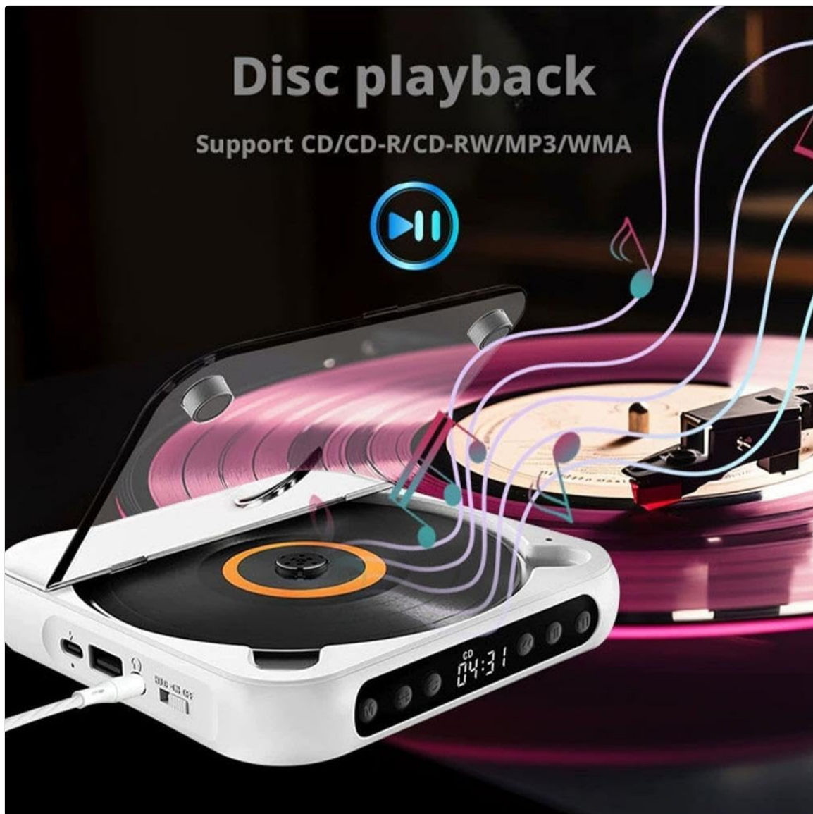
Image: The CD player with a disc spinning, illustrating the disc playback function. Supports CD/CD-R/CD-RW/MP3 formats.