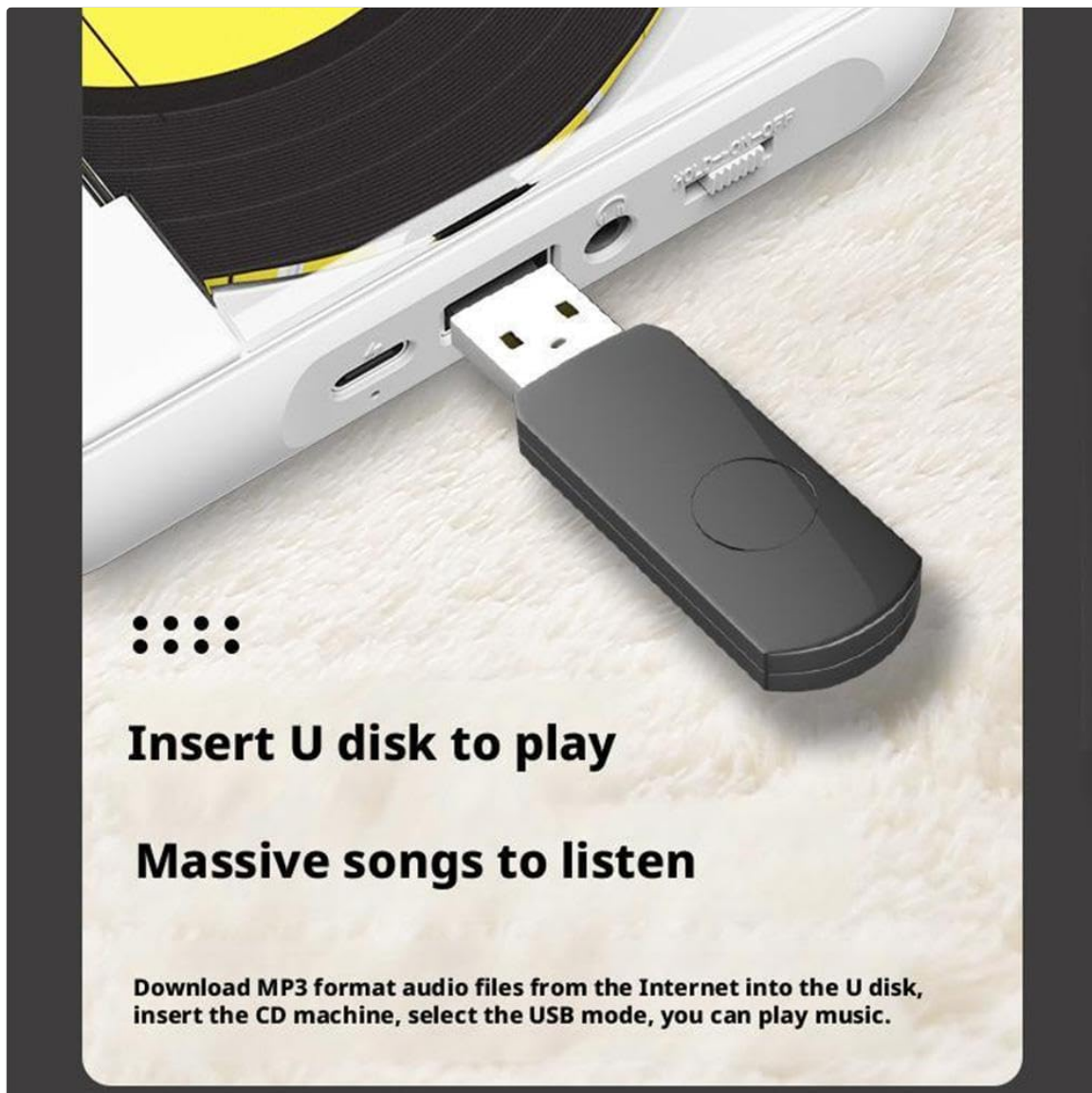
Image: A USB flash drive inserted into the USB port of the CD player, demonstrating USB playback capability for MP3 files.