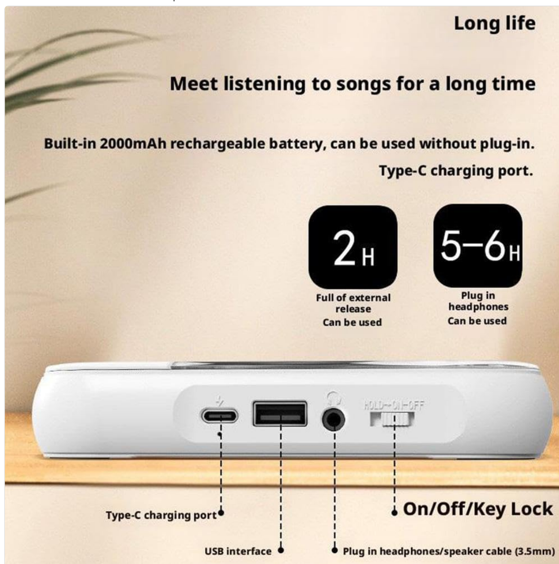
Image: Side view of the CD player with labels for Type-C charging port and estimated battery life for different usage scenarios.

will show the charging status. A full charge provides approximately 2 hours of playback with external release or 5-6 hours with headphones.