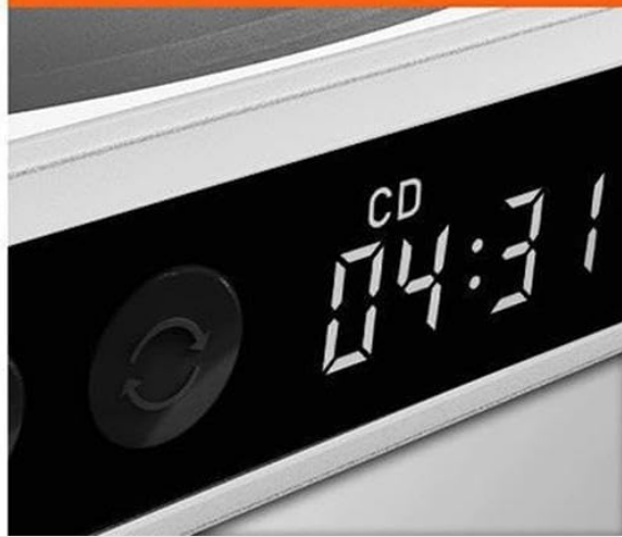
Image: Front and side view of the CD player, highlighting the USB port, HOLD switch, and control buttons. The display shows "04:31".