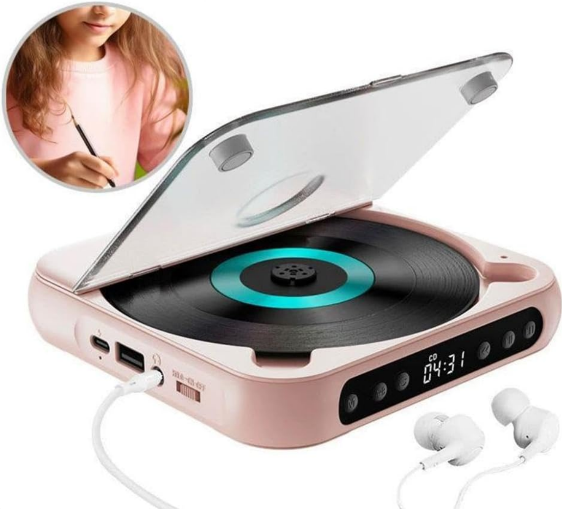
Image: The CD player with a highlighted repeat button, indicating its use for repeating tracks or entire discs.