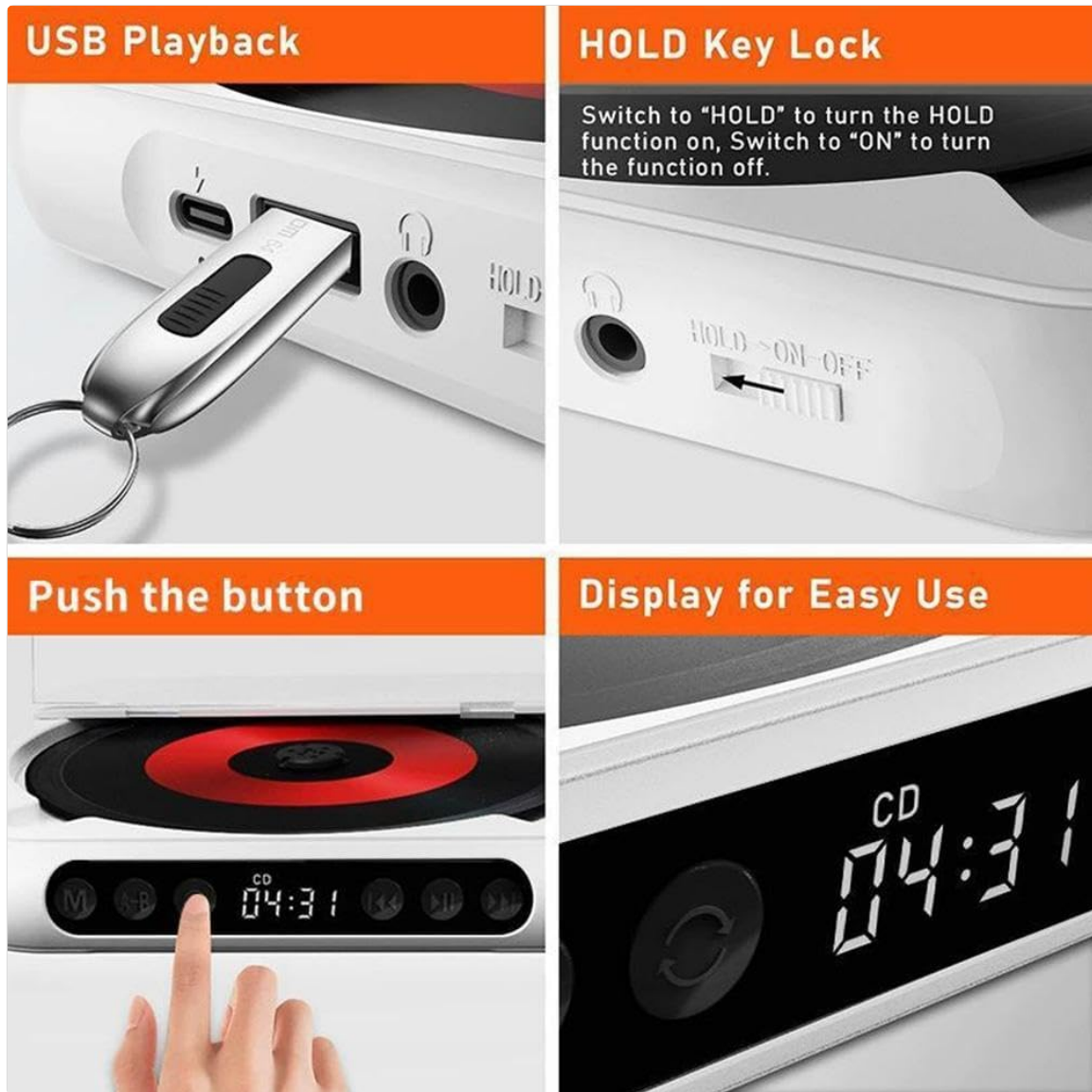
Image: Detail of the HOLD switch, indicating "HOLD" and "ON" positions for locking and unlocking the player's functions.