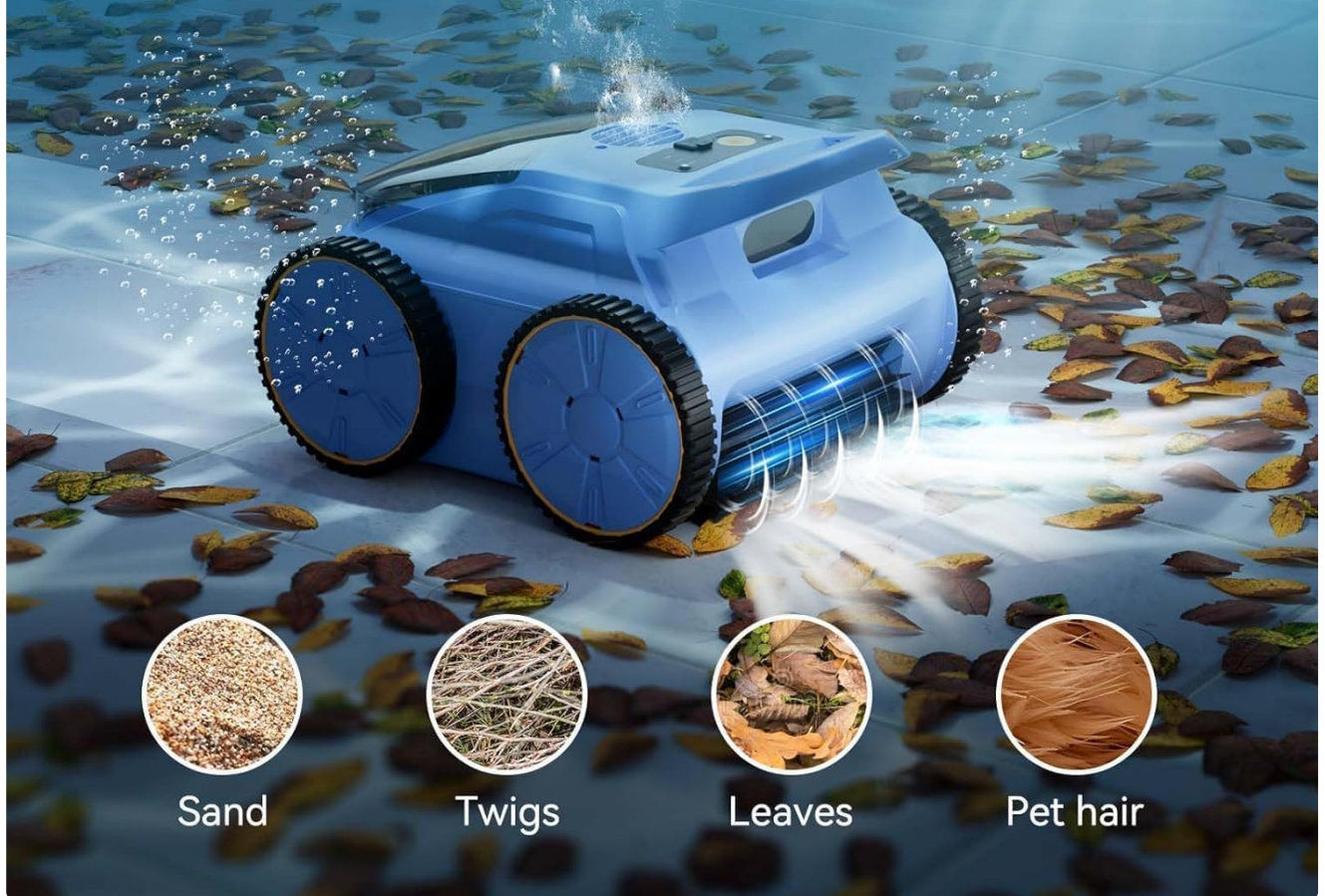
Figure 3.2: The cleaner's powerful 180W motor and 80GPH filtration capacity effectively remove various debris types.

The 180W powerful motor easily lifts debris stuck to the pool floor.