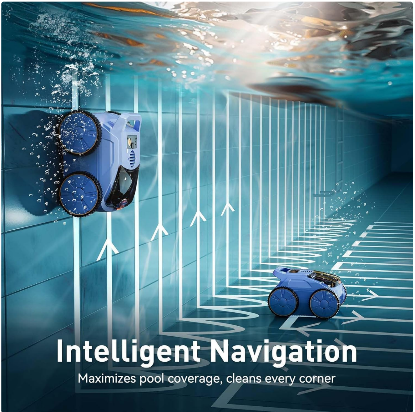
Figure 3.3: Intelligent navigation ensures systematic cleaning paths for optimal pool coverage.