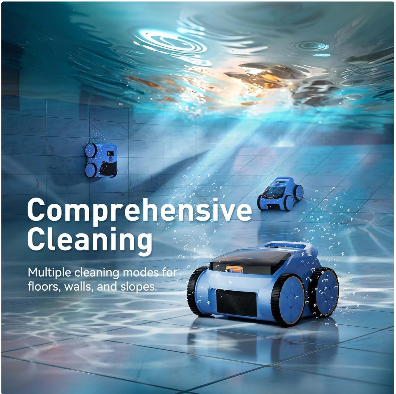
Figure 3.1: The ABNEMEN SAT20 Robotic Pool Cleaner demonstrating comprehensive cleaning modes for floors, walls, and slopes.