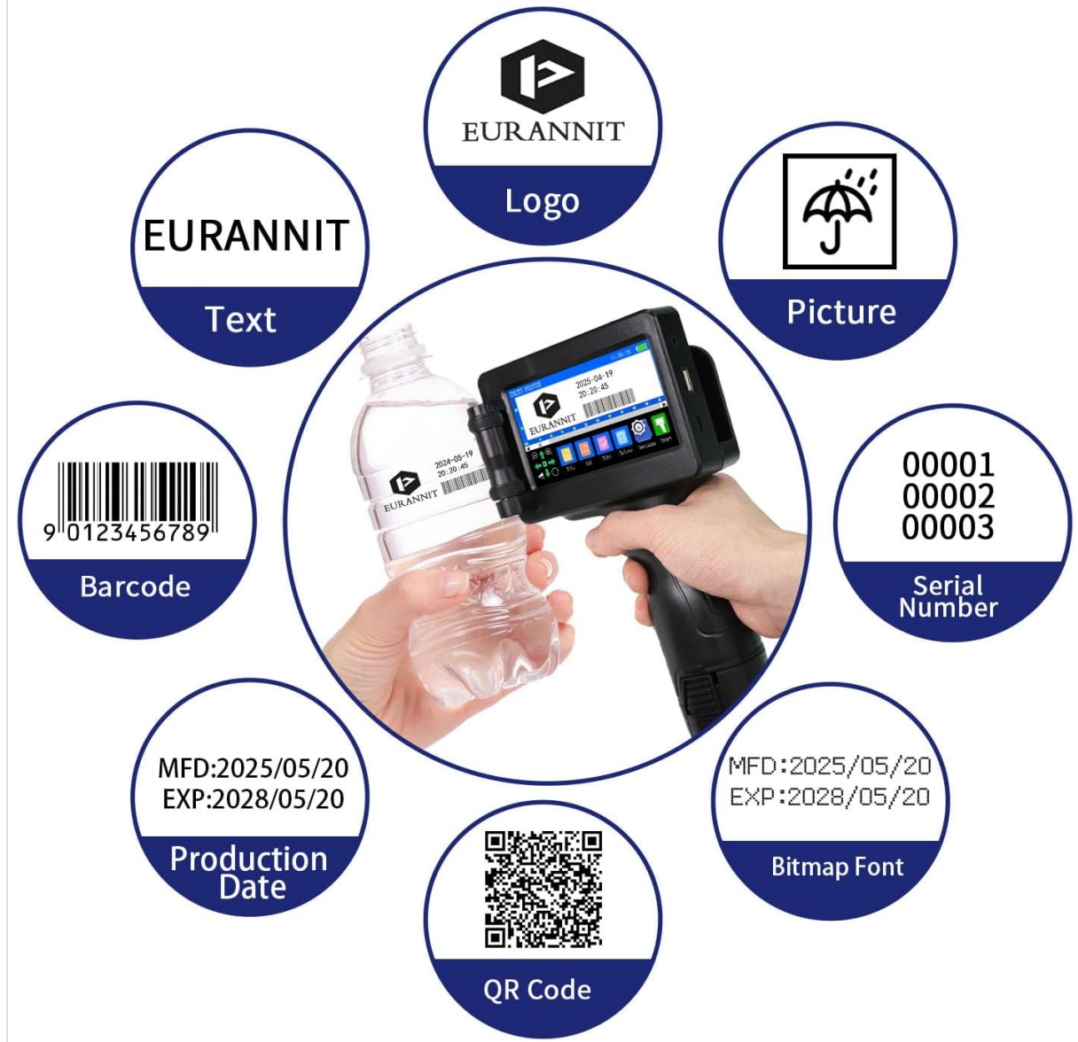
Image: An illustration showcasing the diverse range of content that can be printed, such as text, logos, images, barcodes, serial numbers, production dates, bitmap fonts, and QR codes.