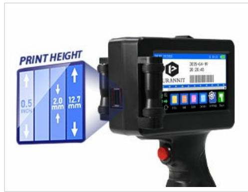
Image: The Eurannit E55 Handheld Inkjet Printer, along with its quick-dry ink cartridge, power adapter, location plate, U-disk, touch pen, and protective suitcase.