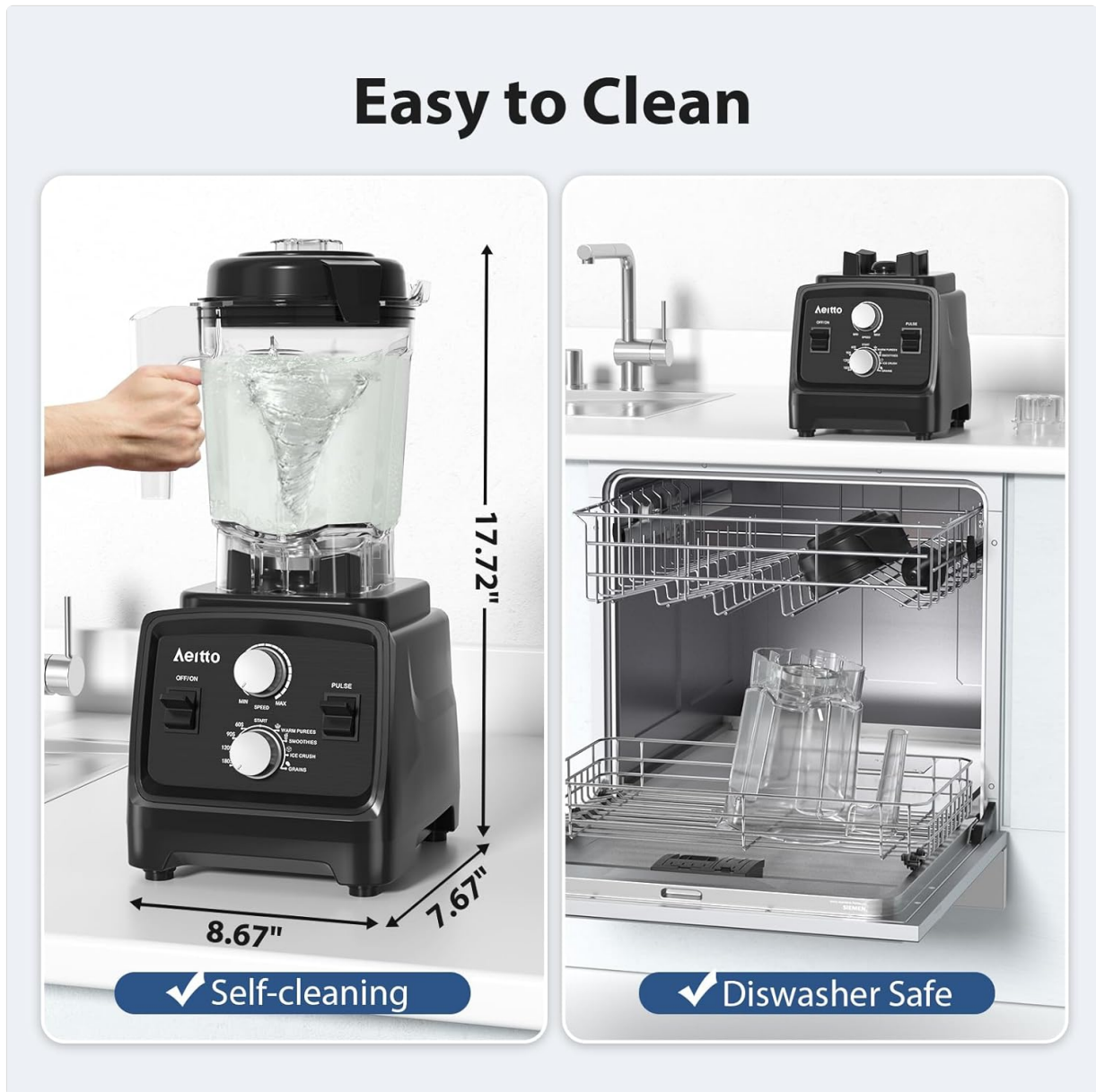
Image: Visual representation of the blender's self-cleaning capability and dishwasher-safe components.

Wipe the motor base with a damp cloth. Do not immerse the motor base in water or spray it with water. Ensure it is completely dry before storing or next use.