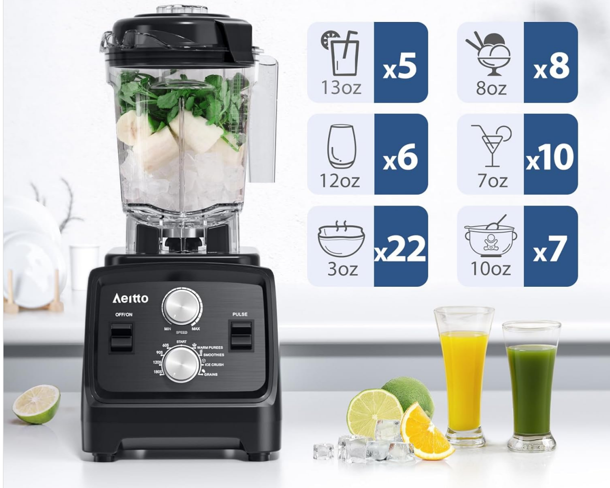
Image: The 68oz blending jar demonstrating its large capacity for preparing multiple servings.