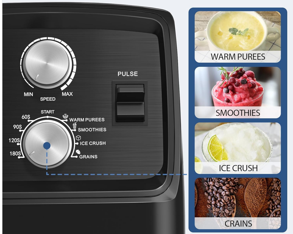
Image: Close-up of the Aeitto blender's control panel.

Just turn the knob to make your favourite drink