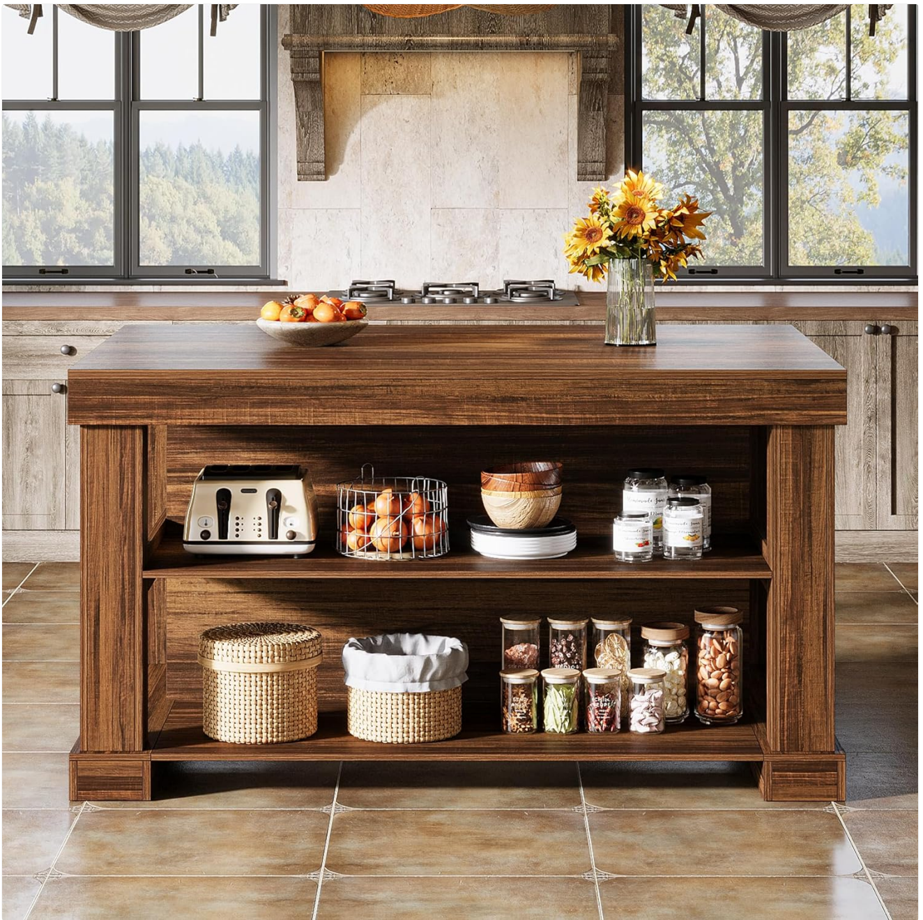
Figure 5: The bar table serving as a functional kitchen island.