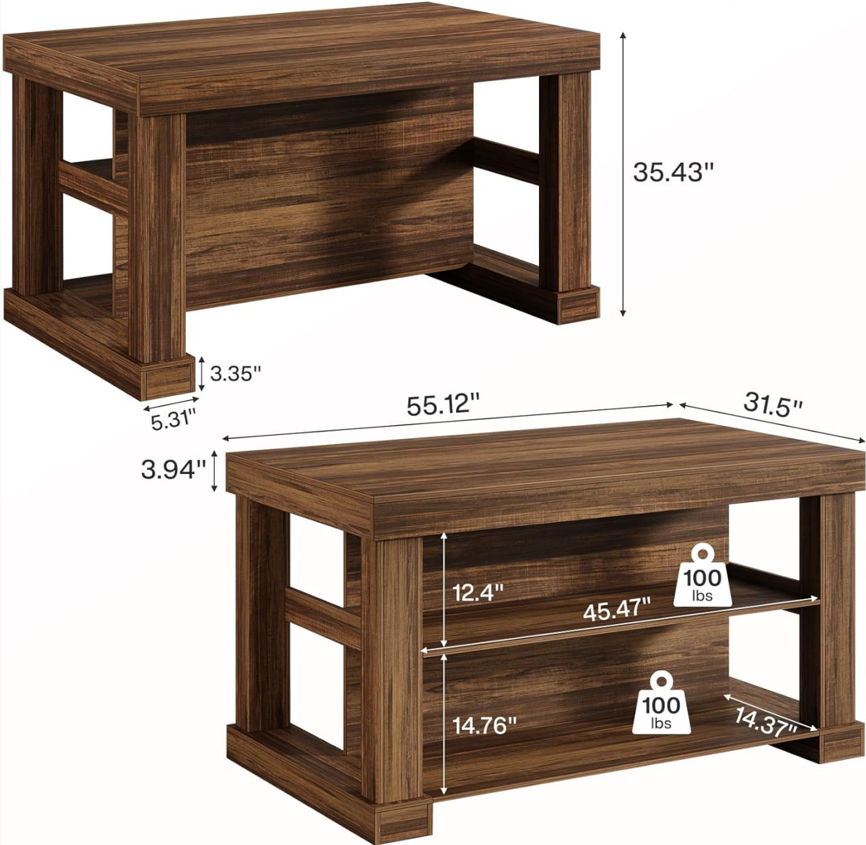
Figure 1: Overall dimensions of the Tribesigns Bar Table.

The table measures 31.5 inches (D) x 55.12 inches (W) x 35.43 inches (H). The tabletop is 3.94 inches thick, contributing to its stability.