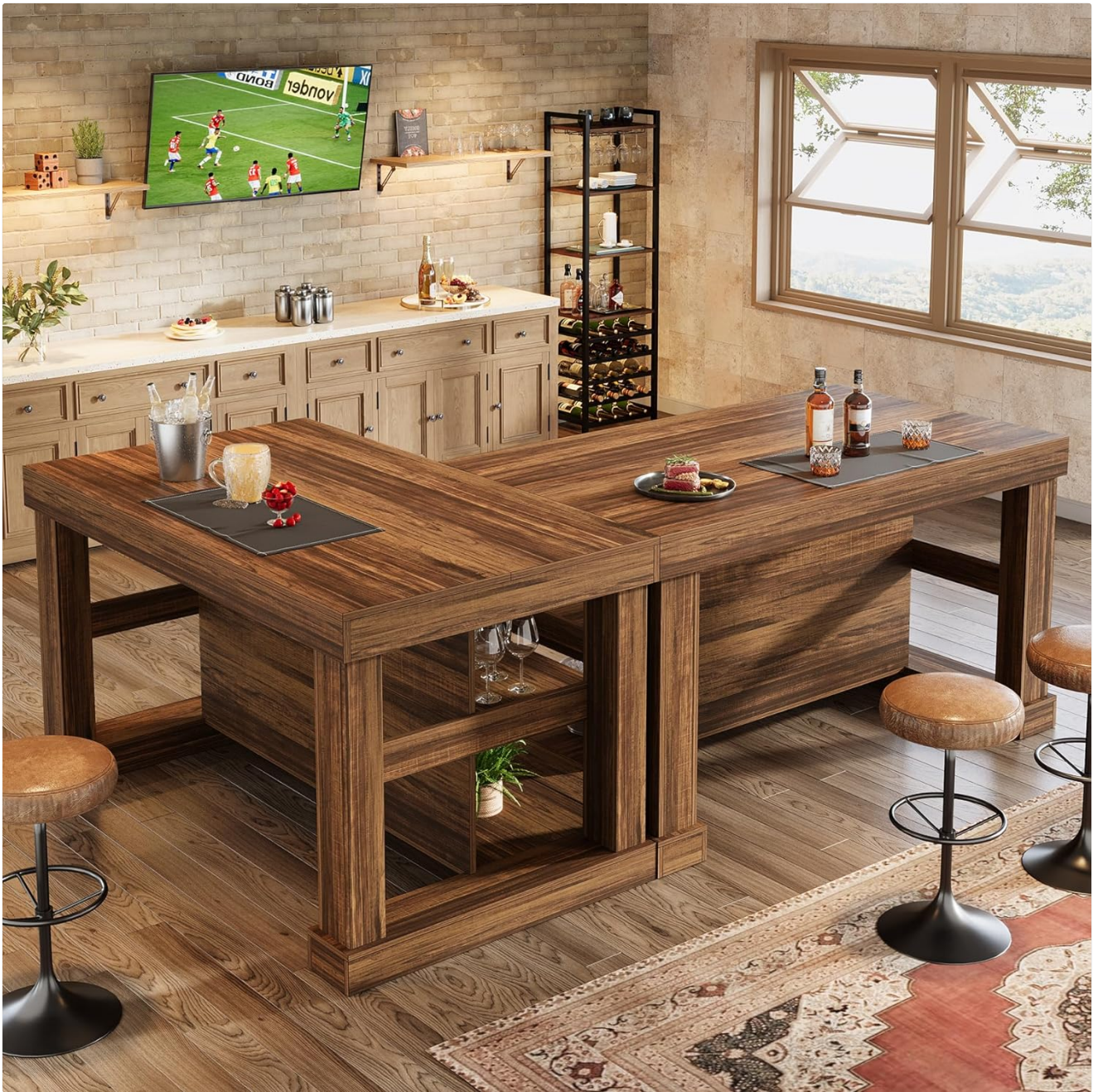
Figure 4: The bar table configured for a home bar setting.