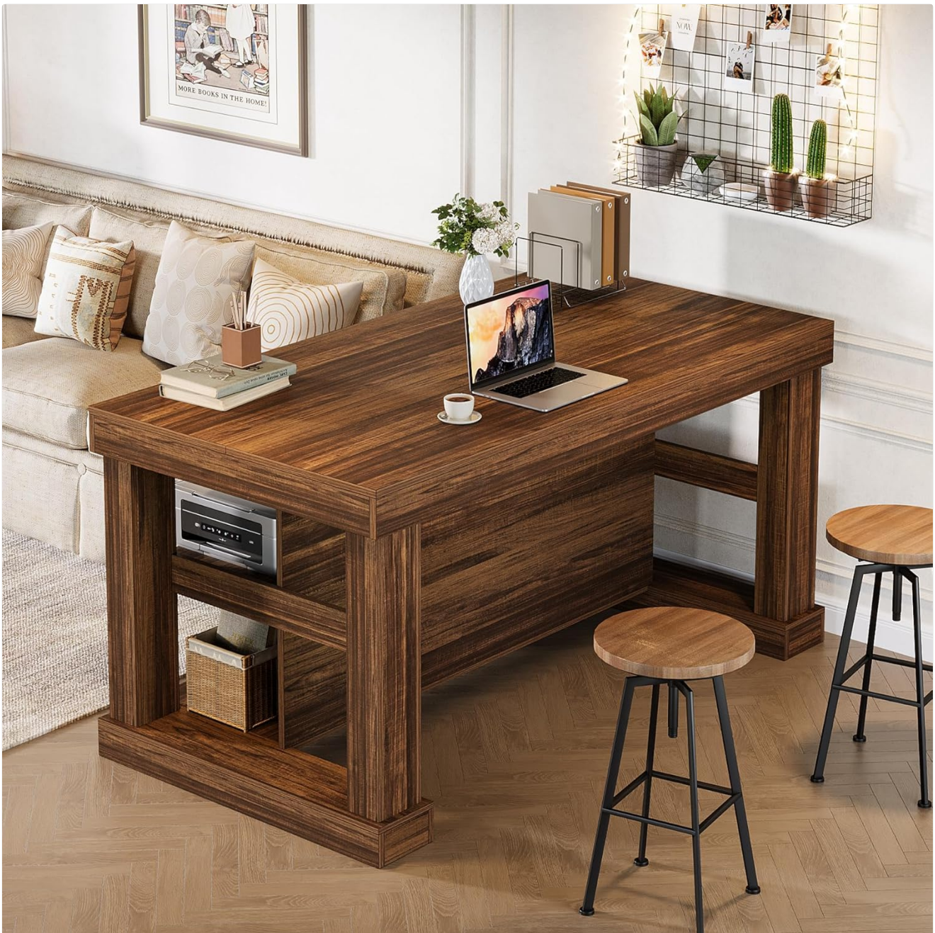
Figure 6: The bar table utilized as a spacious work desk.

Your browser does not support the video tag.