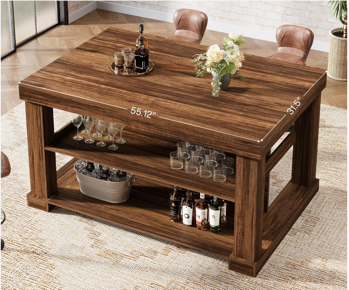
Figure 2: Detailed view of the spacious worktop dimensions.

31.5" D x 55.12" W top is roomy for lots of kitchen jobs