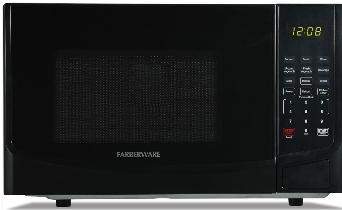
Image: Front view of the Farberware 0.9 Cu. Ft. Black Microwave Oven.

Your microwave oven is designed for cooking, reheating, and defrosting various food items. It features 900 watts of power, 10 power levels, and 8 convenient auto-cook presets to simplify your cooking experience.