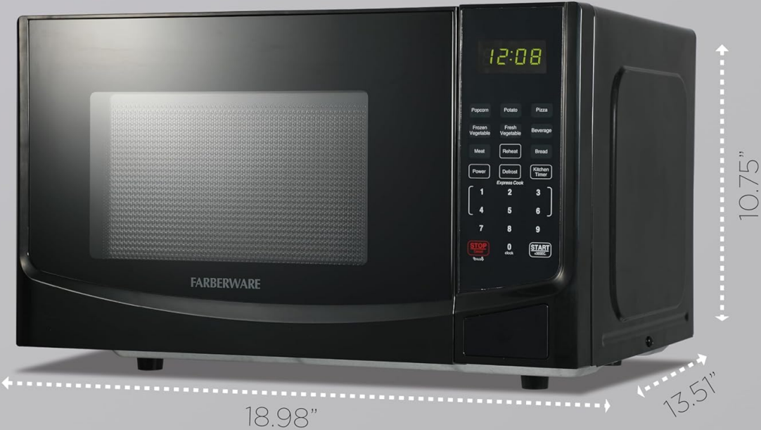
Image: Side view of the microwave with key dimensions (width, depth, height) indicated.

compact size to make the most of your space