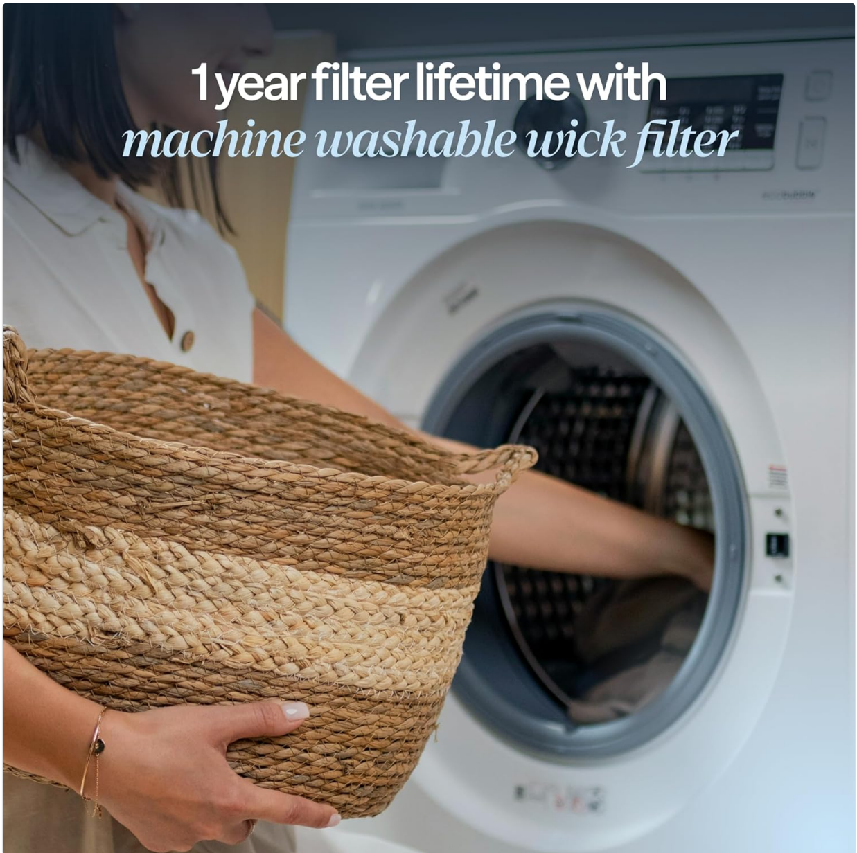
Image: A wick filter being placed into a washing machine for cleaning.