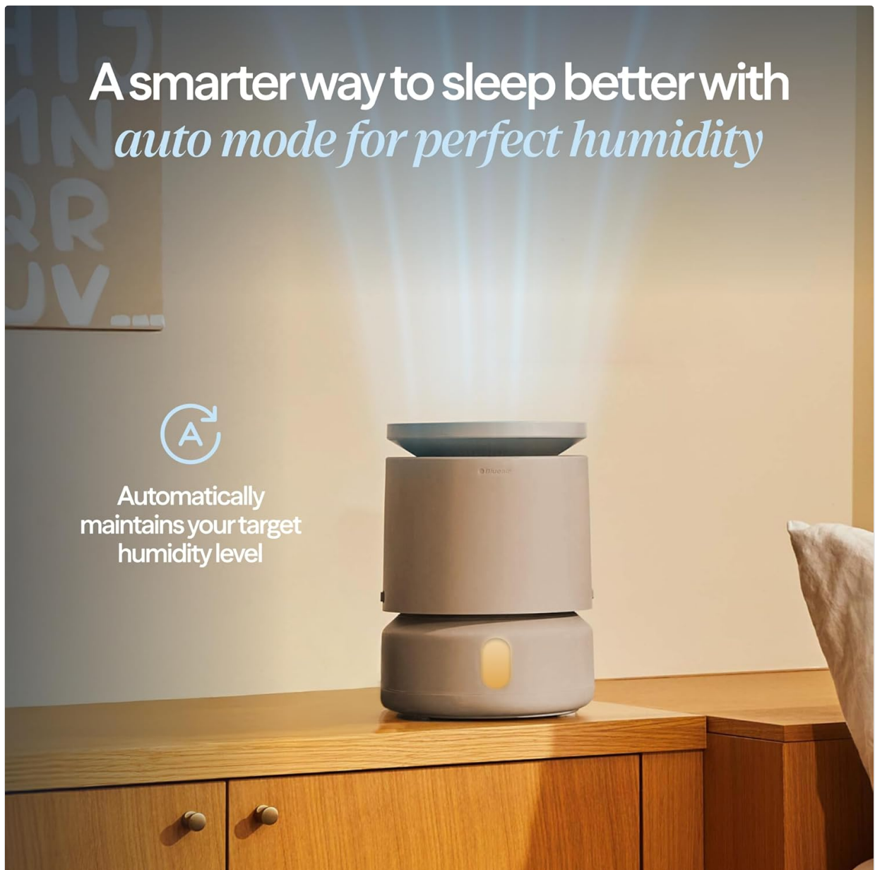
Image: The humidifier operating in auto mode, maintaining a set humidity level.

The humidifier features an auto mode that automatically maintains your target humidity level. You can adjust the target humidity using the controls on the unit or through the Blueair app.