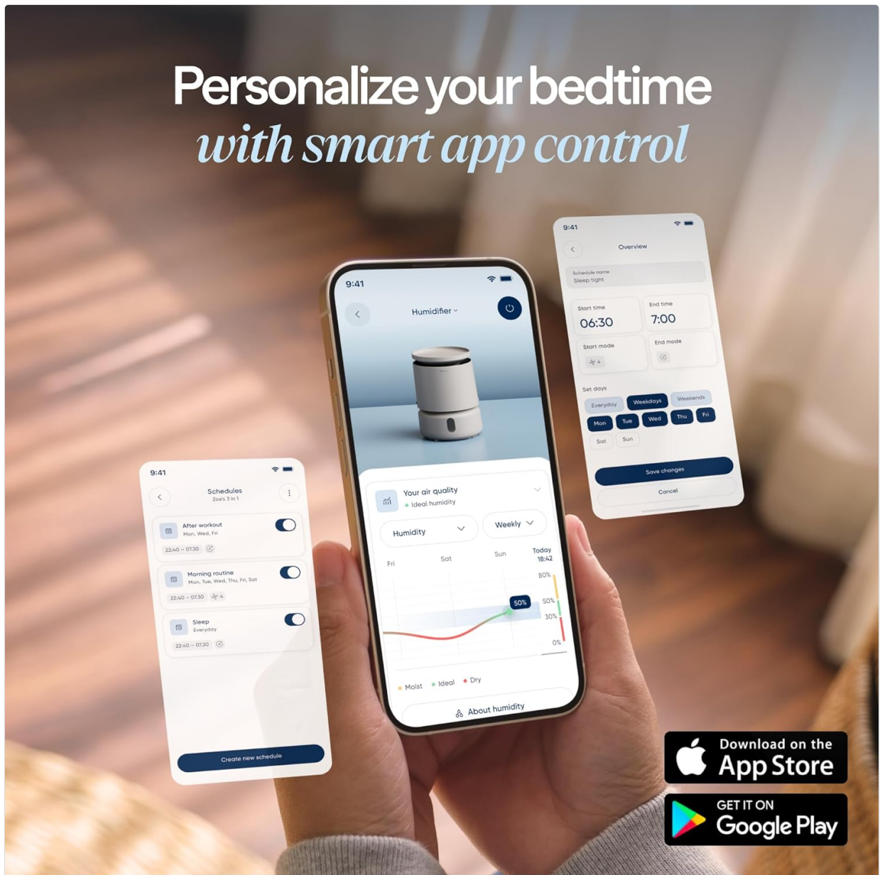
Image: A smartphone screen showing the Blueair app, which allows users to control humidifier settings and view schedules.