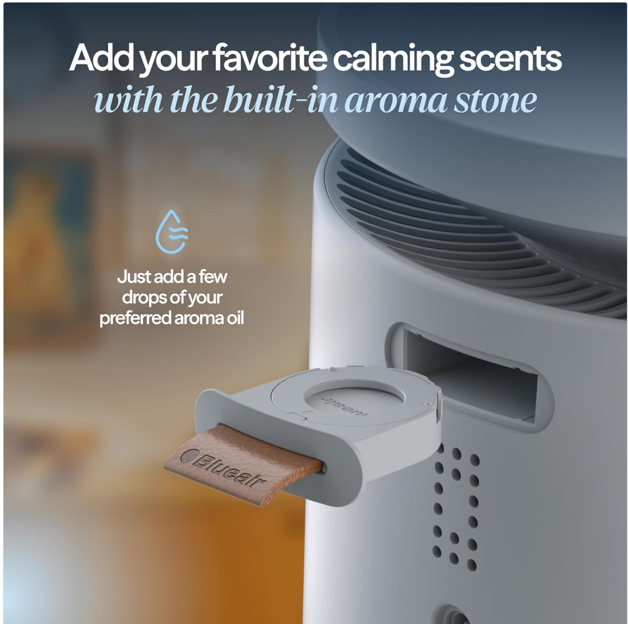
Image: Close-up of the aroma stone being placed into its designated slot on the humidifier.

The humidifier will diffuse the scent into the air during operation.