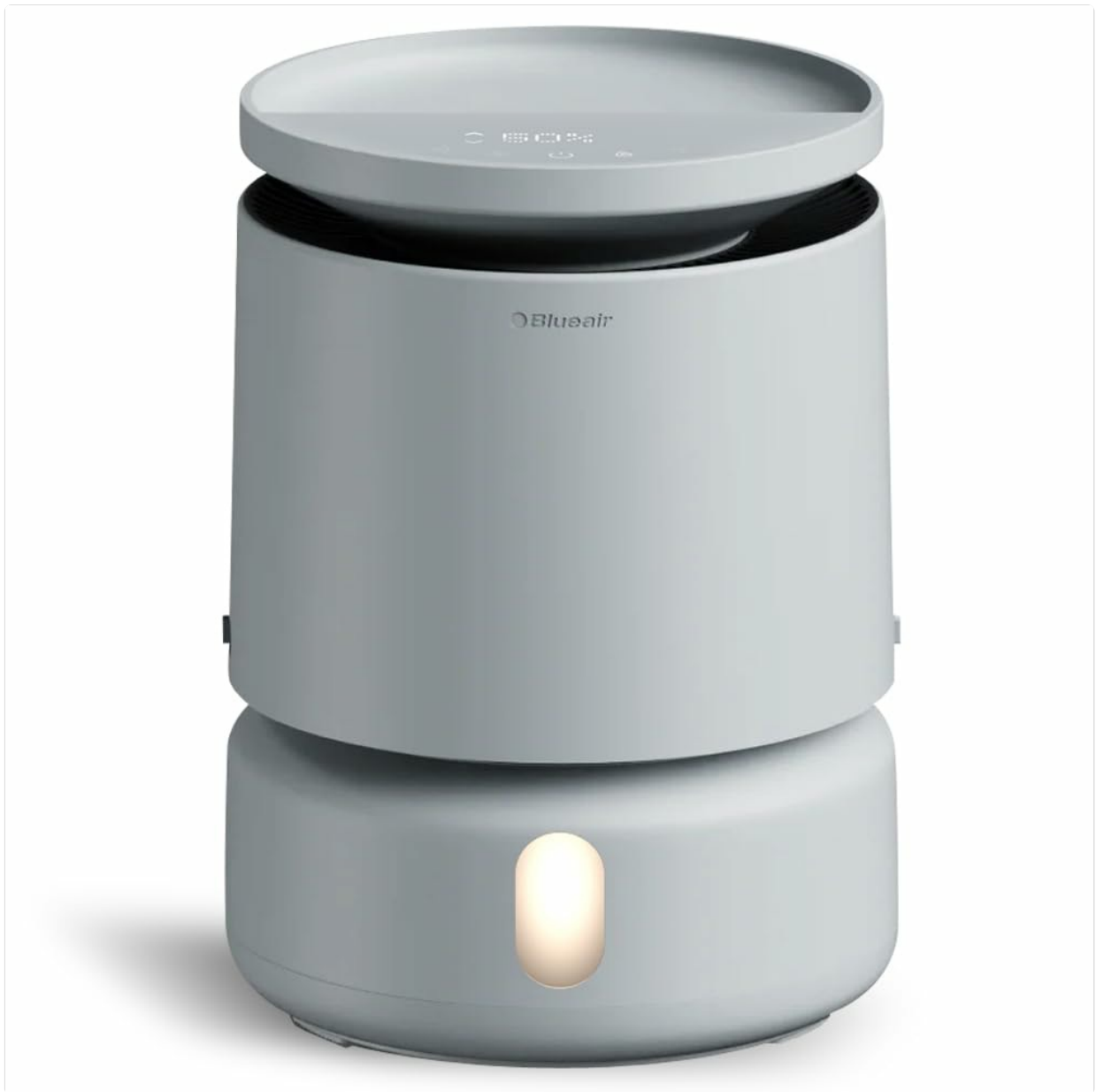
Image: Front view of the BLUEAIR DreamWell Humidifier.