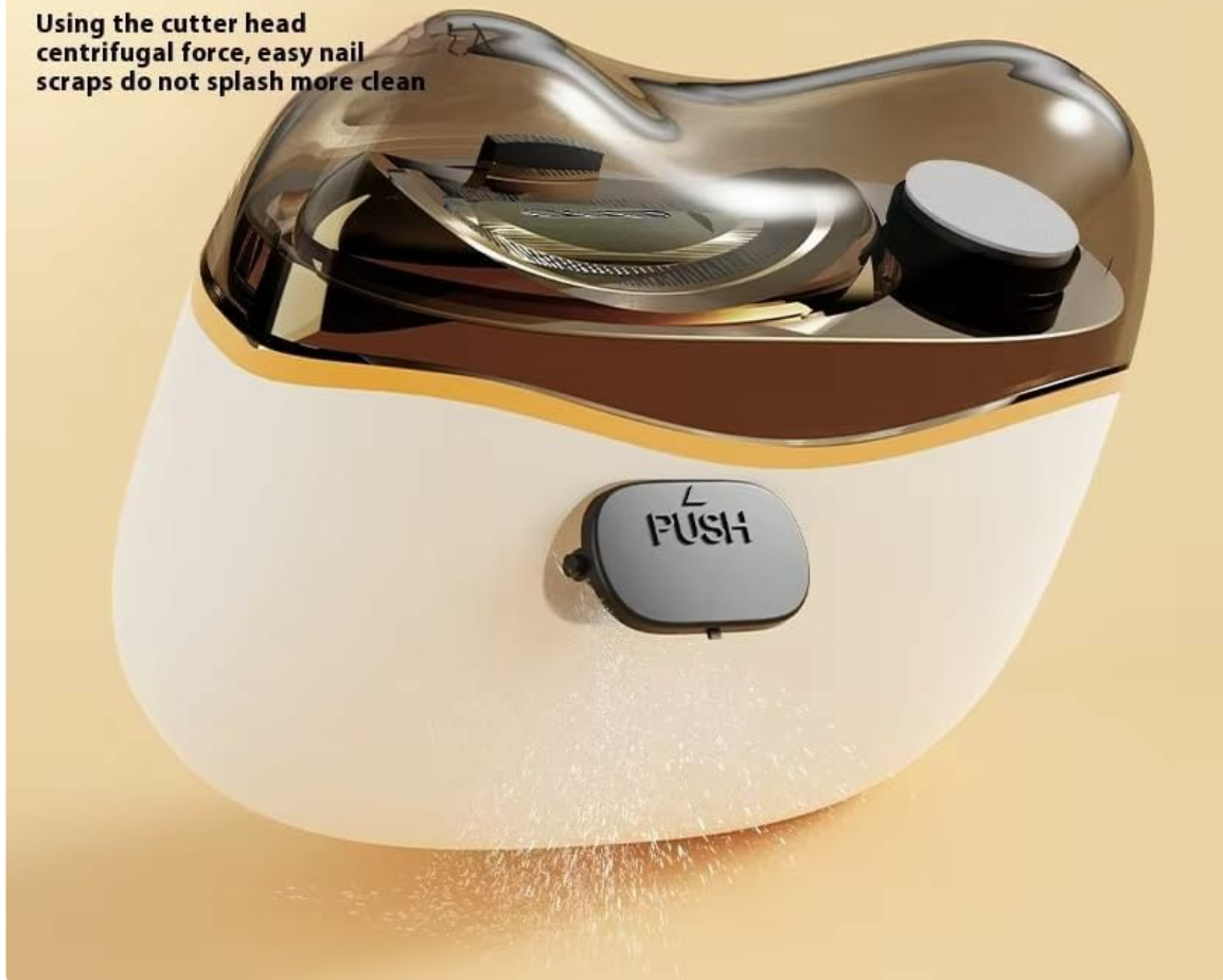
Figure 8: Nail Debris Collection Compartment

Using the cutter head centrifugal force, easy nail scraps do not splash more clean