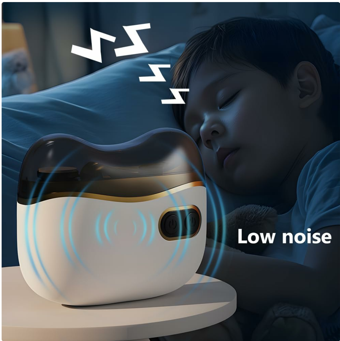
Figure 7: Quiet Operation for Undisturbed Use