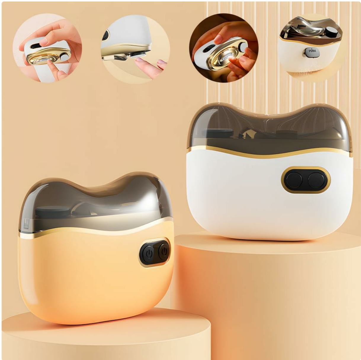
Figure 2: Two Generic 2-in-1 Electric Nail Clippers in different colors (Orange and White)