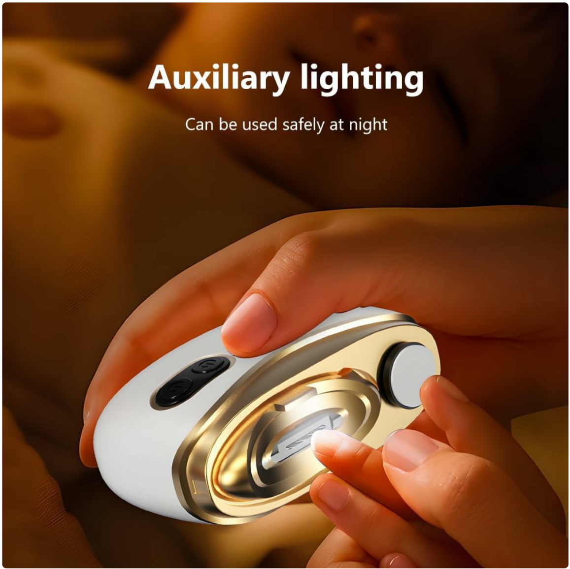
Figure 5: Auxiliary Lighting for Polishing