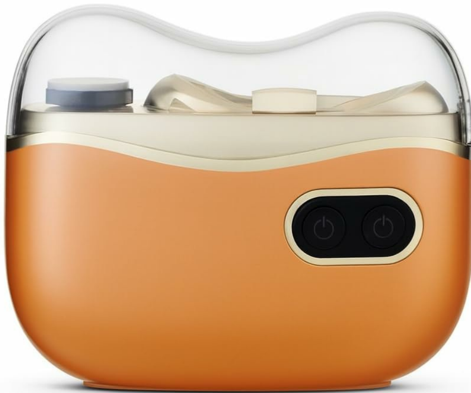
Figure 1: Generic 2-in-1 Electric Nail Clipper (Orange)