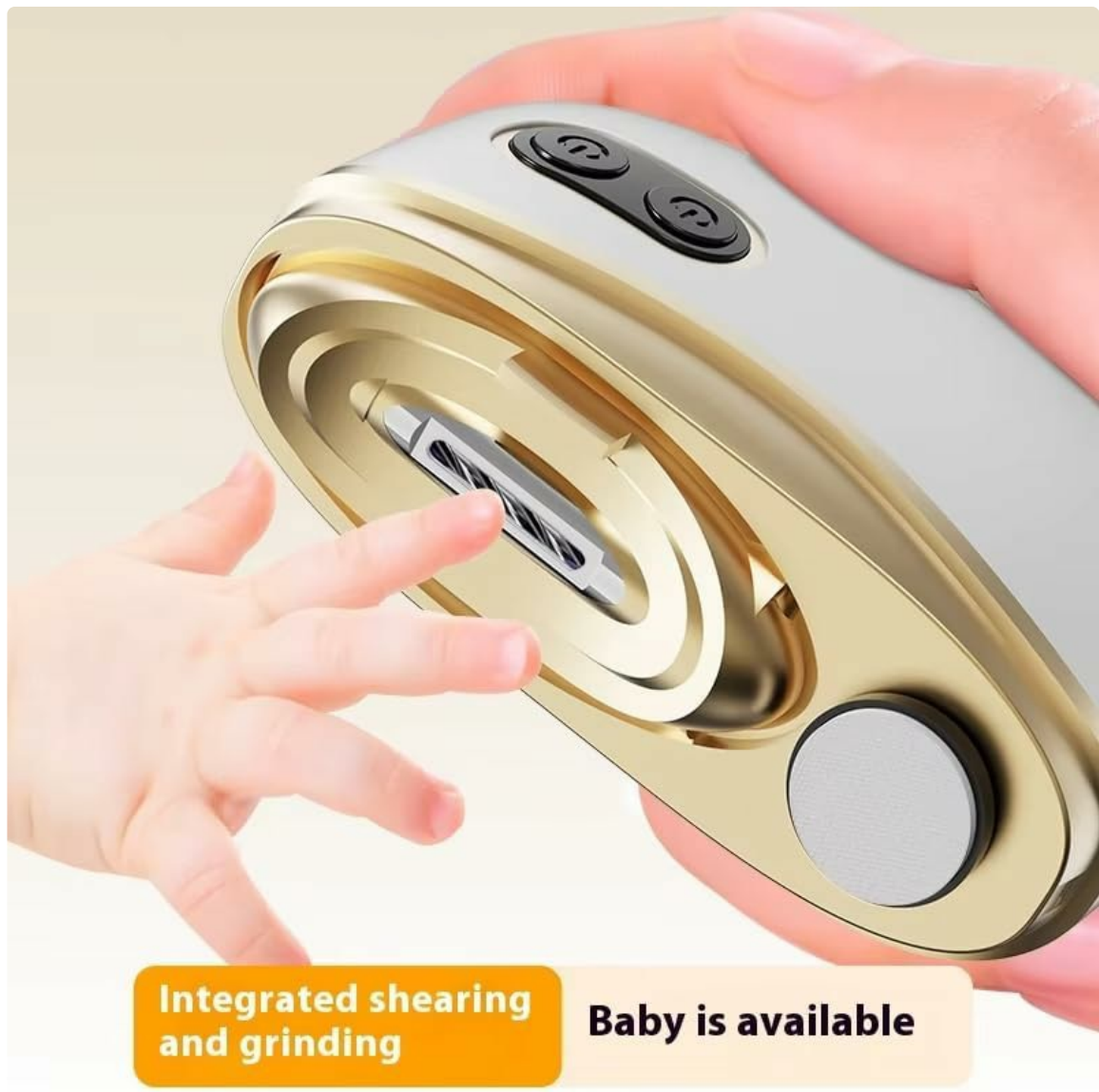
Figure 6: Integrated Shearing and Grinding Function