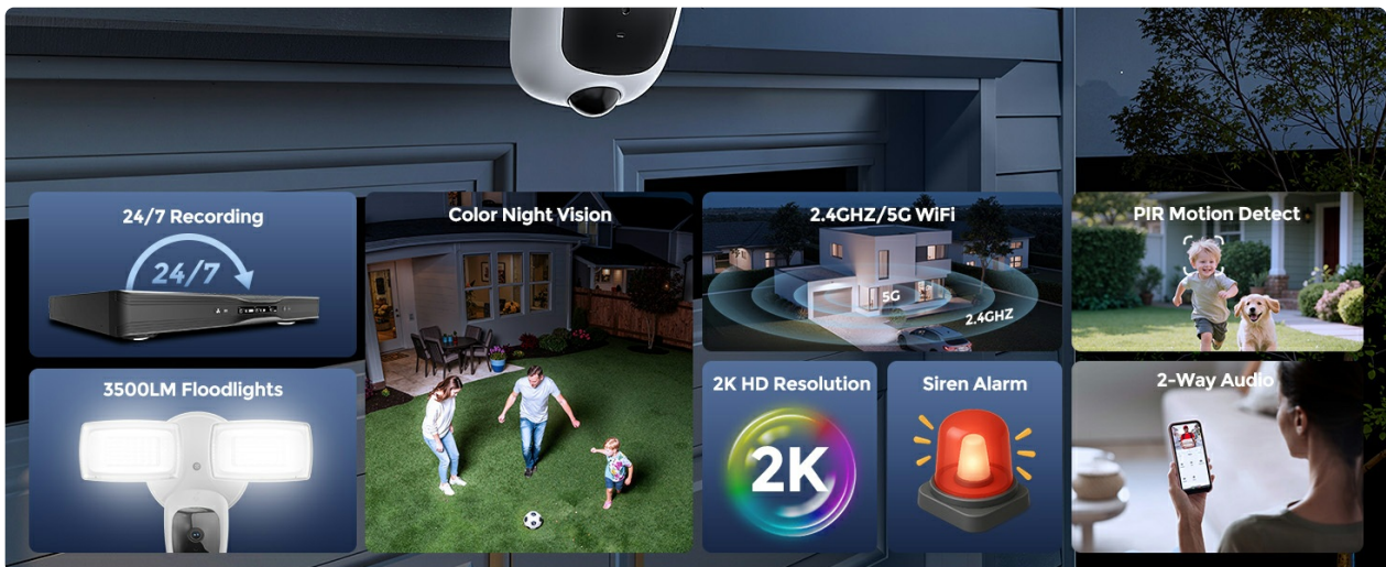
Image: Demonstrates the camera's crystal clear 2K resolution and color night vision, capable of capturing fine details like a car's license plate at night.

The camera captures sharp 2K QHD (Quad HD) video details 24/7. With built-in floodlights, it provides full-color footage even in total darkness, enhancing identification of objects and individuals.