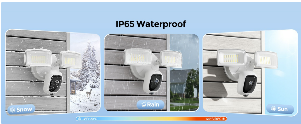
Image: The camera is shown in various weather conditions (snow, rain, sun), emphasizing its IP65 waterproof and weatherproof design.