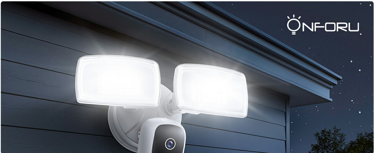
Image: The Onforu 2-in-1 Security Camera and Floodlight, highlighting its 3500 lumens brightness compared to a 2000 lumens alternative.

This manual provides comprehensive instructions for the installation, operation, maintenance, and troubleshooting of your Onforu 2K Hardwired Floodlight Camera (Model BDR35SX-2). This device combines a high-resolution 2K camera with powerful motion-activated floodlights to enhance your outdoor security. It features 5G/2.4G WiFi connectivity, color night vision, two-way audio, a siren, and 24/7 recording capabilities, all within an IP65 weatherproof design.