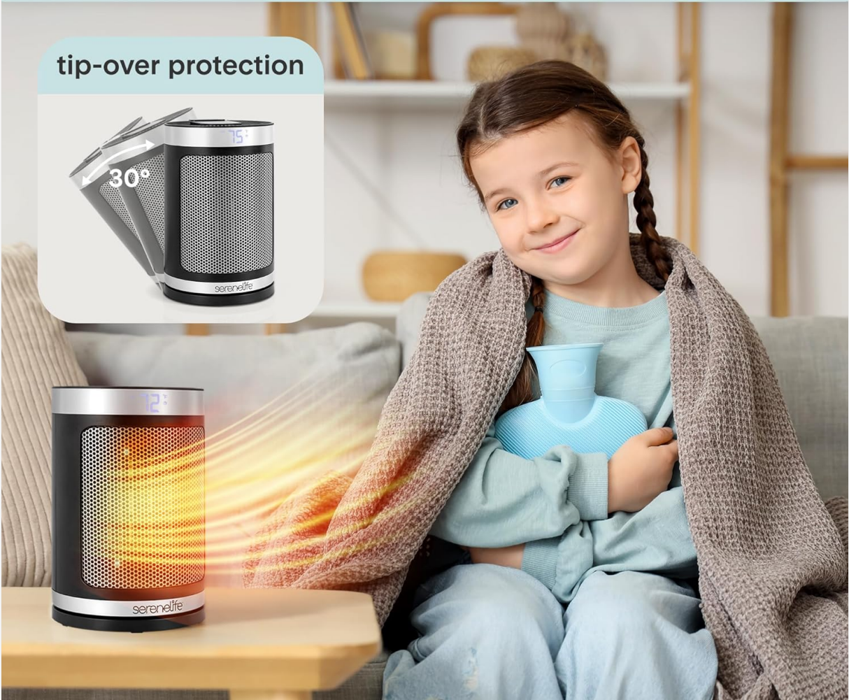
Figure 1: Front view of the SereneLife Smart Space Heater, showing the main grille and base.