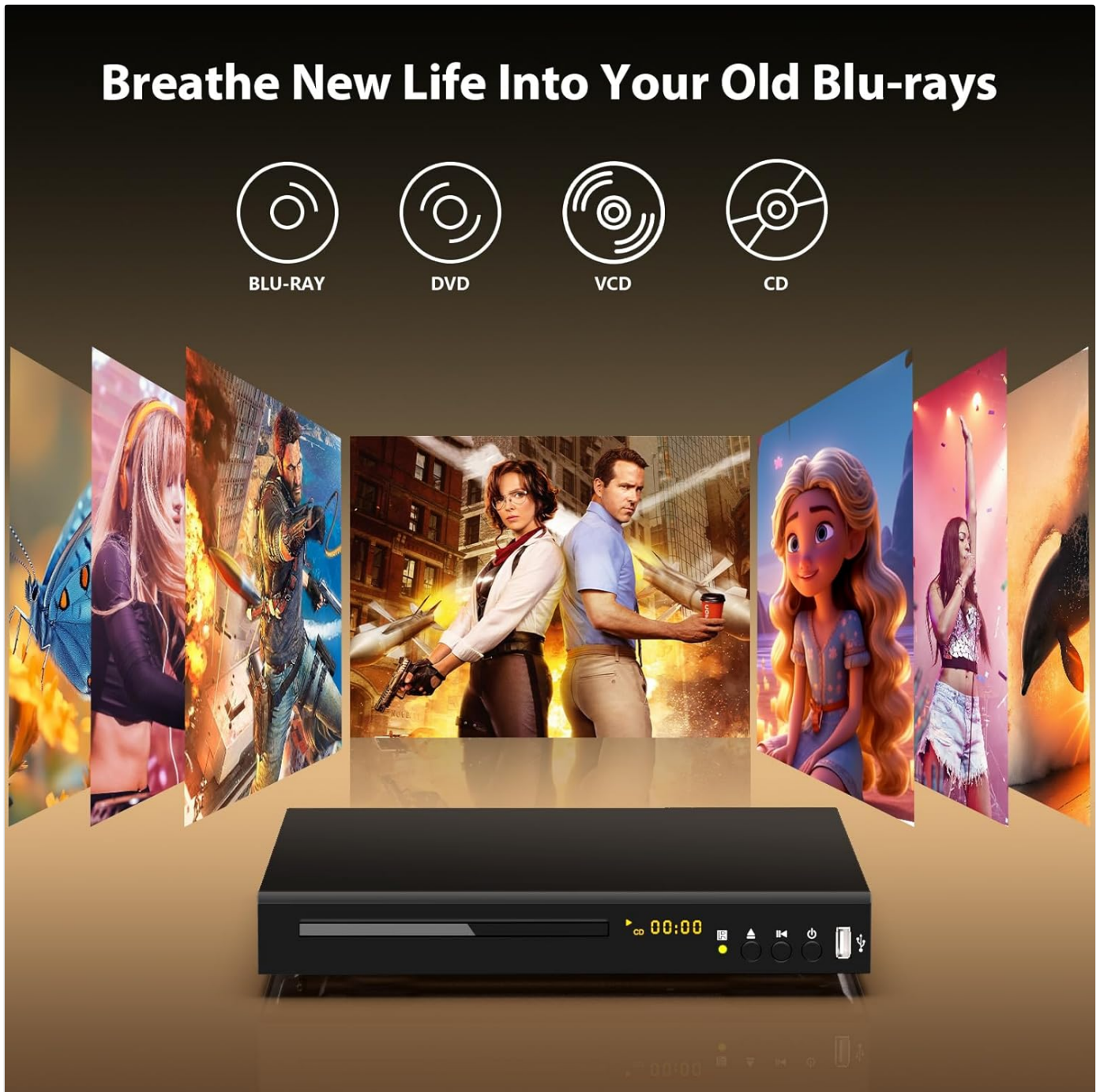
Image: The Blu-ray DVD player showcasing its compatibility with various disc formats including Blu-ray, DVD, VCD, and CD.