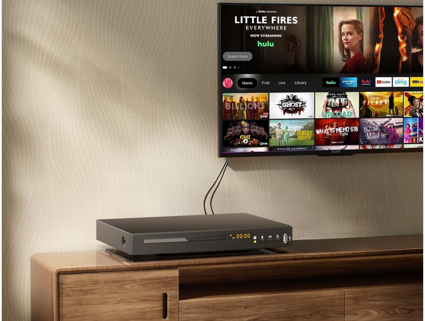
Image: Front panel of the Blu-ray DVD player, featuring the disc tray, digital display, power button, play/pause, stop, eject buttons, and a USB port.