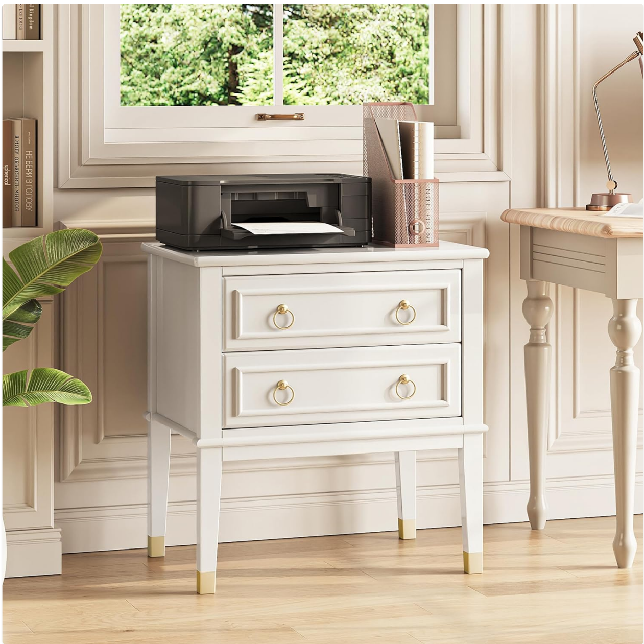
Image: Representation of the nightstand's smooth, durable painted finish.