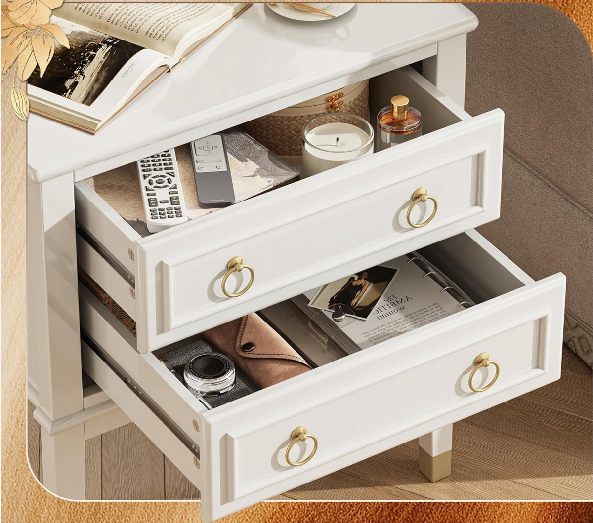
Image: The nightstand with both drawers open, demonstrating storage capacity.