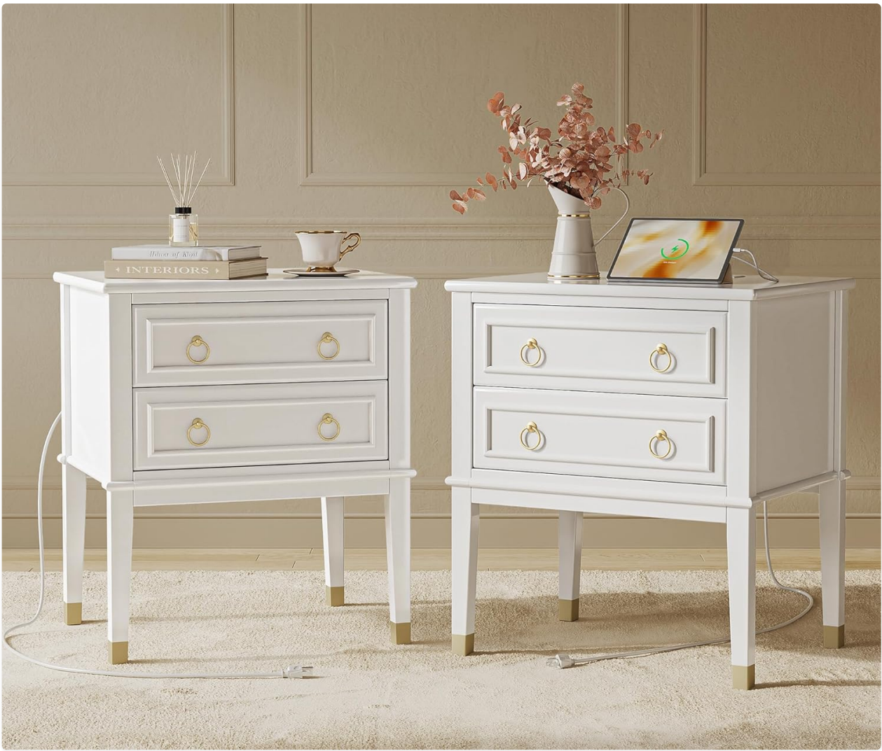
Image: The Huuger 27.6 Inch Tall Nightstand in white, showcasing its design and features.