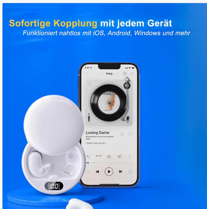
Image 3.2: Instant pairing with a smartphone, compatible with iOS, Android, and Windows.