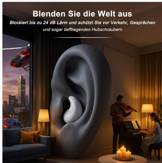
Image 2.2: The compact and lightweight design of a Mindbud earbud.