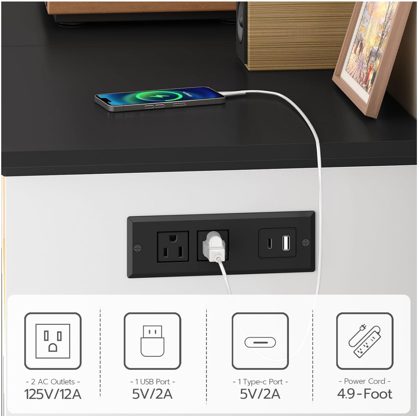
Image: Detailed view of the charging station, showing the types of outlets and ports available.