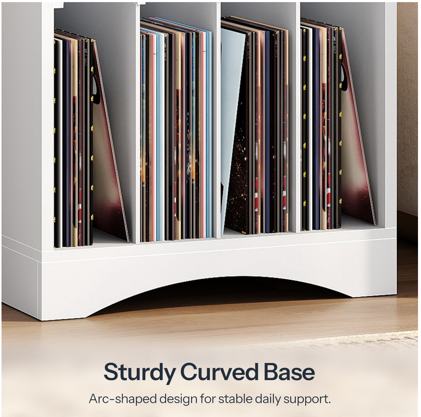
Image: The compact record holder section, demonstrating how albums are organized into four distinct sections.