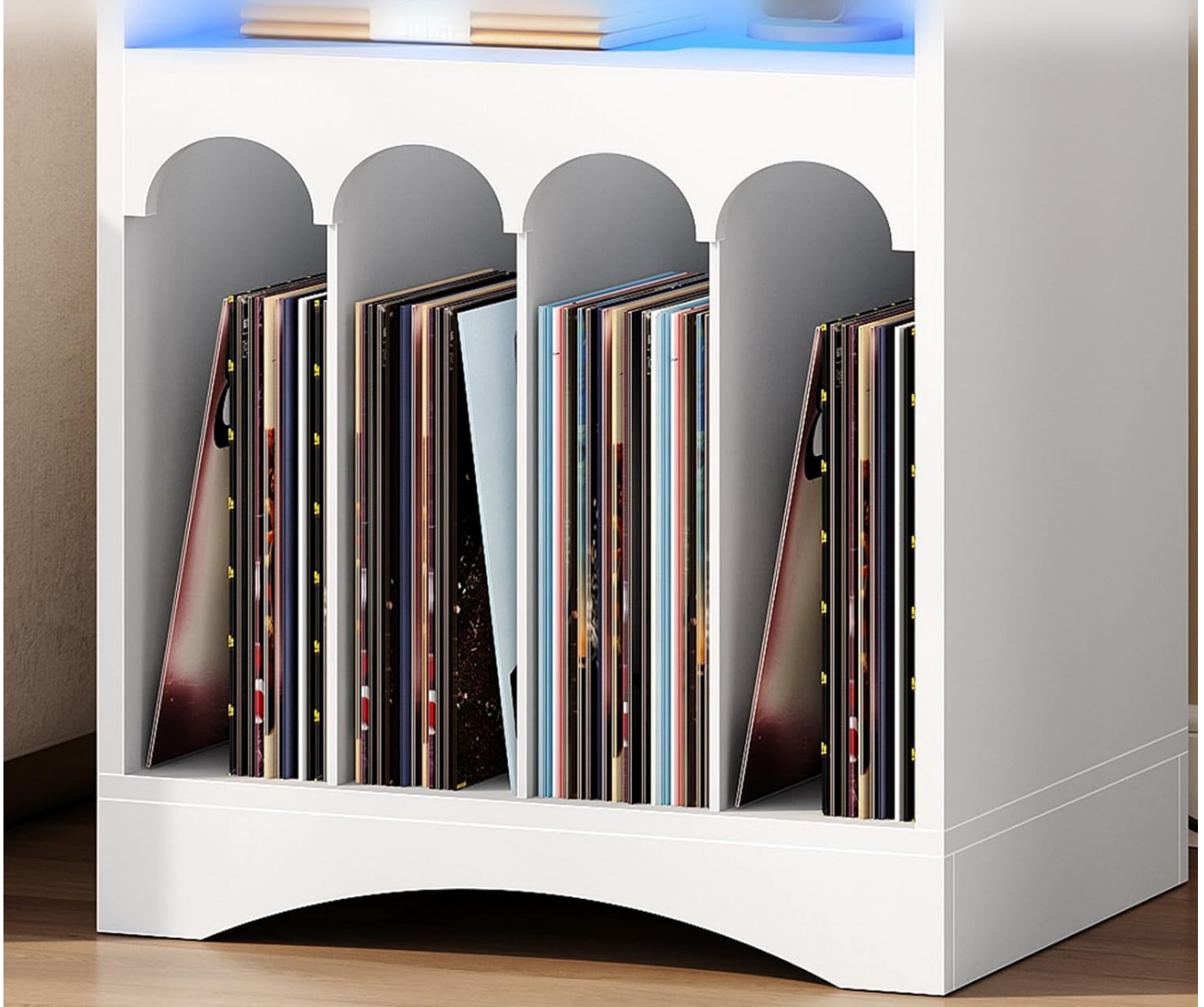
Image: Detail of the arc-shaped base, highlighting its design for stability.