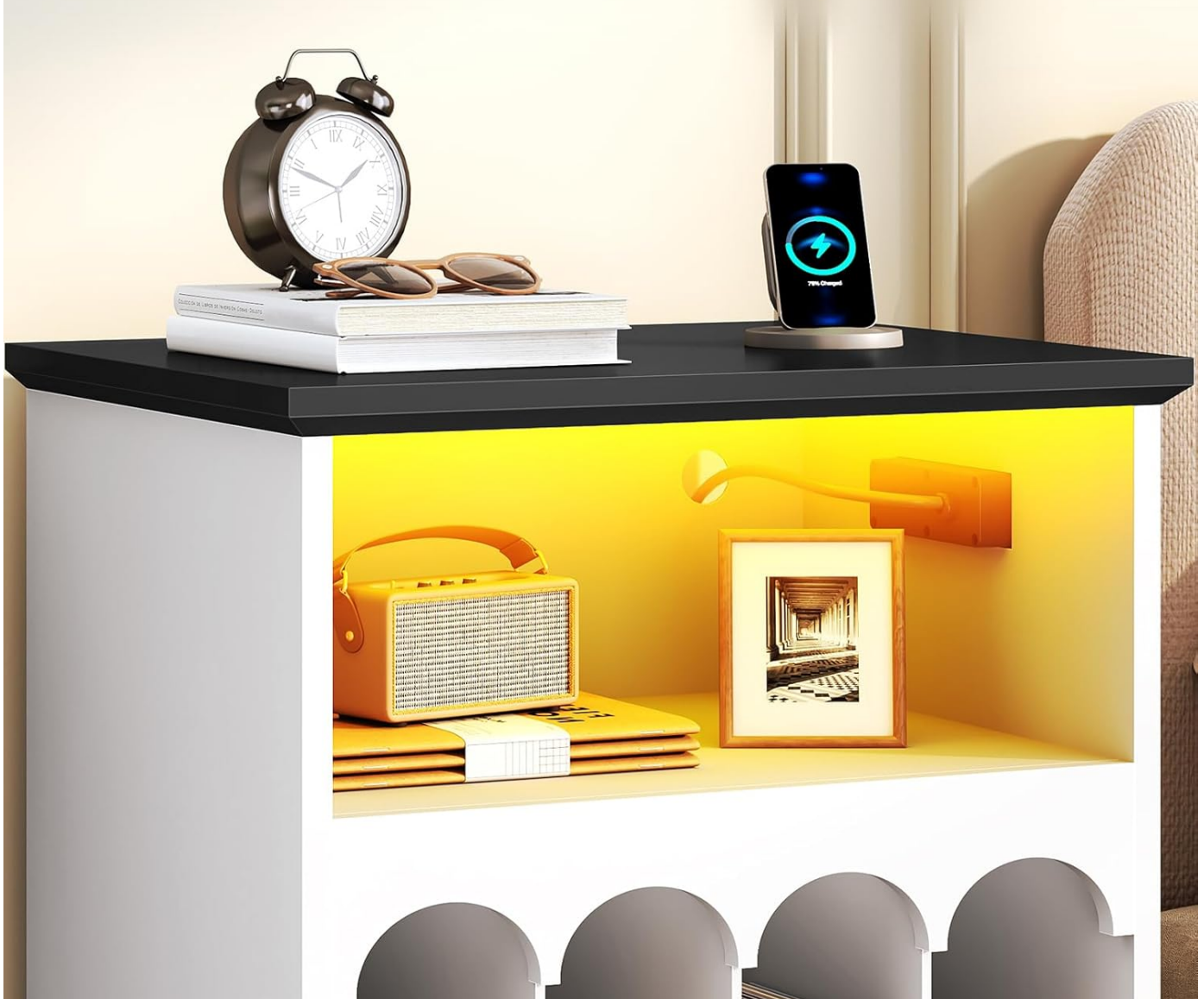
Image: The integrated cable hole for organized wire management, with a phone charging on the top surface.

Back panel hole for tidy cord management.