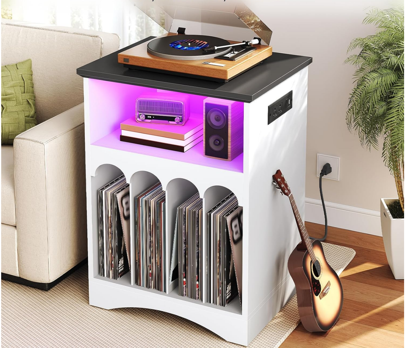
Image: The HOOBRO Farmhouse Record Stand in a living room setting, showcasing its design and functionality.