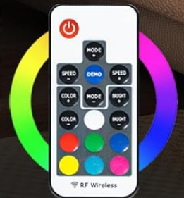
Image: The record stand with its LED lights set to a warm yellow, accompanied by the remote control for customization.