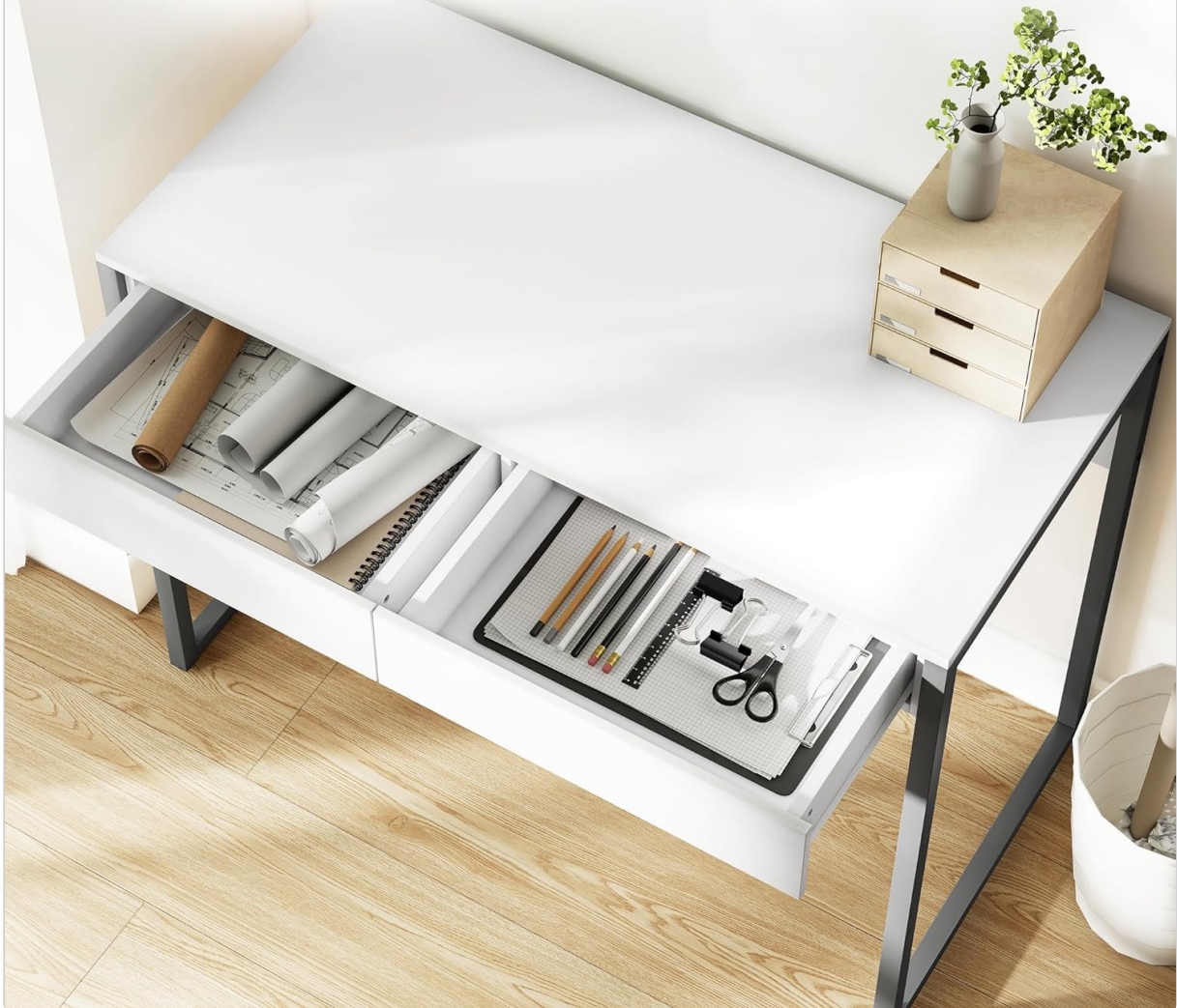
Image: An overhead shot of the desk with both drawers open, showcasing their capacity to store small work essentials such as paper rolls, notebooks, pens, and scissors, keeping the tabletop tidy.

Tuck small work essentials neatly out of sight