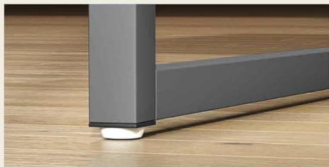
Adjustable Foot Pads