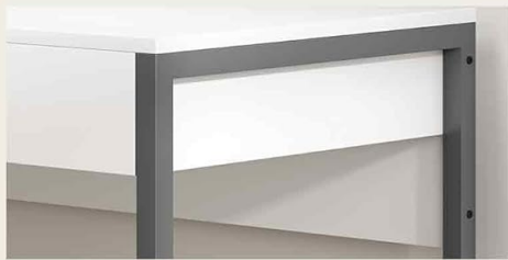
Robust Steel Legs