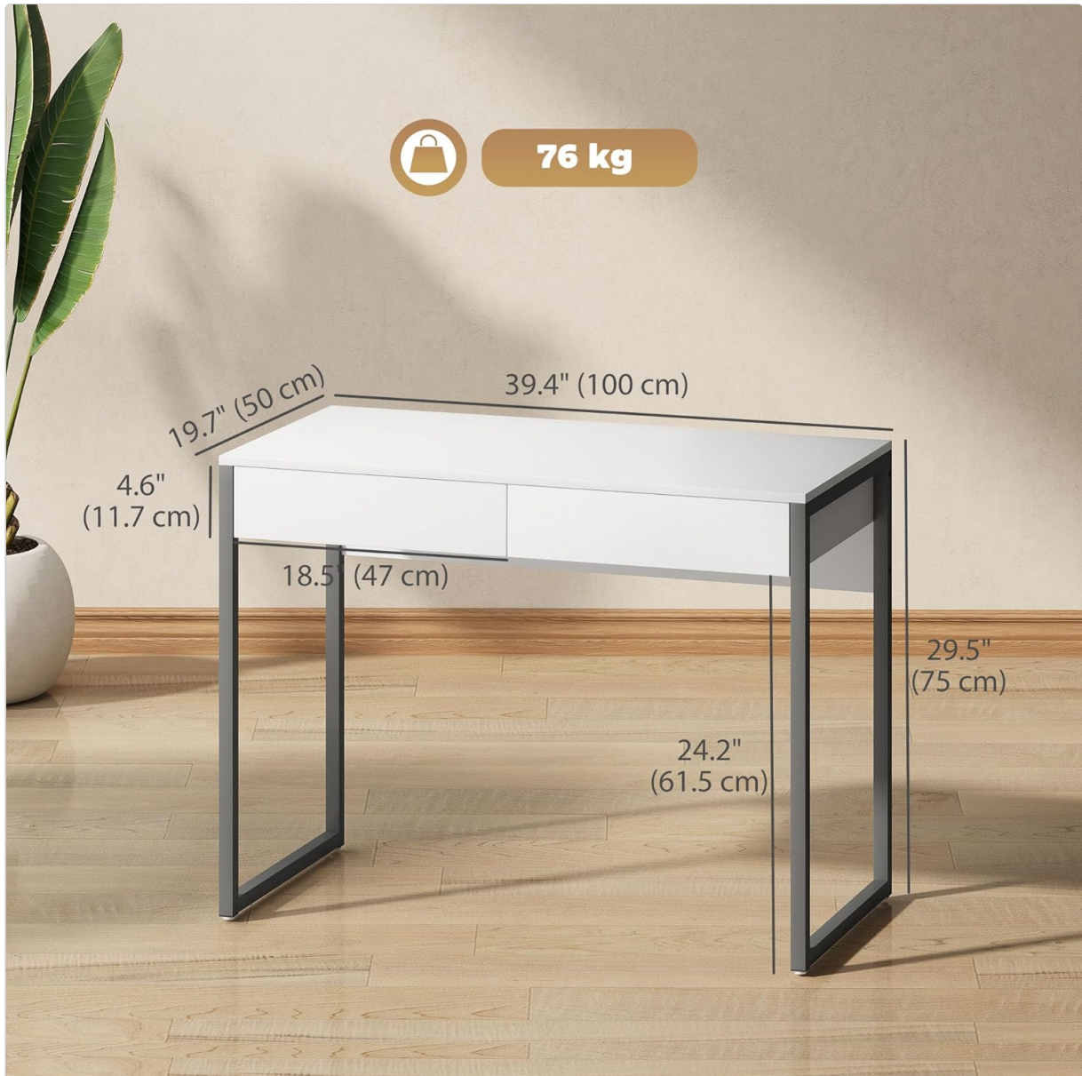
Image: A diagram illustrating the dimensions of the desk: 39.4 inches (100 cm) wide, 19.7 inches (50 cm) deep, and 29.5 inches (75 cm) high. It also shows the drawer height and leg clearance.

Unpack all components and lay them out on a clean, soft surface. Identify each part using the labels provided in the packaging and the instruction manual.