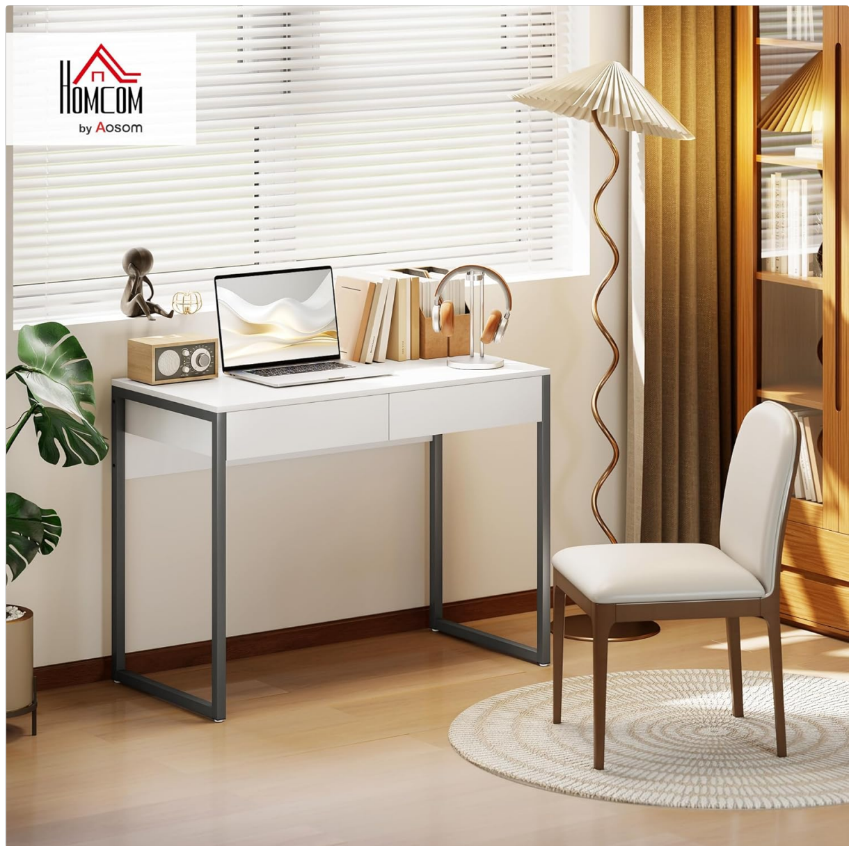
Image: The HOMCOM High Gloss Computer Desk in a home office setting, showcasing its compact design and functionality with a laptop, lamp, and headphones on its surface.